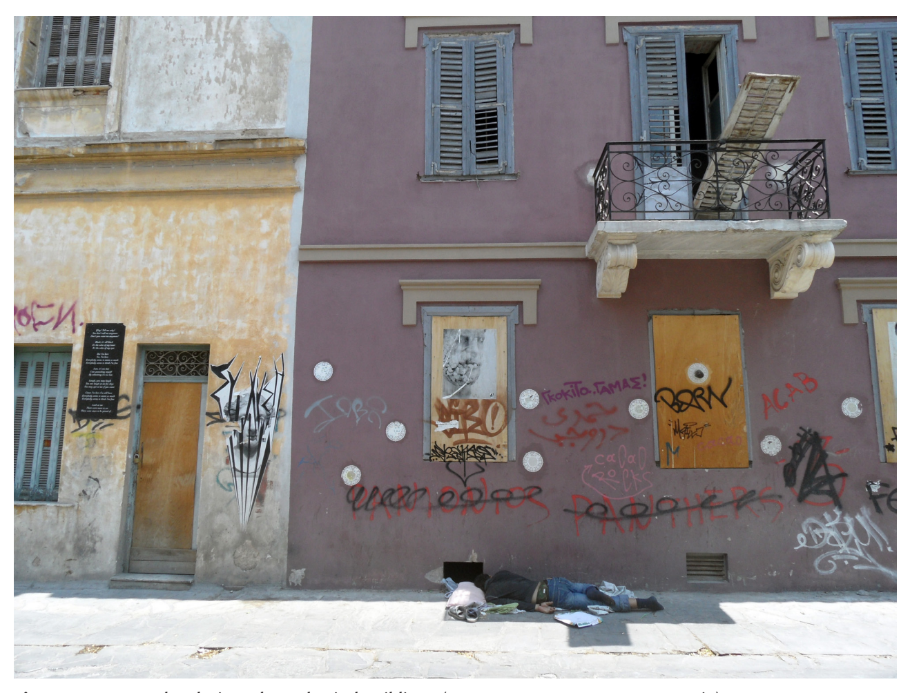
Figure 3: Renovated and Disused Neoclassical Buildings. (15–17 Iasonos Street, Metaxourgeio)

Art. 19, page 4 of 10 Leventis: Walls of Crisis