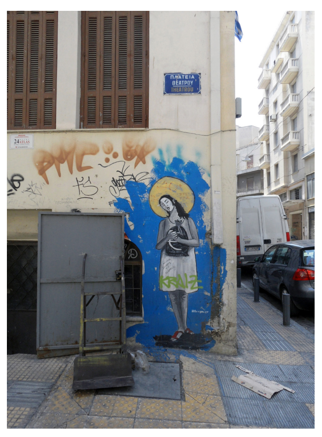
Figure 6: bleeps.gr. "Forty Years of Debtocracy", 2011. (Plateia Theatrou, Psyrri)

One characteristic example of site-specific work in the area of study is that of the artist Sonke,19 who proclaimed that 'of course I am influenced by Athens, the cityscape and the people of Athens [...], that is the reason for having sadness behind my work: Behind their smiling faces on Saturday nights, most of the people here are sad' (Gelly 2011). But as the crisis engulfed the city, Sonke was going through a more personal strife. The localization of Sonke's 'sad princesses' or 'weeping mermaids' of 2009-10, expressions of a world of love and betrayal, can perhaps be traced to a recent romance and separation, after which he started creating teary-eyed girls and flowers on the walls of buildings his ex-girlfriend frequented, or along streets she passed from [fig. 5].<sup>20</sup> Be that as it may, Sonke's numerous 'hurt and pathetic lovers'21 earned him quick and broad recognition, largely thanks to the careful choice of site, often around popular Gazi cultural and entertainment venues.22