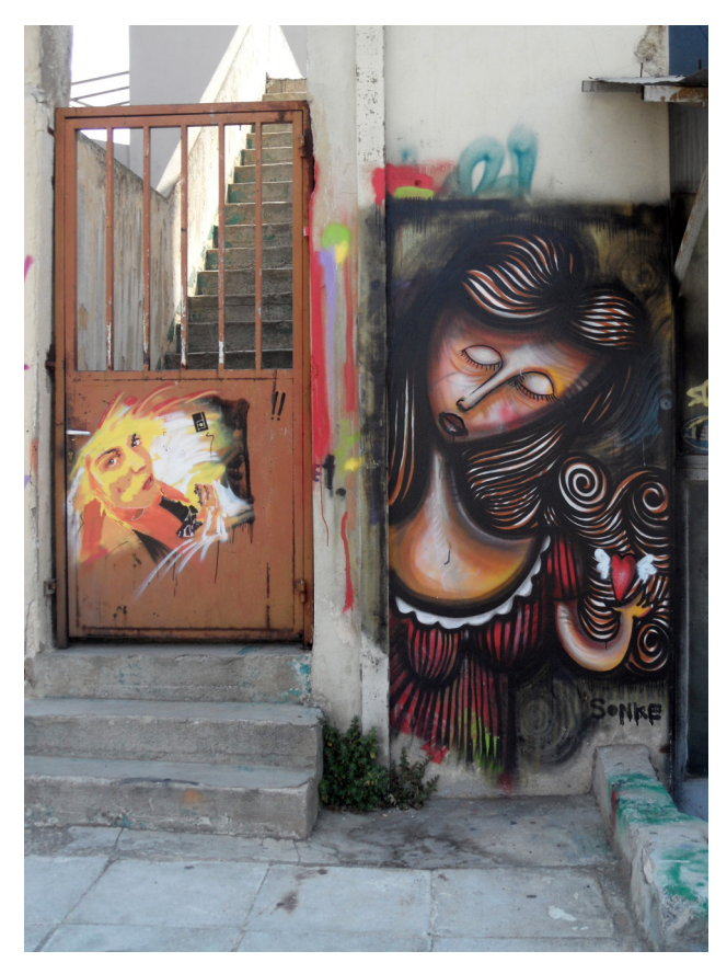
Figure 5: Sonke. "Untitled", 2010. (2 Konstantinoupoleos Street, Gazi)

Art. 19, page 6 of 10 Leventis: Walls of Crisis