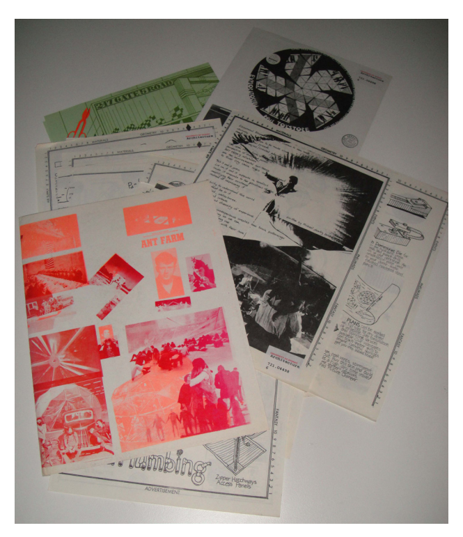
Fig. 2: The 1970 edition of Ant Farm's Inflatocookbook also consisted of loose-leaf inserts originally intended for easy update and replacement.

of inflatables as everyday shelters and transformative mechanisms per se—separate issues in their own right—but the emphatic connection made between the making of inflatables as a mode of experimental DIY architectures and the social transformation invoked by Radical Technology and Ant Farm in Inflatocookbook and Inflatables Illustrated . Furthermore, Inflatocookbook explicitly associated the production of space and the countercultural self with a form of selective consumerism. It included advertisements for products and material suppliers alongside howto information for the do-it-yourselfer. By referring to the ideological, technical, and product guidance throughout Inflatocookbook , the counterculturalist could become a producer not only of space, but of the self: