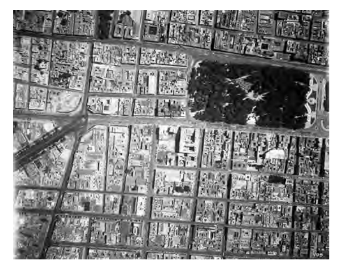
Figure 18: El Caballito Circle from a very low angle in 1936 that shows the beginning of urban transformations just in its northwest corner. Mxim-2–3–3–6, Compañía Mexicana de Aerofoto, Mexico City, 1936. With permission from Fundación ICA, flight 92/195.

given priority over pedestrian traffic, as was construction investment and vertical growth, in spite of the ever present danger of earthquakes, always for the sake of increasing land value which shot literally skyward.