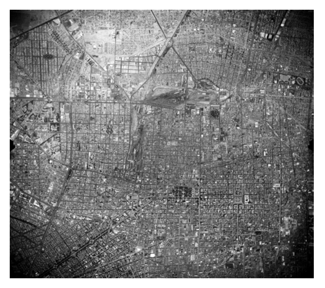
Figure 8: A very high vertical view to show how, by the 1950s, the geographic center has moved west. Mxim-2–3–5–6, Compañía Mexicana de Aerofoto, Mexico City, 1958. With permission from Fundación ICA, flight 553/2.

winter, when the shadows are longest — in which the contrast between the dark shadows and the other textures is so great as to make the pictures resemble openwork as in Figures 6 and 12 — we can clearly observe the vertical extension of the urban landscape and how the heights of the buildings increased in this part of the city, for example from the 1930s to the 1950s, eventually reaching more than 100 meters. This is illustrated by the difference between Figure 13 (1957) and Figure 14 (1936). That is, it is relevant to analyze the different textures in the photograph to note whether these black areas are simply the long shadows cast by high buildings, or green spaces which also decrease over time. This is clearly seen if we compare Figure 15 (1934) with Figure 8 (1958). We can see, as a specific example, how the Tívoli del Eliseo park