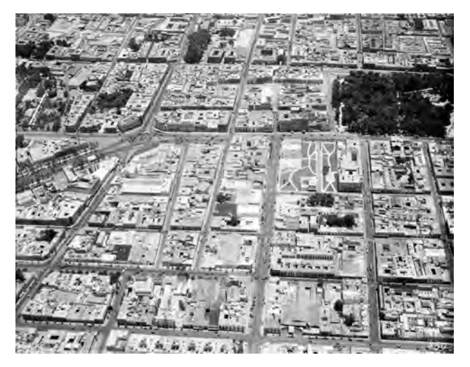
Figure 7: Oblique view to north of El Caballito Circle. Mxim-2–3–3–2, Compañía Mexicana de Aerofoto, Mexico City, 1932. With permission from Compañía Mexicana de Aerofoto, 450b.

In fact, one of the most visible contributions of aerial photography is due to the shadows seen in the photographs. In a longitudinal series of photographs shot in