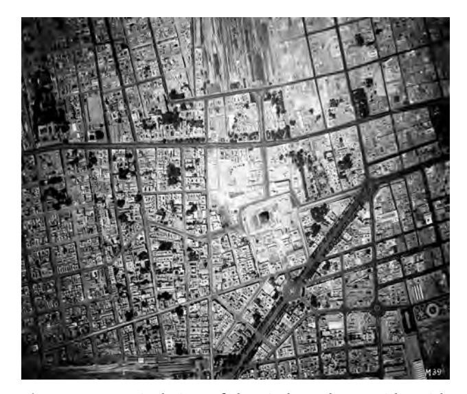
Figure 15: Vertical view of the circle and west side, with the last green spaces that will disappear. Mxim-2–3–3–5, Compañía Mexicana de Aerofoto, Mexico City, 1934. With permission from Fundación ICA, flight 89–90/39.

construction towards the sky. In addition, many private interests erected tall buildings, and eventually the circle became the site of some of the tallest buildings – the most recently constructed, the Torre de Caballito (1988) stretches up thirty-four stories – and one of the most pedestrian-unfriendly intersections in the city;<sup>36</sup> that is, one of the many places that, for the last half century, have been driving pedestrian traffic away.