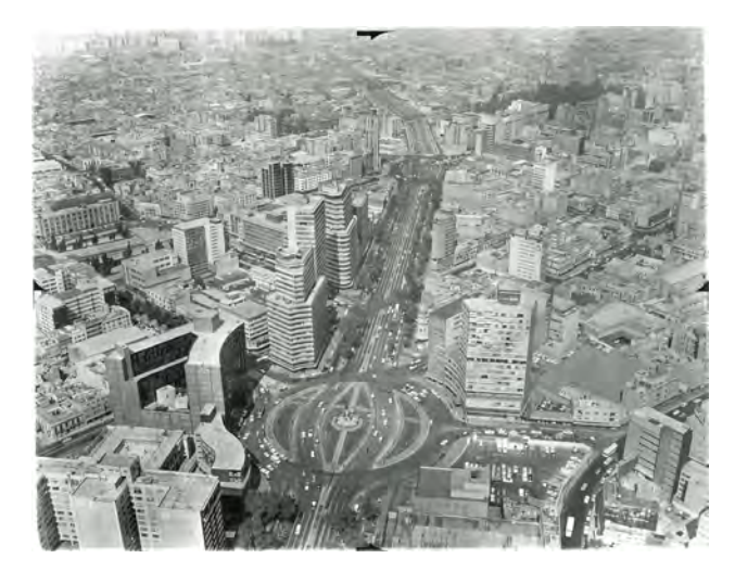
Figure 9: Oblique view, since Reforma Avenue just opened, in the early 1960s, to the northeast through El Caballito Circle, each day more elliptical. Mxim-2–3–6–1, Compañía Mexicana de Aerofoto, Mexico City, ca. 1964. With permission from Compañía Mexicana de Aerofoto, wo/r.