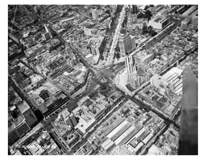
Figure 3: The verticality starts at El Caballito Circle, in the last years of the 1940s. Mxim-2–3–4–5, Compañía Mexicana de Aerofoto, Mexico City, July 6, 1949. With permission from Fundación ICA, flight 6097.

led to a race for maximum efficiency and precision, which meant experimenting with increasingly better equipment. Competition was fierce to see who could be the most skillful at producing the best quality photographs. Pilots had to fight drift and fly straight lines as accurately as possible.