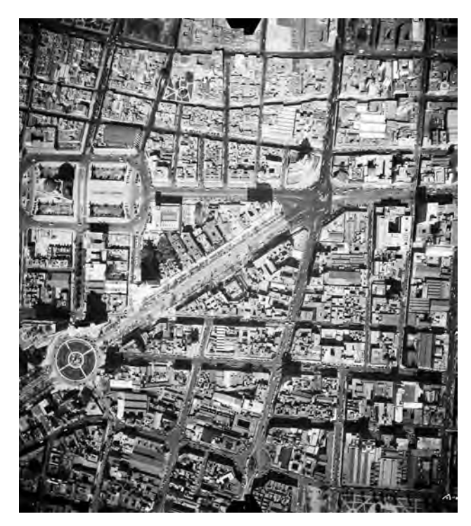
Figure 6: A vertical and low view of El Caballito Circle, near the end of the 1940s. Mxim-2–3–4–9, Compañía Mexicana de Aerofoto, Mexico City, December 3, 1949. With permission from ICA Foundation, flight 418-AC2.

uses of aerial photography. Depending on the number of flights, a mosaic could involve dozens or even thousands of photographs for a single area. The greater the scale, the more negatives, since they are taken closer to the ground.