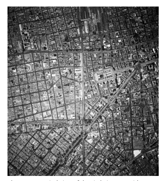
Figure 13: Vertical view of the circle in 1958 with a west side very different from the 1930s. Mxim 2–3–5–5, Compañía Mexicana de Aerofoto, Mexico City, 1958. With permission from Fundación ICA, flight 593D-1.

on, the attracting center began to disperse into many small centers, with unbridled growth that proliferated unchecked throughout the second half of the twentieth century, as the city became a metropolis of many cities fused together.