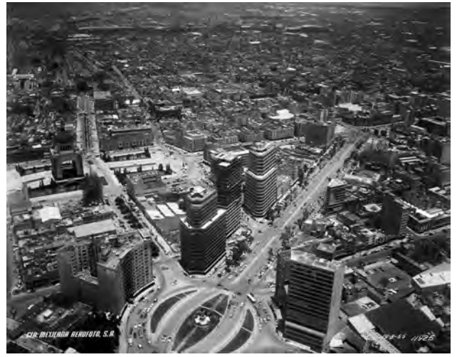
Figure 4: Southwest side of El Caballito Circle, while Reforma Avenue is growing up in the 1950s. Mxim-2– 3–5–1, Compañía Mexicana de Aerofoto, Mexico City, August 19, 1955. With permission from ICA Foundation, flight 11925.

What is most noteworthy here in respect to the origins of aerial photography, especially the intentions behind these photographic records, particularly vertical or overhead types of shots, is that they originated from the desire to defend and keep watch over Mexican territory, and were subsequently applied mainly in urban topography and mapping. The photographs were therefore made with the goal of enabling the greatest possible detail, whether they were wide views from a great height to be used to construct maps or closer views from low flights to detect even the smallest change in a lot or construction project. By this time, the uses of oblique views in Mexico – less rigorous and more spontaneous, technically simpler and more aesthetically appealing - focused more on advertising, publicity and promotion of urban areas, for their attention-drawing nature. Considering different types of