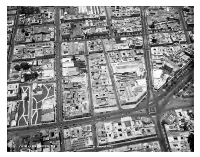
Figure 1: Oblique view to the south of El Caballito Circle in the early 1930s. Mxim-2–3–3–1 (mx = Mexico; im = Instituto Mora; 2 = El Caballito Collection; 3 = Aerial Documentation Group), Compañía Mexicana de Aerofoto, Mexico City, 1932. With permission from Compañía Mexicana de Aerofoto, 449.

It is important to take a closer look at what we can learn from aerial photographs, as Chombart did over half a century ago (Krauss 2002: 26). To begin, he notes the limitations of aerial photographs taken at angles, from the ground, of 30° or 60° as compared to the optimum