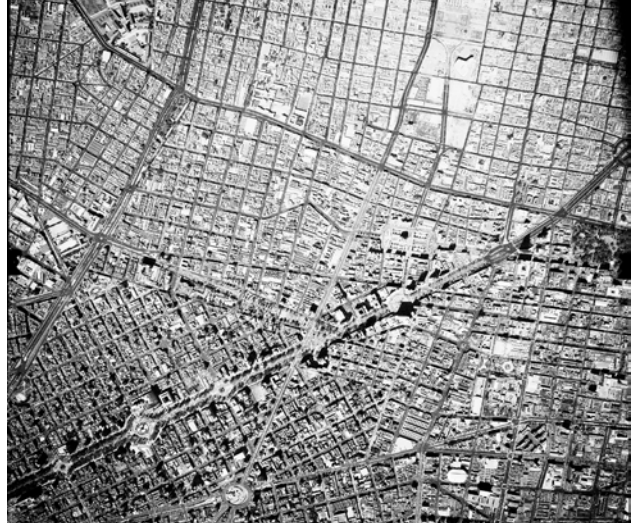
Figure 16: Vertical view of the Circle and east side with part of the new Reforma Avenue to north. Mxim-2–3–6–4, Compañía Mexicana de Aerofoto, Mexico City, 1963. With permission from Fundación ICA, flight 1821.

To conclude, it is worth noting that if one of the first flights made by Compañía Mexicana de Aerofoto in