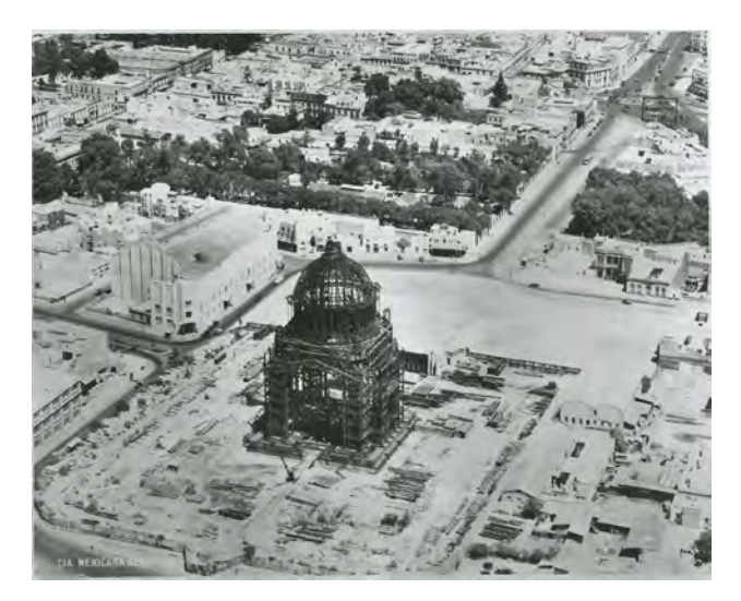
Figure 2: The west side of El Caballito Circle at the beginning of 1930s. Mxim-2–3–3–3, Compañía Mexicana de Aerofoto, Mexico City, 1932. With permission from Compañía Mexicana de Aerofoto, 403.

angle of 45°. This is clearly seen if we compare, for example, Figure 1 with Figure 2 . The vertical planes can be seen much better in the latter, since an oblique view, unlike a vertical view, permits a vertical surface to be seen. He also notes that a series of consecutive shots, made while circling a site, each differing slightly from the last (which may require more than one overflight),<sup>3</sup> can be extremely useful.