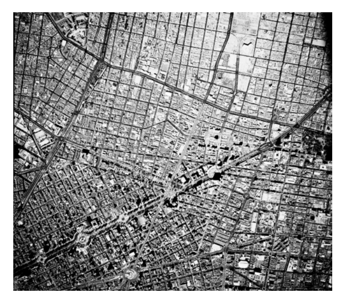
Figure 12: This vertical view from 1972 shows all the circles along Reforma Avenue, from El Caballito to the west. Mxim-2–3–7–1, Compañía Mexicana de Aerofoto, Mexico City, March 18, 1972. With permission from Fundación ICA, flight 2346/21.