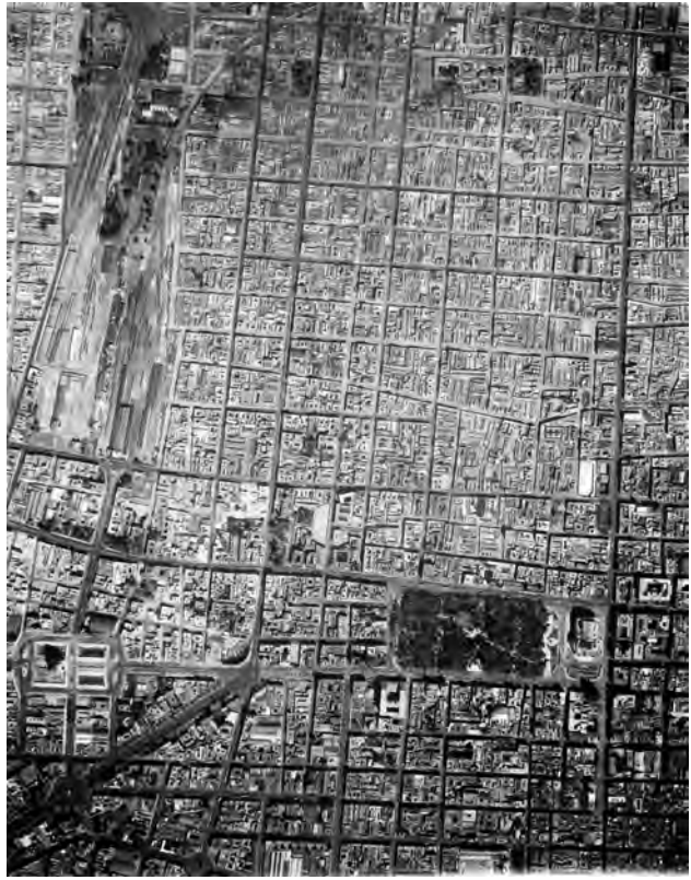
Figure 14: Vertical view of the circle, north side, in the 1930s. Mxim-2–3–3–4, Compañía Mexicana de Aerofoto, Mexico City, 1936. With permission from Fundación ICA, flight 91/86.

Thus, as shown by the photographs taken from the air, this space began as a place where streets and people met and came together,<sup>35</sup> but that characteristic faded away through the course of the twentieth century. It was such an important landmark that it set the standard for the bustling city; its rapid transformation was caused by a powerful interest in controlling the city's urban spaces. In a few short decades, priority given to vehicular traffic and the interests of those who owned the surrounding lands would determine the fate of the circle, its urban design and the buildings around it, as first the National Lottery and later the federal government itself literally pushed