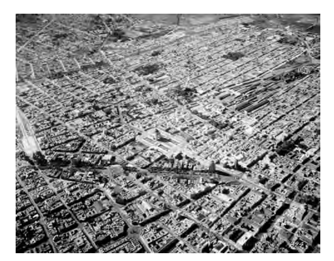
Figure 10: Oblique view of the Circle to north, when urban transformation, in the early 1940s, becomes evident, with the first high buildings. Mxim-2–3–4–1, Compañía Mexicana de Aerofoto, Mexico City, ca. 1940. With permission from Fundación ICA, flight 1794.

disappeared as soon as the National Lottery began construction on the site of the El Moro building by comparing Figure 2 (1932) with Figure 14 . In the former, the gardens and buildings of the Tívoli del Eliseo take up a good part of the photograph while in the latter the foundations of the El Moro Building can be seen and the Tívoli has disappeared altogether. In its place, several new blocks have emerged and there is barely a vestige left of the park as a simple courtyard garden within the ancient Buenavista Palace (1805).<sup>31</sup>