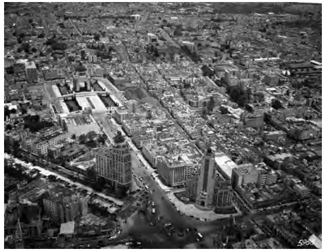
Figure 11: Oblique view of El Caballito Circle in 1949, already showing El Moro and the Corcuera buildings. Mxim-2–3–4–4, Compañía Mexicana de Aerofoto, Mexico City, June 11, 1949. With permission from Fundación ICA, flight 5968.

In pace with the growing city, the circle changed with the transformation of the various streets, avenues and boulevards, and later arterial roads that converged on and departed from it. The route of the Paseo de la Reforma, driving city expansion to the southwest and west, and