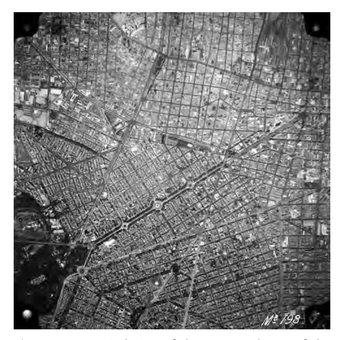
Figure 5: A vertical view of the area southwest of the Circle, crossed by Reforma Avenue. Mxim-2–3–5–4, Compañía Mexicana de Aerofoto, Mexico City, February, 1953. With permission from ICA Foundation, flight 868/198.