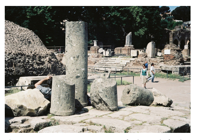
Figure 1: Rome, Forum. Fragments of column shafts that were 12 Roman feet long.

The reader will have difficulty grasping exactly how Vitruvius intended the module to be put to work. The 'method of symmetry' is put into practice by 'taking a