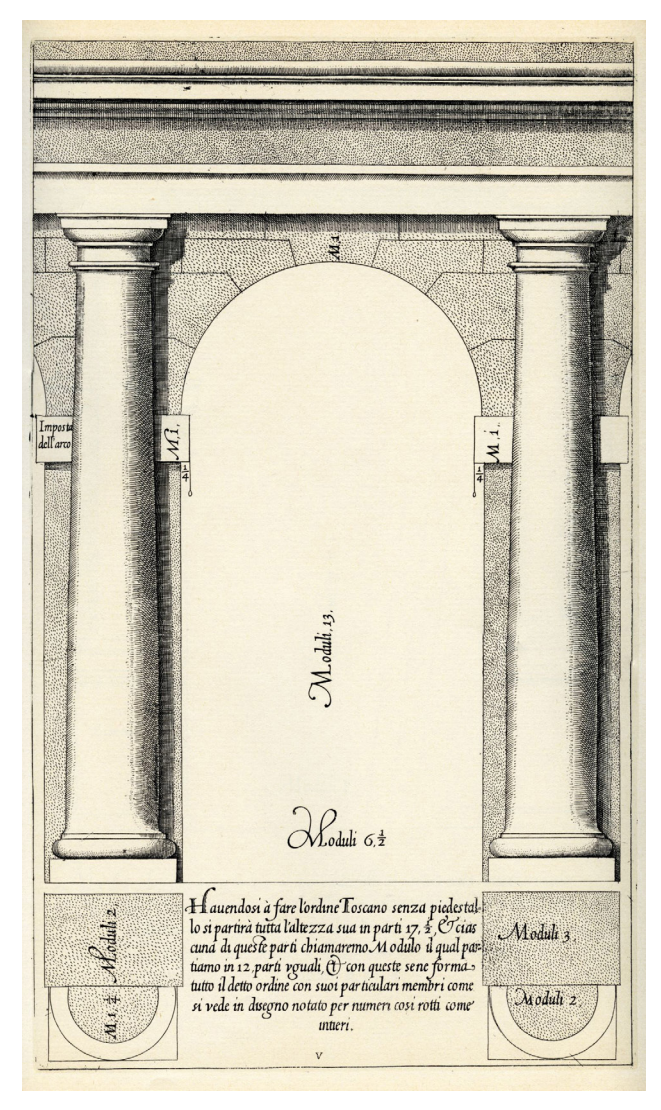
Figure 3: Tavola V from Vignola, Regola delli cinque ordini , 1562.

In Tavola IX ( Fig. 4 ) the Doric order without pedestal is described as 'in its entire length divided in 20 parts; of one of these parts one makes the module, which will then be divided in 12 parts' ('partita tutta la sua altezza in parti 20, di una di queste parti se ne fa il suo modulo, il quale pur si divide in parti 12'). And while discussing the Ionic