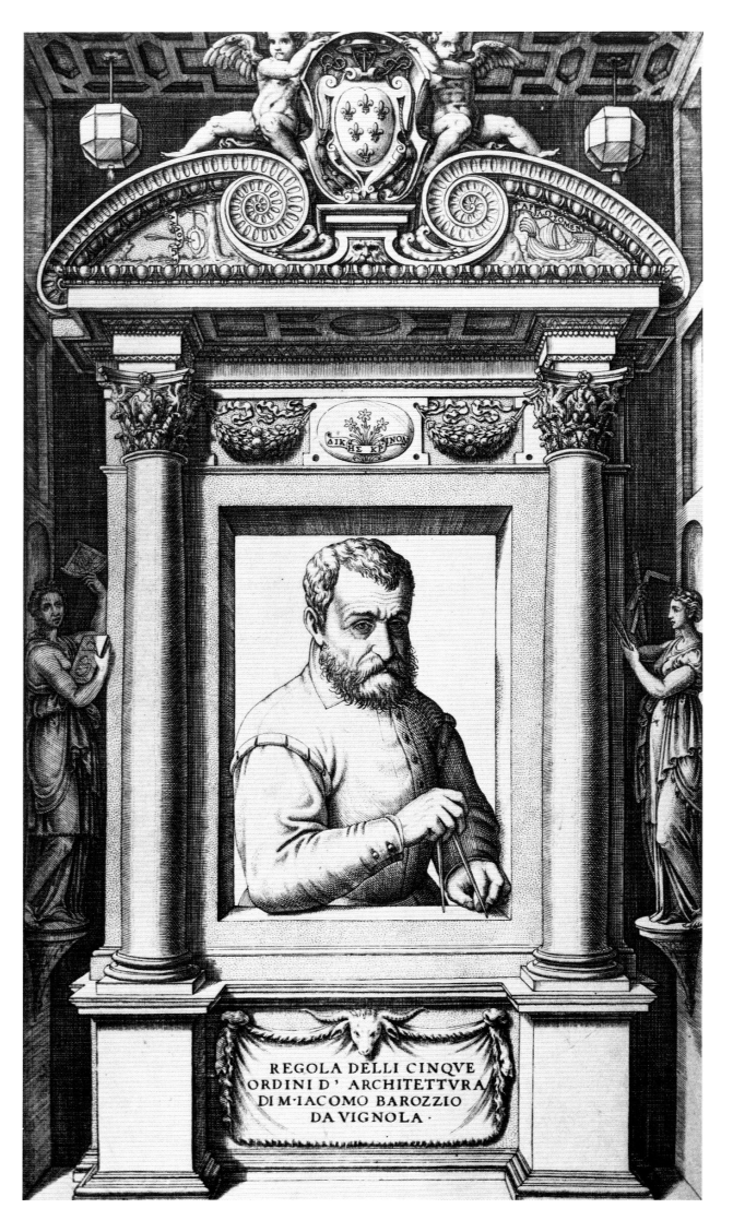
Figure 2: Title page of Vignola, Regola delli cinque ordini , 1562.

Until the second half of the sixteenth century, no real changes can be found in the ways in which authors wrote about the proportions of columns and column shafts. Sebastiano Serlio published the first of his books (Book IV) in 1537, on the five orders, and in it he based his theory on Vitruvius. In describing the proportions of