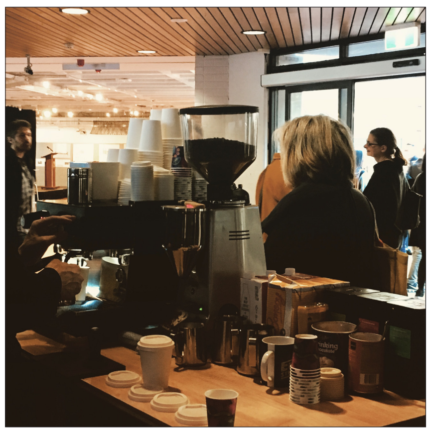
Figure 1: A mobile coffee cart operating in the conference foyer was a very welcome addition to the programme.