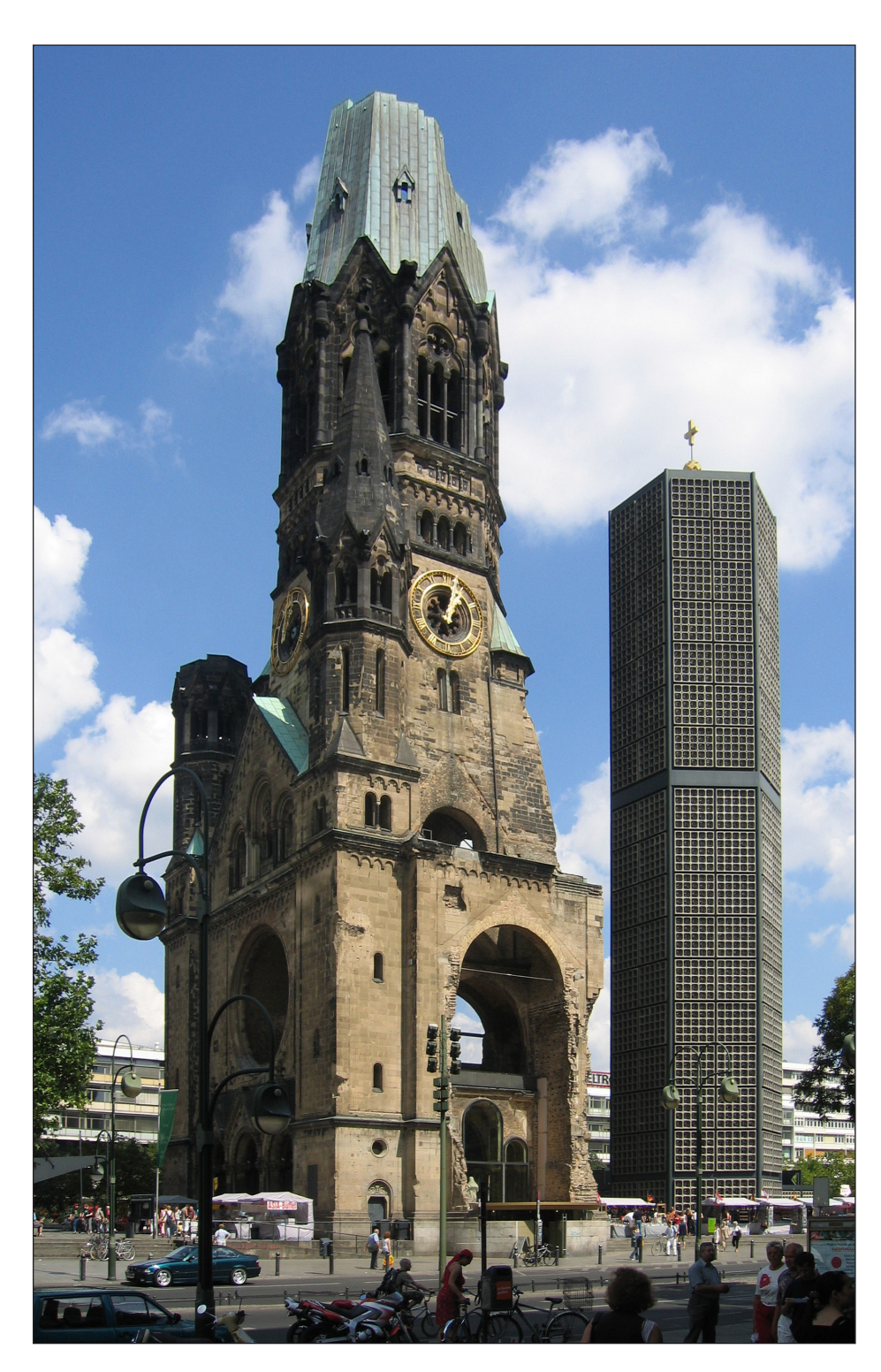
Figure 7: Kaiser Wilhelm Memorial Church, Franz Schwechten, and Egon Eiermann, Berlin, Germany, 1895, 1961. Photo by GerardM, 2004. https://commons.wikimedia.org/wiki/File:Gedächtniskirche1.jpg (https://creativecommons.org/licenses/by-sa/3.0/deed.en).