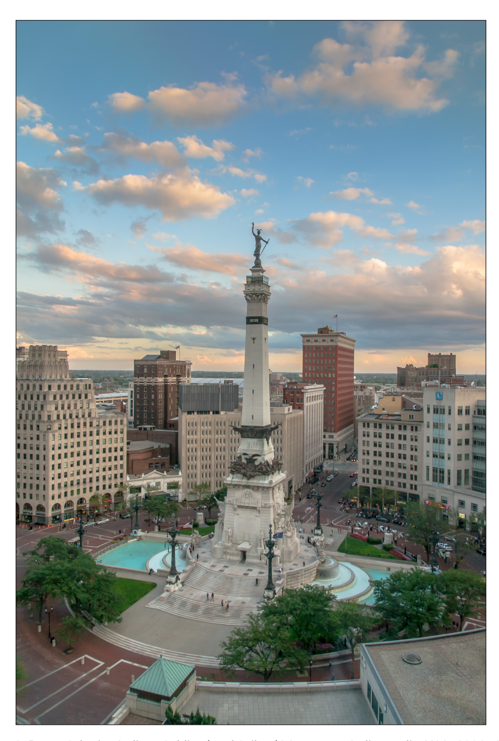
Figure 2: Bruno Schmitz, Indiana Soldiers' and Sailors' Monument, Indianapolis, USA, 1882–1902. Photo by alexeatswhales, 2014. https://en.wikipedia.org/wiki/Soldiers'_and_Sailors'_Monument_(Indianapolis)#/media/File:Monument_Circle,_Indianapolis,_Indiana,_USA.jpg (https://creativecommons.org/licenses/by/2.0/deed.en).