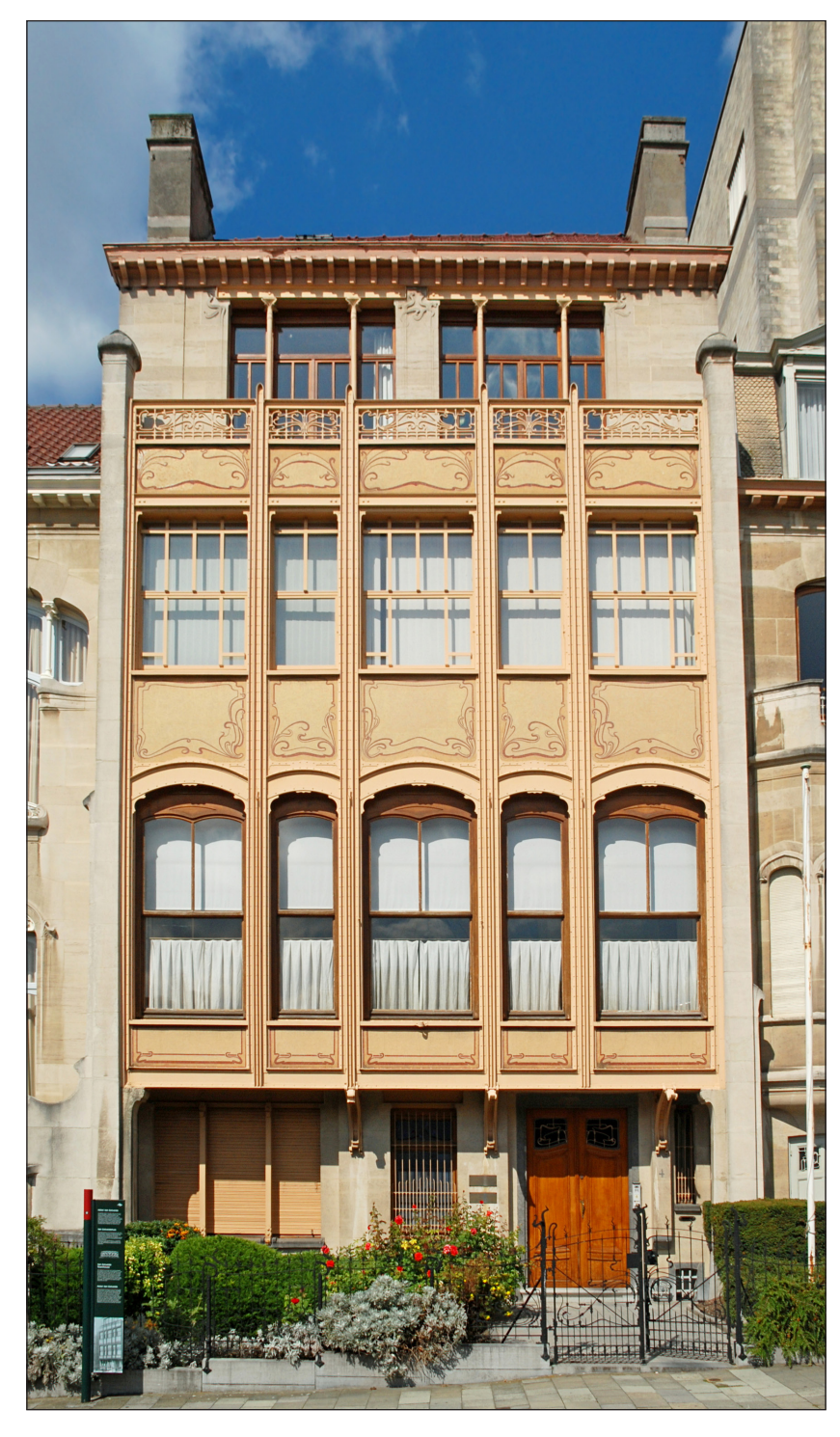
Figure 1: Hotel van Eetvelde, Victor Horta, Brussels, Belgium, 1895–1901. Photo by EmDee, 2009. https://commons.wikimedia.org/wiki/File:Belgique_-_Bruxelles_-_Hôtel_Van_Eetvelde_-_01.jpg (https://creativecommons.org/licenses/by-sa/4.0/deed.en).