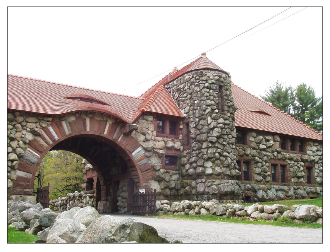
Figure 3: Ames Gate Lodge, Henry Hobson Richardson, North Easton, Massachusetts, USA, 1881. Photo by Daderot, 2007. https://en.wikipedia.org/wiki/Ames_Gate_Lodge#/media/File:Ames_Gate_Lodge_(North_Easton,_MA)_-_general_view.jpg (https://creativecommons.org/licenses/by-sa/3.0/deed.en).

In commissions such as the Ames Monument to the transcontinental railroad, completed in 1882, and the modest gate lodge he built for same family's estate in North Easton, Massachusetts, finished the previous year, Richardson used rusticated stone and even loose boulders to imply that the buildings themselves were natural formations ( Figure 3 ). This approach also elided the violence needed to wrest these lands away from their original inhabitants.