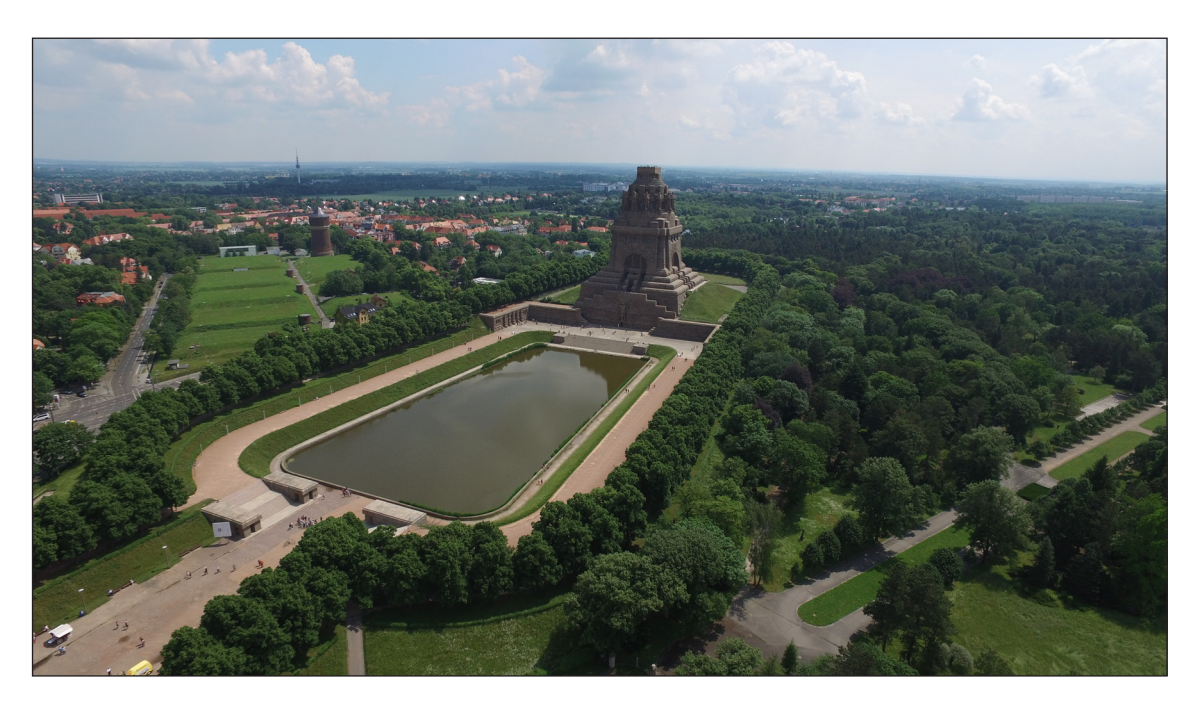
Figure 4: Bruno Schmitz, Battle of the Nations Monument, Leipzig, Germany, 1896–1913.

The Battle of the Nations Monument undoubtedly accounts for much of Schmitz's influence in the United States ( Figure 4 ). At a height of more than 90 meters, it remains the tallest of all European memorials. It was also the most resolutely modern in the use Schmitz made of reinforced concrete, although this was largely hidden from view by rusticated stone cladding. Lacking the hilltop sites on which the Kyffhäuser and Porta Westfalica monuments had been built, Schmitz here created an artificial mound into which he appeared to sink the monument. He ringed the entire complex, including the large forecourt, with a hillock capped with trees. The apparent integration with nature is thus intensified here, although the landscape is entirely manmade.