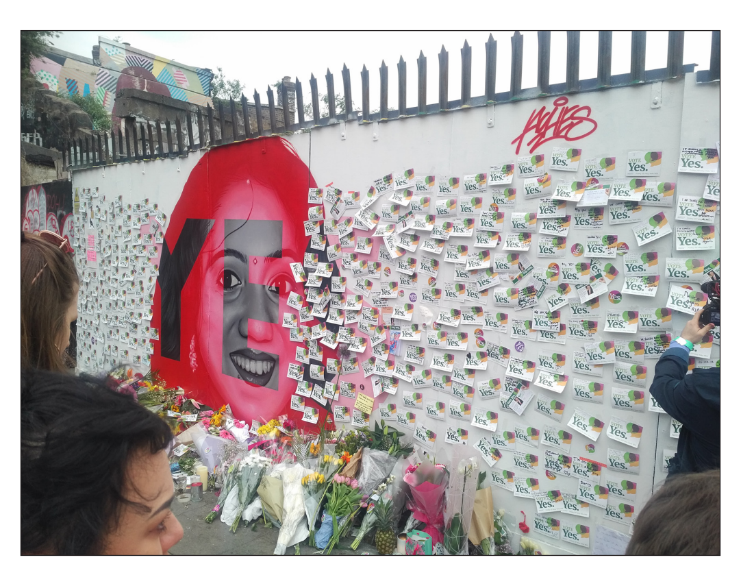
Figure 9: Mural of Savita Halappanavar, Dublin, Ireland, May 2018. Photo by Zcbeaton, 2018. https://commons.wikimedia.org/wiki/File:Savita_Halappanavar_mural,_Dublin.jpg (https://creativecommons.org/licenses/by-sa/4.0/deed.en).

Whether or not figural representation is the direction in which commemoration should head in the case of acknowledging slavery and lynching, it has certainly been effective in other European contexts. I first became cognizant of the power it can still have in another context, that of the fight to legalize abortion in Ireland. A single photograph of the married Indian-born dentist Savita Halappanavar up-ended the terms of the debate (James-Chakraborty 2016: 138–52) ( Figure 9 ). Halappanavar died of sepsis when miscarrying a wanted daughter, because the doctor treating her would not abort the non-viable foetus as long as it had a heartbeat. Putting a beautiful, demonstrably middle class and implicitly neither Catholic nor Protestant face on a discussion that had previously been focused on images of foetuses was transformative.