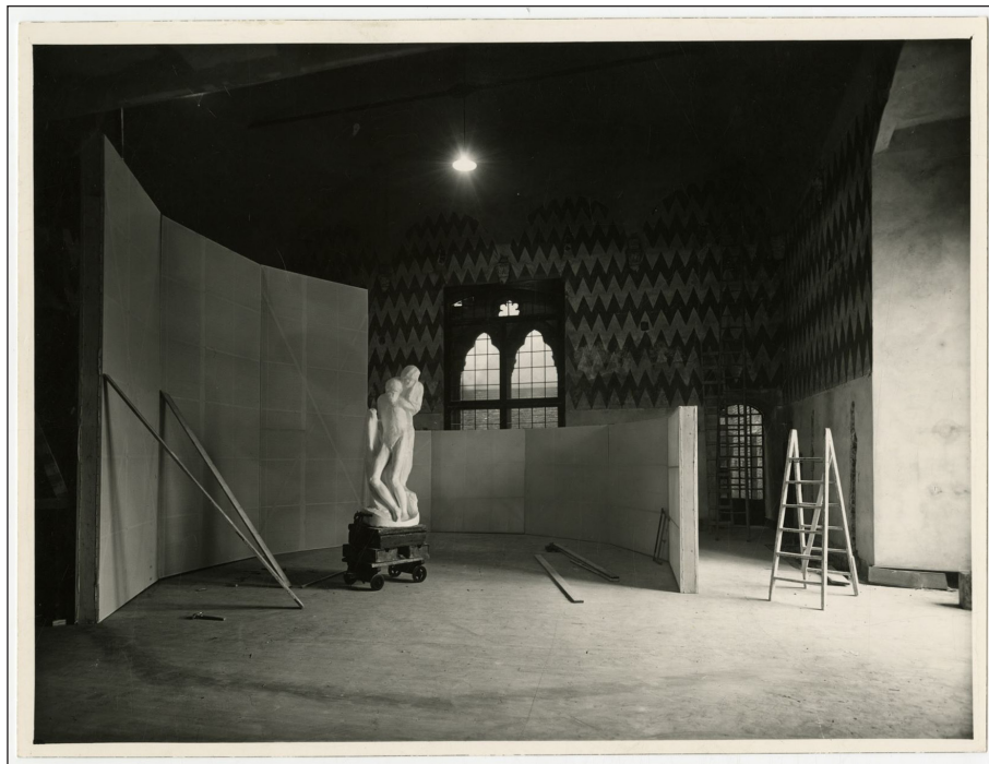
Figure 1: Castello Sforzesco, room 15, trials for the setting of Michelangelo's Pietà Rondanini – BBPR Restoration (first phase 1953–56).

A full-scale copy of Michelangelo's Pietà Rondanini (1552–53/1555–64) dominates one of the galleries on the first floor of the Museo nazionale delle arti del XXI secolo (MAXXI) in Rome. The reproduction of the famous unfinished sculpture is surrounded by a curved wall, which evokes the volume of the pietra serena niche designed by BBPR for the Sala degli Scarlioni in the Museo d'arte antica at the Castello Sforzesco in Milan ( Figure 1 ). This dramatic setting introduces the exhibition Architetture a regola d'arte: Dagli archivi BBPR, Dardi, Monaco Luccichenti, Moretti , that opened on 7 December 2022 and closes on 15 October 2023. Curated by Luca Galofaro, Pippo Ciorra, Laura Felci, and Elena Tinacci, the exhibition is organised around four leading firms in Italian architecture of the second half of the 20th century: BBPR, Costantino Dardi, Vincenzo Monaco and Amedeo Luccichenti, and Luigi Moretti.