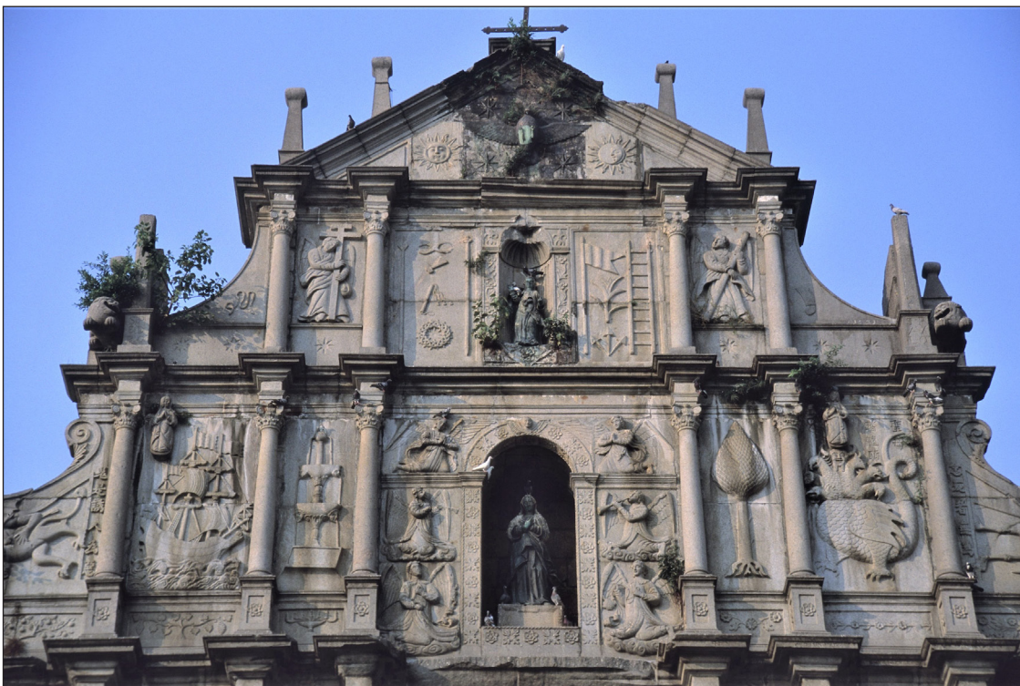
Figure 1: Our Lady of Assumption (popularly known as São Paulo), Macau, China, 1601. This facade dates between the 1620s and 1644. Photo: Gauvin Alexander Bailey, 2003.

The granite façade of the Church of Nossa Senhora da Assunção (more popularly known as São Paulo, begun 1601), is one of the most theatrical examples of an Asian Hybrid Baroque ... . Designed by the Italian Jesuits Carlo Spinola and Giovanni Niccolò and built by 150 to 200 Chinese workmen, it follows Italian late Renaissance treatises on a basic level ... , with free-standing columns, statues in niches ... and a pediment. But the sculptural decoration of the façade, carved decades later (c. 1620s–44) by Chinese and possibly Japanese sculptors, tells a different story. Chinese temple lions support the obelisks at the very top of the façade, peering down as if from a Buddhist temple. The drapery even of figures of Christ and the Virgin Mary have the beveled line and windswept appearance of Buddhist sculpture, and motifs such as Chinese cloud scrolls and carps are borrowed from traditional Chinese art. The angels look more like Apsaras spirits (shared with Buddhism) than anything that might inhabit a Christian paradise. (Bailey, 821)