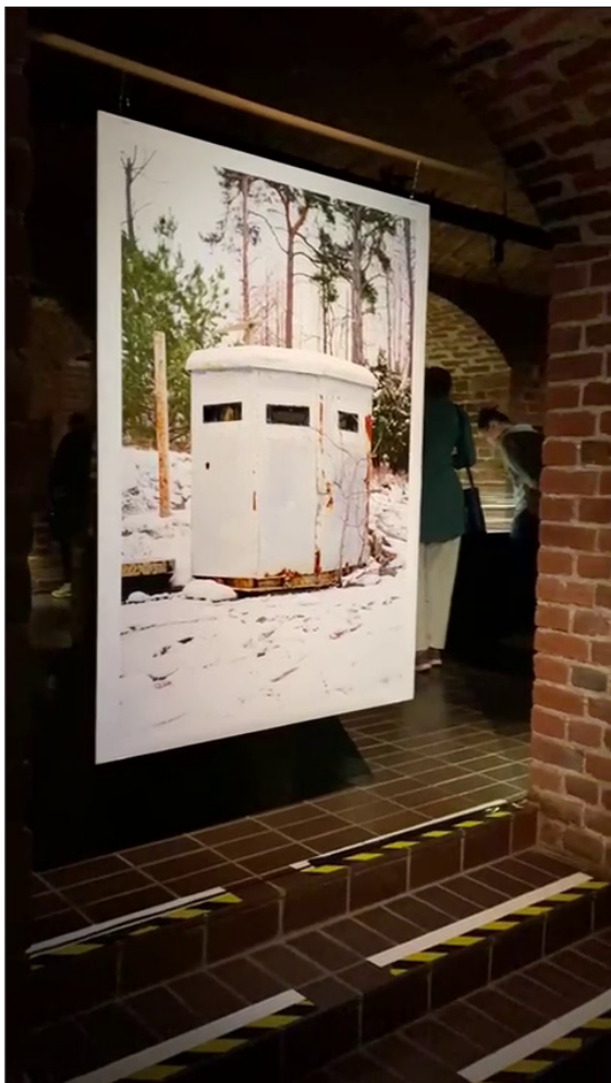
Figure 3: Instruments of Occupation exhibit walkthrough on opening night, 7 June 2023. Video by Dan Dubowitz, 2023.

The heavy materiality of the architecture that enclosed the exhibit, composed of thick structural brick piers that the visitor had to move around and between, was a reminder of the persistence of empire's remainders that often long outlive the political authority that constructed them (Figure 3). At certain moments the piers in the archive's cellar aligned and offered enfilade views, but overall, the exhibit space was appropriately oppressive. The topographical surveys and designs for defensive structures and monumental buildings