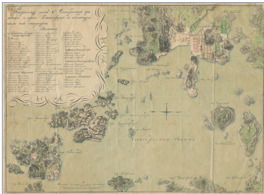
Figure 4: Map of Helsinki, the Sveaborg fortress, and the surrounding islands by the Russian Engineering Corps at the time of Russian takeover, ca. 1810s, VESA YA:0002a, National Archives of Finland. https://astia.narc.fi/uusiastia/viewer/?fileId=5946999666&aineistoid=2493708018 .