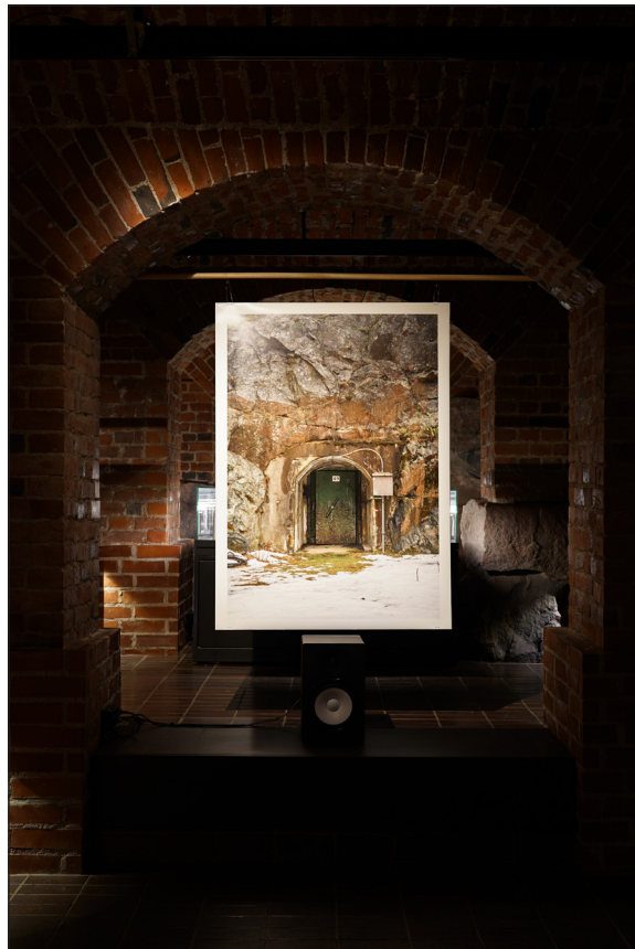
Figure 2: "Underworld" installation shot, Instruments of Occupation exhibit, the National Archives of Finland.

The territories addressed in the scholarly papers, which ranged from Berlin to Buryatia, were conceptualized as "in-between" states for the conference, that is, places whose built environments had been strewn with the detritus left by external actors who moved through, decamped, and/or remotely controlled them (Mrduljas 2012). The sites discussed in the papers and featured in the exhibit fall in the long shadow cast by particularly acquisitive and violent regimes that handed the baton from one to the