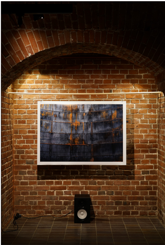
Figure 1: “Tank” installation shot, Instruments of Occupation exhibit, National Archives of Finland.

As our ears adjusted to silence, our eyes adjusted to low light. Straight ahead, beyond a tunnel of darkness, the first of eight large-scale “slow” photographs by Dan Dubowitz hung in shallow brick archways, while speakers sat on the floor beneath (Figures 1–2). A high-resolution image of a rusting oil tank—an abstract close-up in blue and orange—was accompanied by an audio installation crafted from site recordings by composer Tuomas Toivonen. Toivonen had turned the tank into a drum. He generated resonant thuds by banging its side; at the same time, his microphone captured the cracking of sporadic rifle fire from a garrison in the distance. Behind the