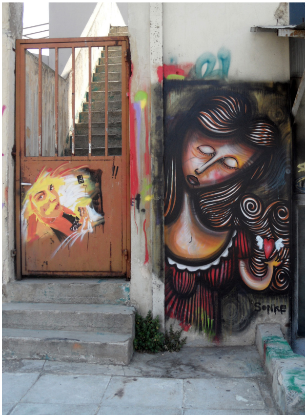
Figure 5: Sonke. “Untitled”, 2010. (2 Konstantinoupoleos Street, Gazi)

downtown, widening the multiple, deep wounds to the capital’s economic development, cultural heritage and urban fabric.