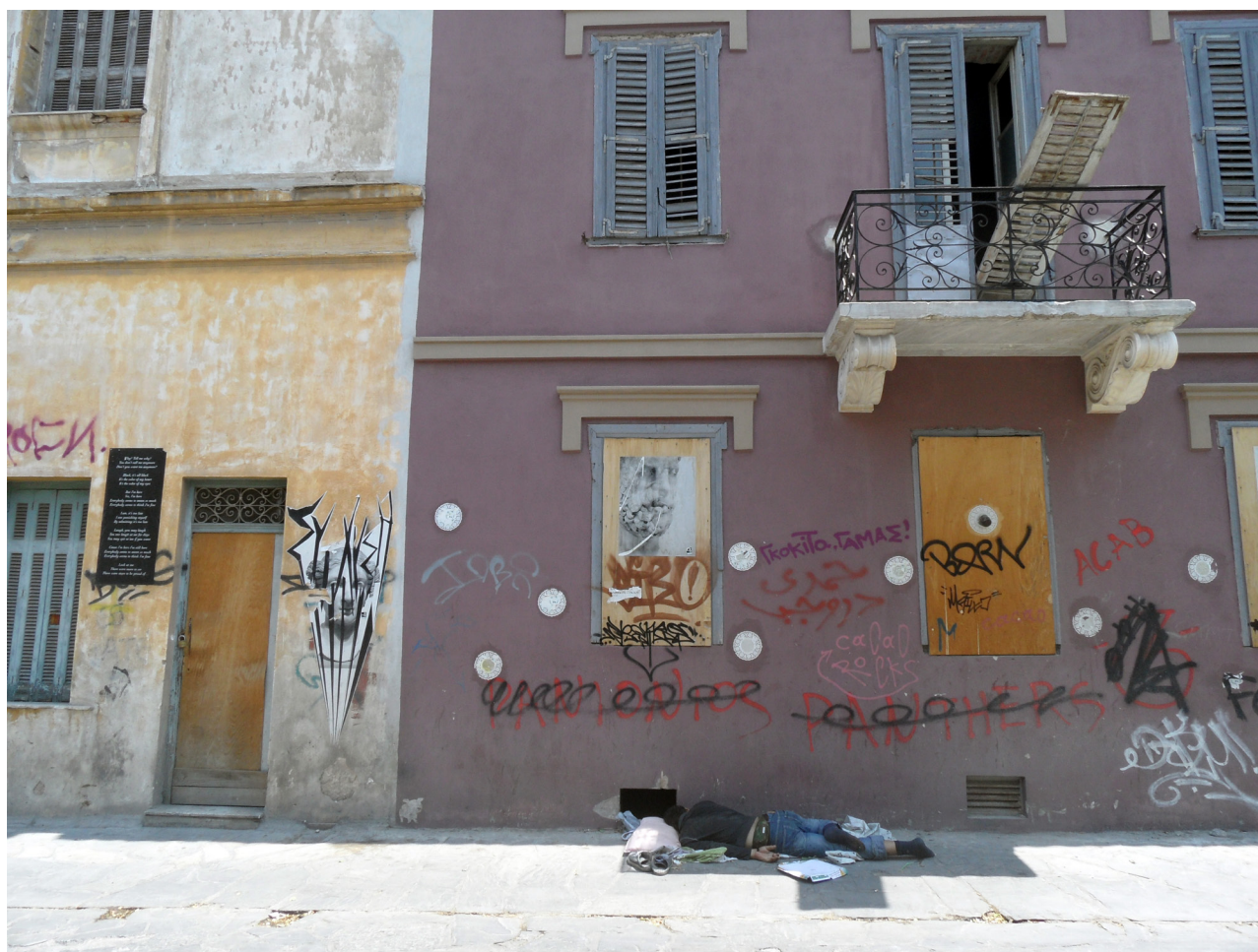
Figure 3: Renovated and Disused Neoclassical Buildings. (15–17 Iasonos Street, Metaxourgeio)

2007 heightened both the perceived nervousness about, and the on-the-ground reality of, the re-depressed north-western part of downtown.