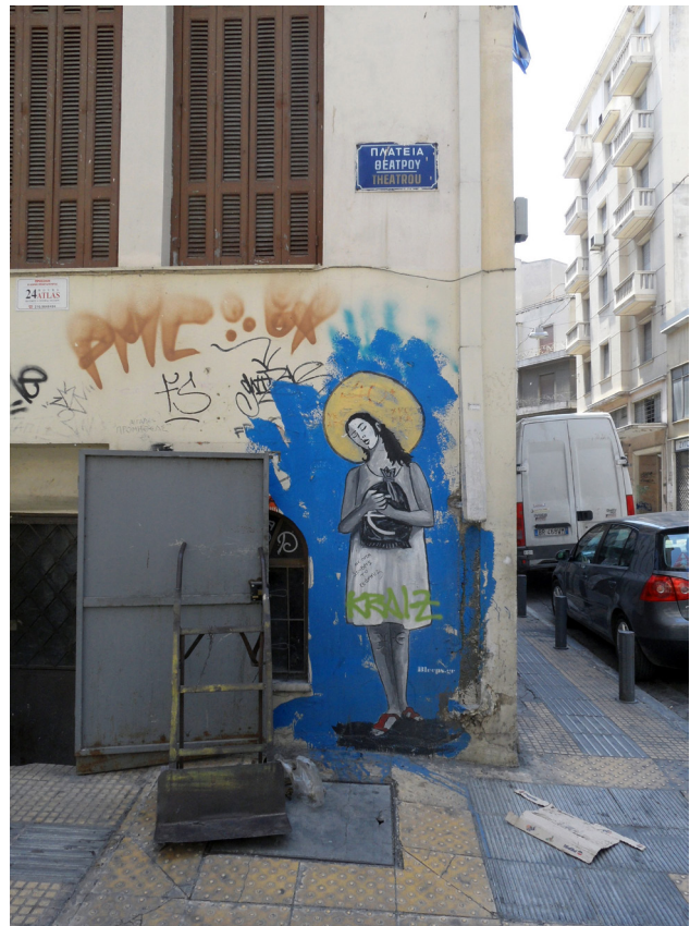
Figure 6: bleeps.gr. “Forty Years of Debtocracy”, 2011. (Plateia Theatrou, Psyri)