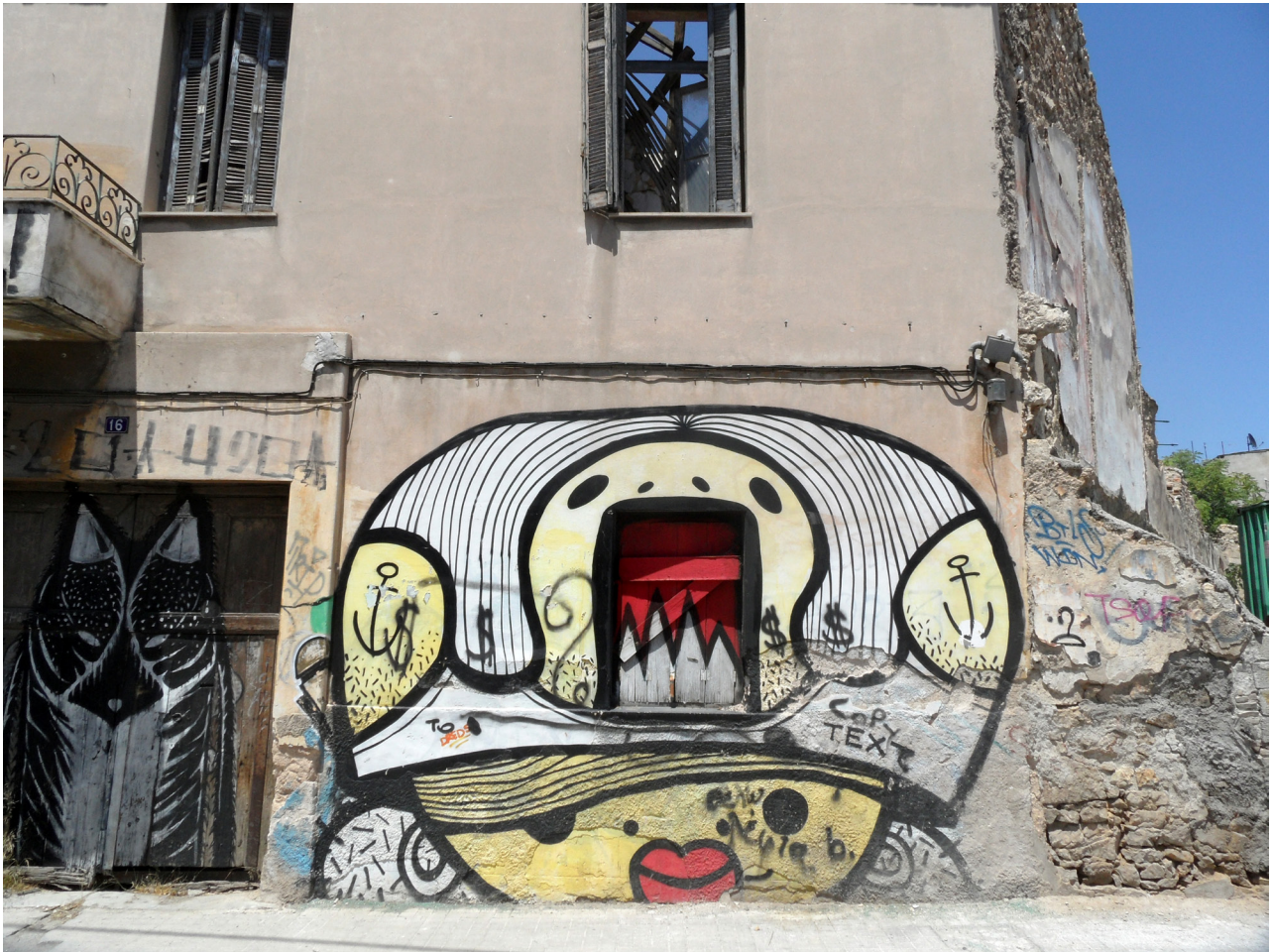
Figure 4: b. “Untitled”, 2009. (16 Voutadon Street, Gazi)