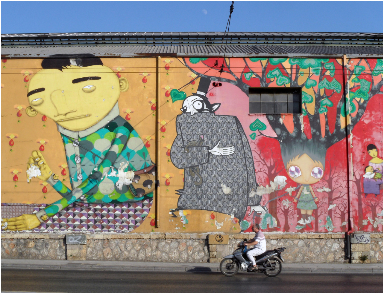
Figure 2: Various Artists. “For a Sustainable City” (ILPAP Trolley Depot, detail), 2005. (85 Peiraios Street, Kerameikos)