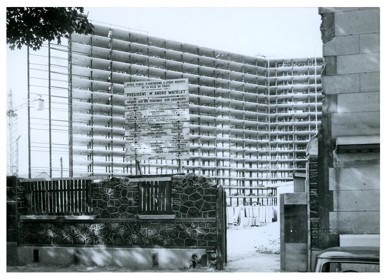
Fig. 4: The boulevard Lefebvre development of 899 apartments was being built on behalf of the Office Public d'Habitations à Loyers Modérés de la Ville de Paris. The panel lists the planning permission order and contractors involved in the project, including the architect-in-chief Georges Tourry. In the background stands one of the abandoned buildings adjacent to the site of the collapse. Photo: Coll. Pavillon de l'Arsenal, cliché DUVP 15999, 14 May 1964.

ignored this 'familiarly unknown' figure (Texier 2003: 67). It is possible that Tourry's near total disappearance from the architectural canon could be linked to his shaming at the boulevard Lefebvre trial in 1968. After this affair, Tourry received no discredit from the architectural establishment, but when he reached retirement age he seems to have vanished into obscurity.