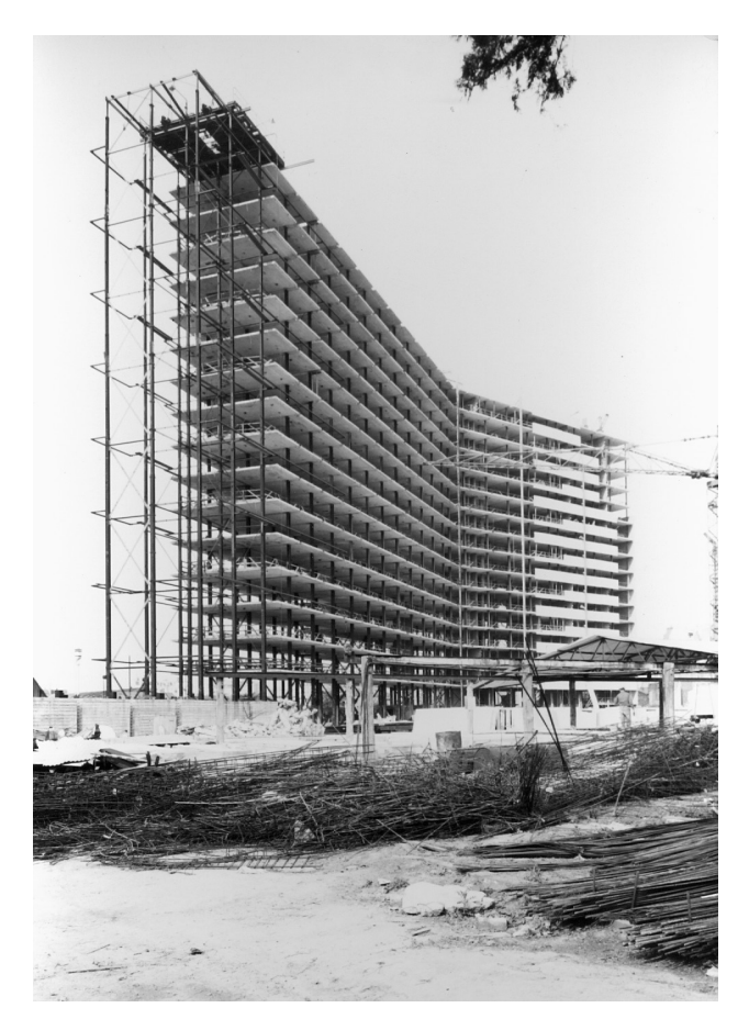
Fig. 3: Close to the collapsed tower stands the incomplete structure of another building on the boulevard Lefebvre estate, which was also being constructed using the 'self-lift' technique. Photo: Coll. Pavillon de l'Arsenal, cliché DUVP 16000, 14 May 1964.

As if things could get any worse, ice delayed construction in November 1963, halting the production of the concrete floor elements, which were poured on site on the ground floor of the future building. Morand wanted to postpone the lifting of the metal structure, but Léopoldès, who was responsible for the concrete production, ordered that work on the metal frame continue. As a result, assembly of the metal structure proceeded faster than the production of concrete flooring, which was required to strengthen the frame. Consequently, the metal fitters found they were lacking supplies of the temporary metal bracing that needed to be attached to the framework before the installation of the concrete elements. Bowing to the pressure to keep working, Morand removed metal bracing from the first section of the structure in order to use it further along the building. This was the fatal error, as the building was not rigid enough. As the final section of the metal frame was raised into place on 15 January 1964, the whole building wobbled before collapsing in a deadly heap.