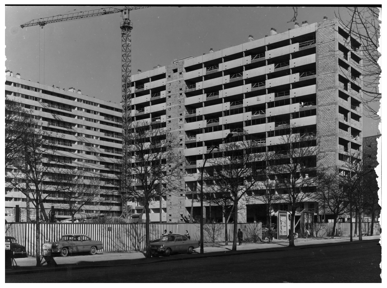
Fig. 5: Four years after the disaster, the boulevard Lefebvre estate was finally completed. The buildings still stand today with no evidence of the events of 1964. Photo: Coll. Pavillon de l'Arsenal, cliché DUVP 19515, 28 March 1968.