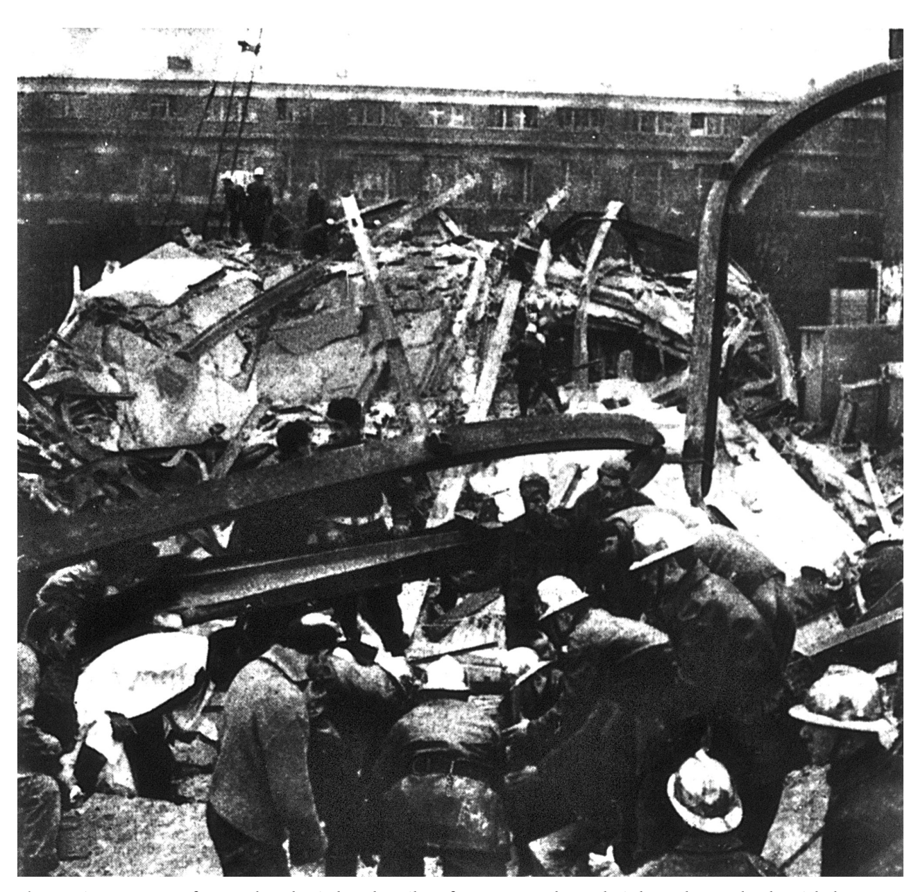
Fig. 1: Firemen try to free workers buried under piles of concrete and metal girders.