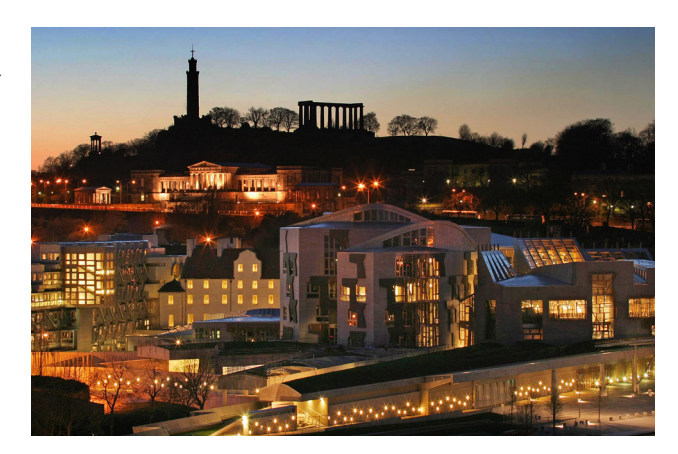
Fig. 10: The Scottish Parliament illuminated at night, Adam Elder, 2005. Image © Scottish Parliamentary Corporate Body—2012. Licensed under the Open Scottish Parliament Licence v1.0.

This understanding of the use of architectural symbolism to communicate the identity and ambitions of an entire nation can be extended further when the Scottish Parliament building is viewed in the context of contemporary Scottish cultural, economic and political landscapes. Debates over the Parliament's location,