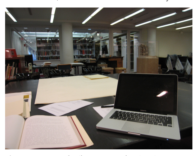
Fig. 1: Frances Loeb Library, Harvard University, September 2012.

This new world of open access is, of course, not total. At the Fondation Le Corbusier in Paris, for example, the entire contents of Le Corbusier's archive are scanned and searchable on site, yet that vast bank of resources is only selectively available online. But what would total online access to an archive like that of Le Corbusier mean for our work? In this case open access might do no more than mildly support an already ravenous program of research on the architect, which shows no sign of slowing. It is also unclear whether open access to Le Corbusier's archive would produce or encourage 'other voices' to write on the architect's work, or if it would broaden debate beyond its