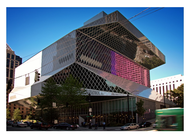
Fig. 4: Seattle Central Library, Rem Koolhaas and Joshua Prince-Ramus of OMA/LMN, architects, 2004.

The history of architecture should seek to research and understand the rules on which architecture is based today. Architects such as Palladio and Mies van der Rohe—while expressing differences between one another in their work—operated on the basis of clear and shared rules. Today we live in a time in which, apparently, architecture operates outside of such rules. This is the exact opposite of Mies van der Rohe's view: 'You can not invent a new