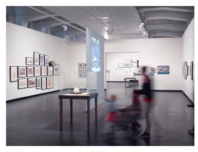
Fig. 7: The exhibition Athfield Architects: People and Place , curated by Julia Gatley and held at the City Gallery Wellington, New Zealand, 22 June to 7 October 2012.

But to what extent do the bodies that assess us recognise these outputs and their values? The body that assesses me and other New Zealand-based architecture academics every six years—the Engineering, Technology and Architecture Panel within the Performance-Based Research Fund (PBRF)—is a panel that regards refereed