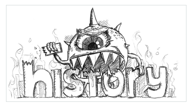
Fig. 2: Student drawing (owner unknown), found in the venue of INTA251 History of Interior Architecture, Victoria University of Wellington, 5 March 2013.

After lectures I often find leftover handouts and other bits of paper, which, like most teachers, I collect up for the recycling bin to ensure the room is tidy for the next class. This year, after my first history session, among the detritus was a gem: a careful biro drawing of the word 'history'