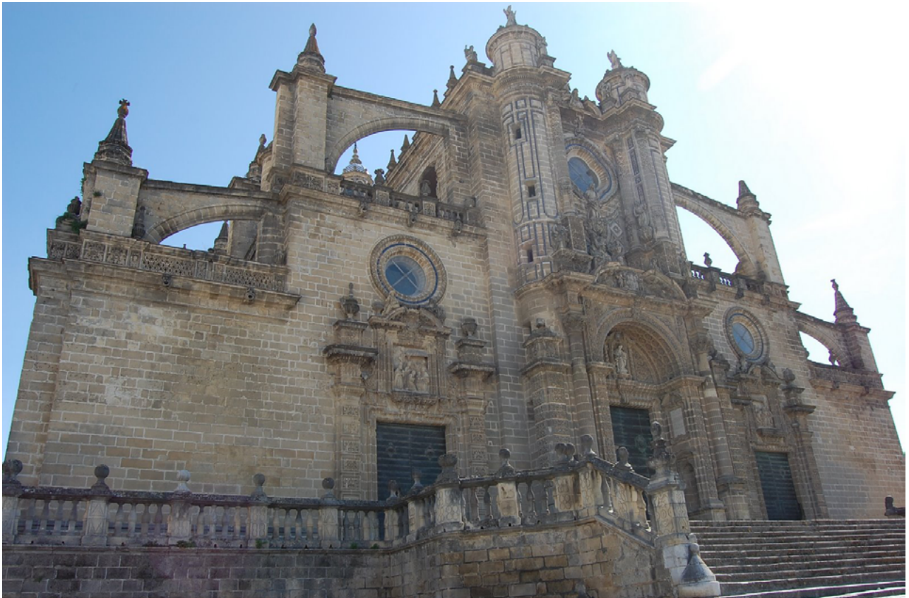
Figure 15: Exterior of the Cathedral of Jerez de la Frontera.