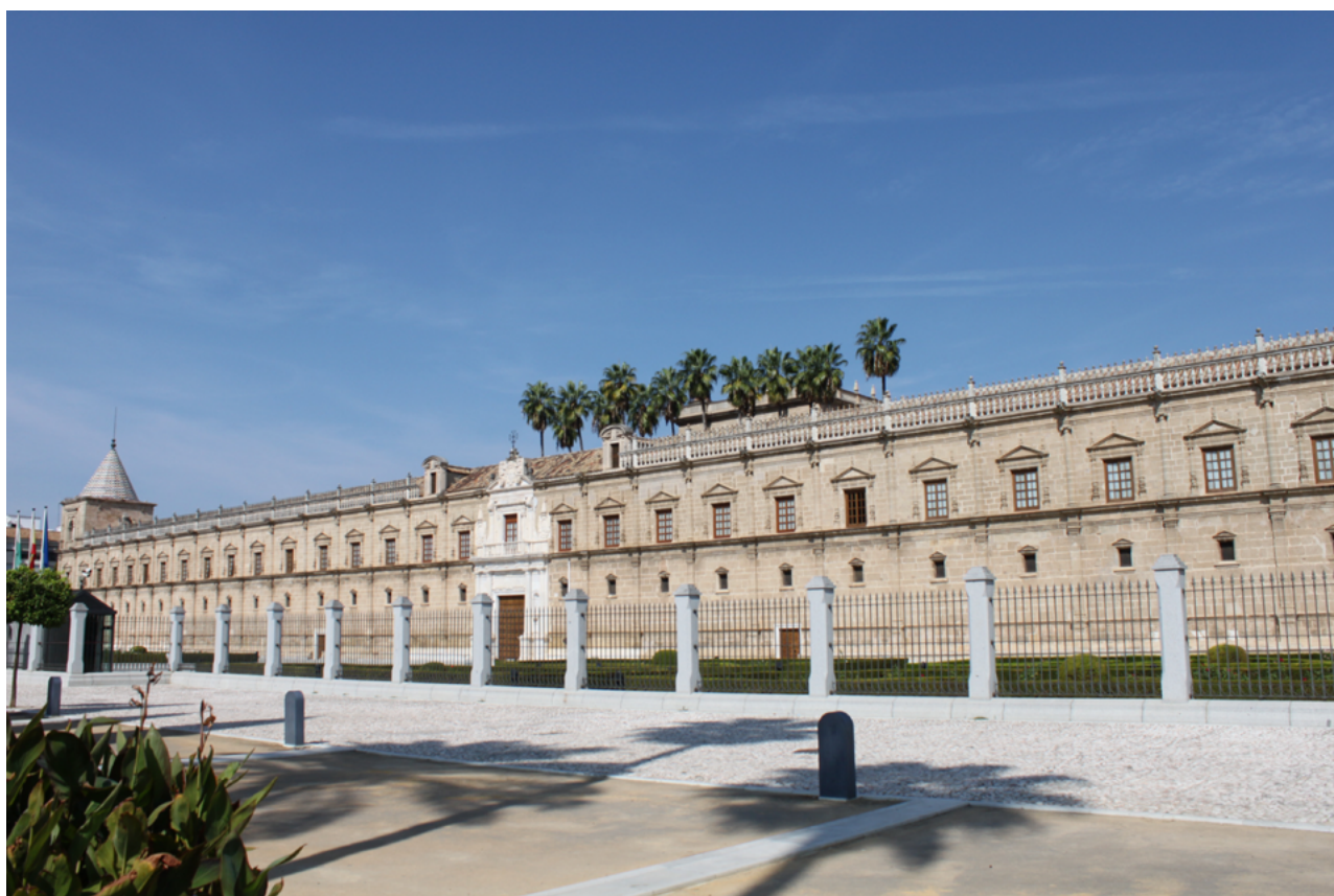
Figure 6: The principal façade of the former Hospital de las Cinco Llagas.