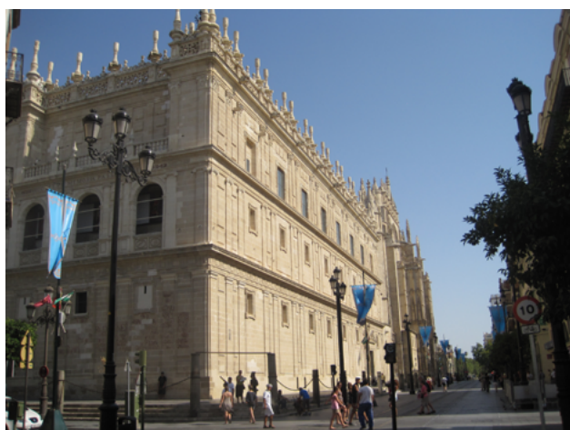
Figure 1: Exterior view of the church of the Sagrario, Seville Cathedral.

as a foregone assumption, this paper asks how our reading of this period in crisis shifts if the conventional association of a lack of grand architectural markers is disengaged from the rhetoric of failure. By re-reading this moment of 'crisis', aspects typically ignored or disparaged by conventional historiography begin to emerge as innovative and significant developments, in particular those that relate to the money management of projects and the new modes of architectural production and practice that arose with the intromission of artists and artisans into the design market.