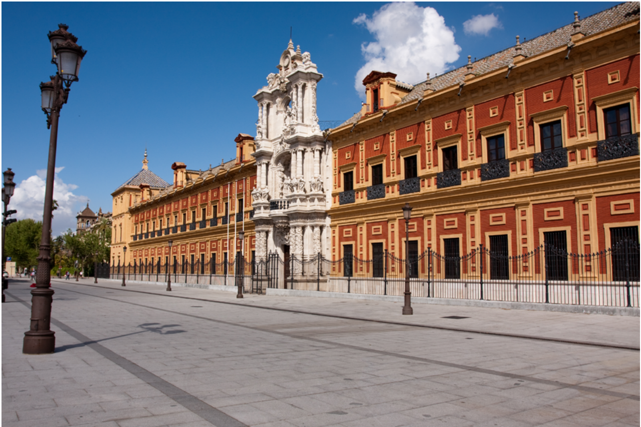
Figure 13: The exterior of the former naval college of San Telmo.

he perceived as the absolute ‘ineptitude’ of the painters and sculptors in ‘architectural matters’ (Llaguno y Amirola 1829b: 67). To ascribe culpability to painters, sculptors and silversmiths is perhaps an act of misrepresentation. Whilst a number of the cross-disciplinary practitioners such as Cano had a background in architecture, because of familial associations, or acquired it independently, many of the new participants in architectural design would not have been involved in the sizing and scaling of structural elements or in the technical realisation of construction details, far beyond their knowledge base and well away from their fields of interest.