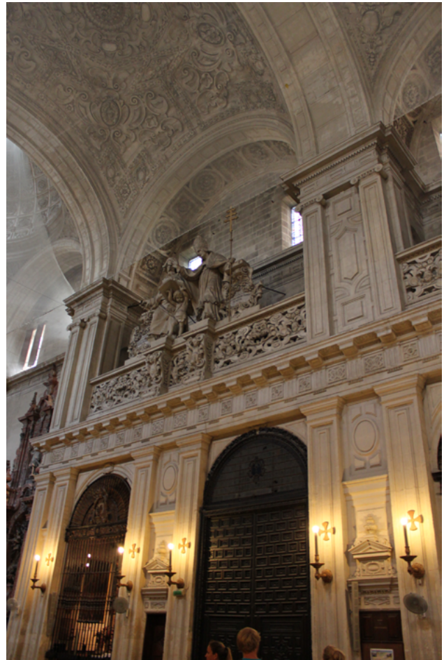
Figure 9: Interior of the Sagrario. The Epistle side of the nave.