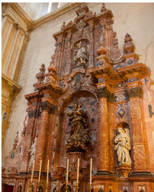
Figure 17: The red marble retablo of the Magdalene located in the Epistle transept.