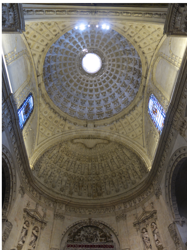
Figure 4: Interior of the Royal Chapel, Seville Cathedral.

in 1556, Ruiz II finished the Chapel's cupola, completed in 1568 in a time span of seventeen years ( Fig. 4 ).