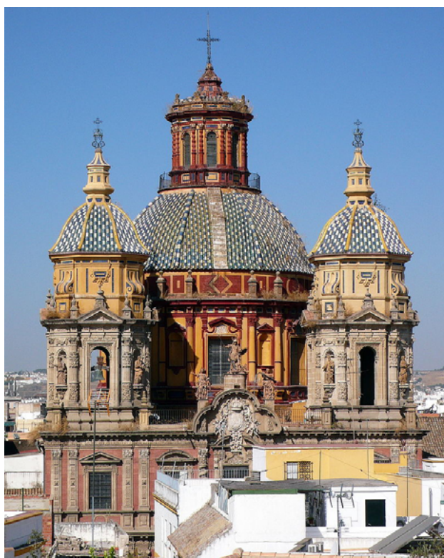
Figure 18: Exterior of the former Jesuit novitiate church of San Luis de los Franceses, Seville. Image from http://es.wikipedia.org/wiki/Iglesia_de_San_Luis_de_los_Franceses_(Sevilla)#mediaviewer/Archivo:San_Luis_de_los_Franceses.jpg.

documenting works, their authors, and their qualities, and, of particular interest to this study, passing judgment on their merit, at least as he perceived them. Ponz was one of the greatest critics of the Baroque and made it his personal mission to see its permanent eradication physically, through destruction, and psychologically, through education and example.