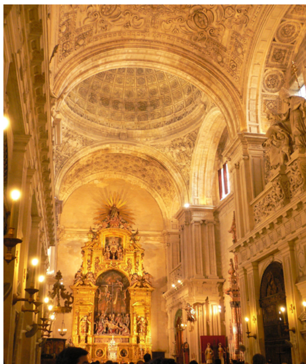
Figure 7: Interior of the Sagrario, looking from the entry towards the high altar.

Within the interior of the Sagrario the first manifestation of this shift was in the carving of the nave vaults in 1655 by the brothers Borja (Figs. 7–9). Pedro and Miguel Borja were commissioned to carve the stone vault immediately before the crossing and again the following year to realise further work on the remaining bays (Bravo Bernal 2008: 116), in effect 'camouflaging' the sober classical