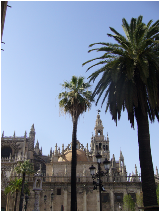
Figure 5: The Giralda in the background, with the cupola of the sacristy in the foreground, Seville Cathedral.