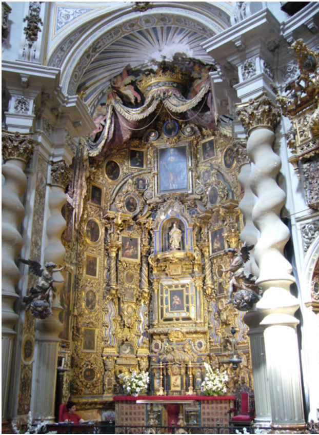
Figure 19: Interior of the former Jesuit novitiate church of San Luis de los Franceses, Seville. View of the High Altar.

esta línea, que desde entonces hasta ahora se han ido haciendo en esta Ciudad, y fuera de ella [...] Los caprichos, extravagancias, y puerilidades [...] se eche á delirar. [completely lacking order and harmony. It was realised at the beginning of the century, done to the unfortunate norm of the times, its author was showered with praise and likewise the other infinite monstrosities of a similar nature which until now have been built in this city [Seville] and its surrounds [...] The capriccios, extravagances and puerilities [...] are enough to drive one mad.] (Ponz 1786: 9–10)