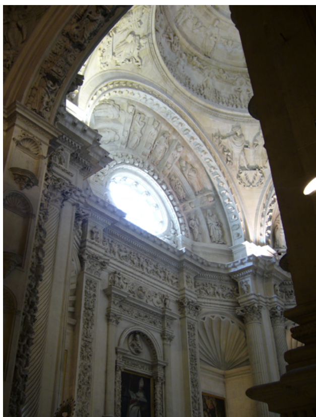
Figure 3: Interior of the sacristy, Seville Cathedral.