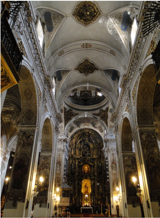
Figure 14: The interior of the church of the former convent of San Pablo el Real. View from the narthex towards the High Altar.

of Austria, physically as well as symbolically (Kamen 1980: 13). Spain's new Bourbon monarch and court wanted to disassociate themselves from the legacy and regime of crisis that they had replaced. Fresh from Versailles, Felipe V imposed a centralised model of government on what had been a collection of semi-autonomous regions and similarly began consolidating artistic control and production in Madrid and its satellites of royal residences.