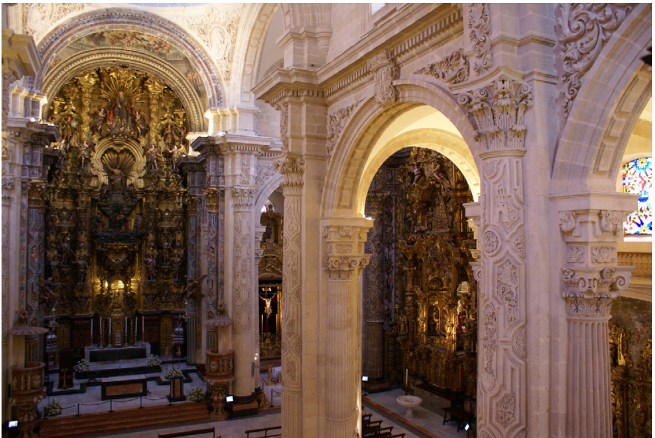
Figure 16: Interior of the ex-collegiate church of El Salvador, Seville.