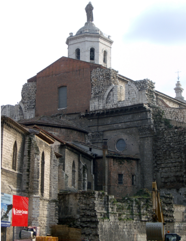
Figure 2: The incomplete Cathedral of Valladolid.

project had been completed by its 1668 consecration as a cathedral, after which point the Chapter seemed to have accepted the impossibility of funding the construction of the remaining half. Future funds were instead used for the façades and interior ( Fig. 2 ).