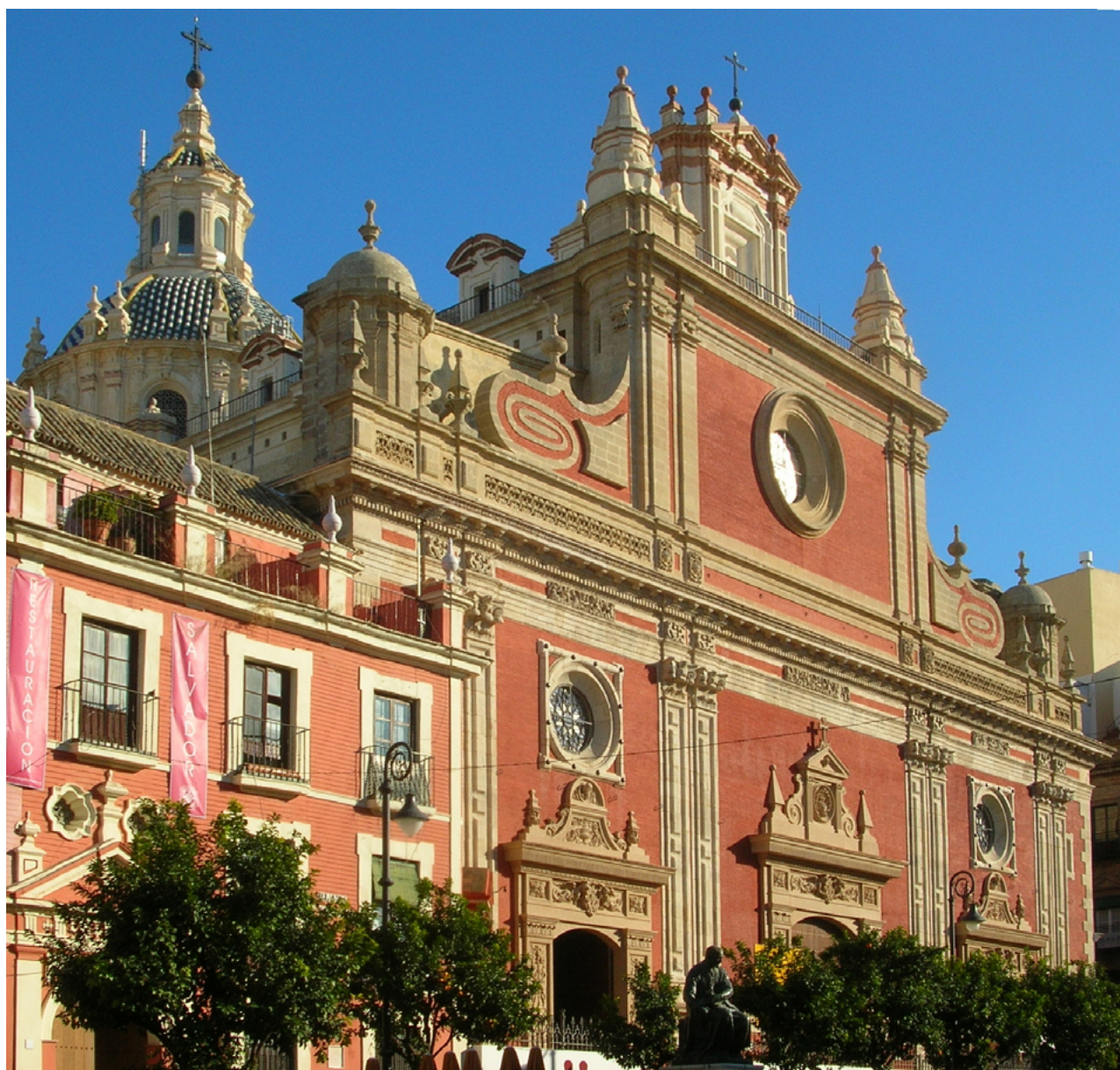
Figure 12: Façade of the ex-collegiate church of El Salvador, Seville.

of its companion in Seville city, though rendered entirely in stone ( Fig. 15 ).