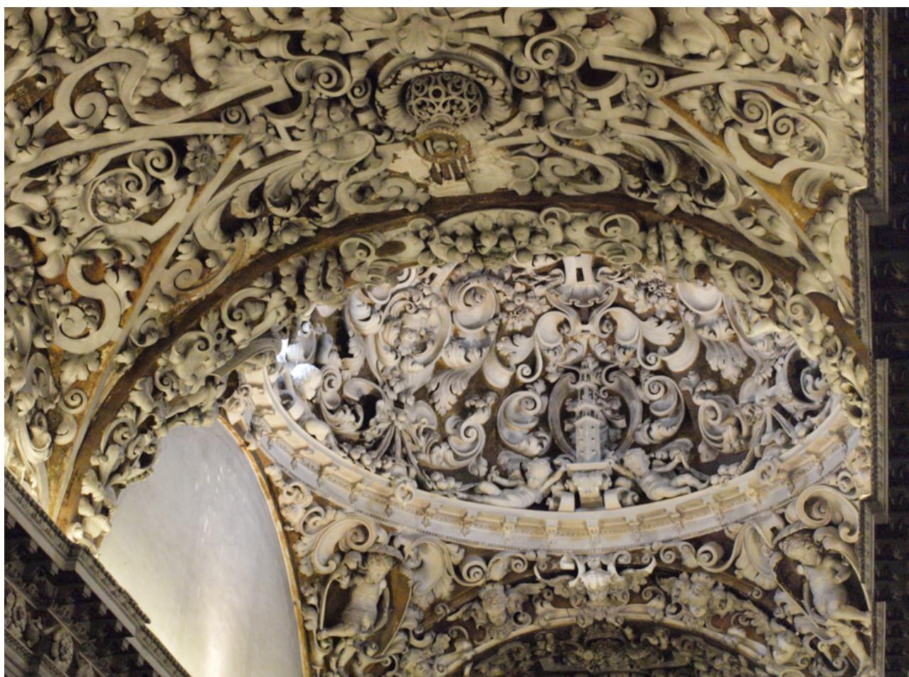
Figure 10: The yeserías on the vaults of the church of Santa María la Blanca, Seville.