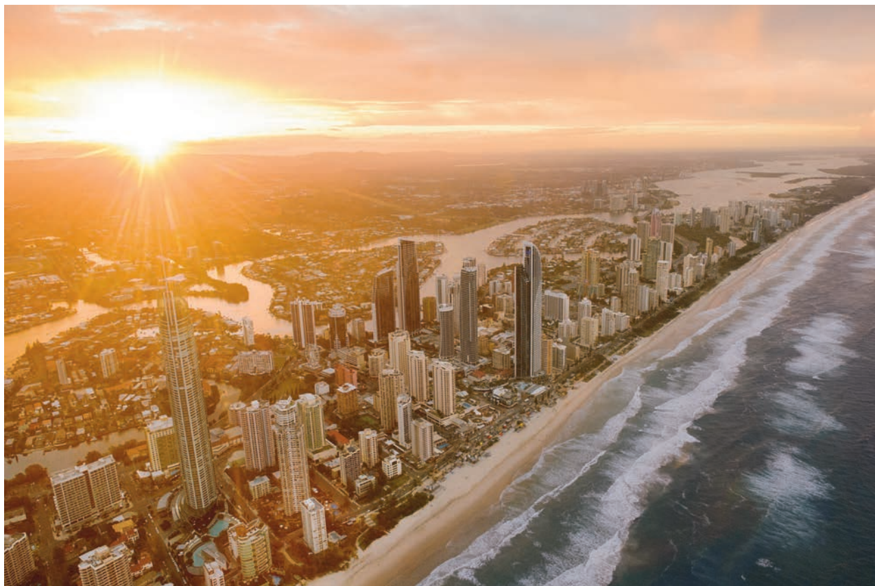
Figure 4: The Gold Coast, 2012. Photo by John Gollings. Reproduced with permission of the photographer.

the operative difference between chaos and the tidy room, consciousness and nonchalance.