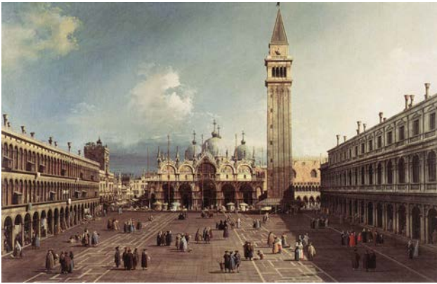
Figure 2: Piazza San Marco with the Basilica, by Canaletto, ca. 1730.

branches of a tree in which, according to legend, he has taken refuge to escape a marauding unicorn – although both Benedetto and Tafuri omit this detail. The boy is safe for the moment, but just beneath him a dragon lies in wait. At the very base of the tree two wolves (originally mice) gnaw on the trunk. The boy is distracted by his discovery of a trickle of honey and he begins to forget the dangers below. But eventually the wolves will make their way through the tree and then the boy is toast. The wolves are depicted respectively as white and black, symbols of day and night repeated in the iconography of two charioteers whose encircled figures flank the tree – one depicting the sun and the other the moon. The inexorable march of time, Tafuri tells us, paraphrasing Barlaam's lesson to Josaphat, pays no heed to the importance we see ourselves as having to the world, while we, like the boy, enjoy our honey oblivious to the peril to which, as surely as day follows night, we will inevitably succumb.