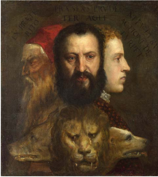
Figure 3: Allegory of Time Governed by Prudence, by Titian, ca. 1565.

circumstances; or to agitate, rendering everything banal, declaring the past a crime scene and documenting as best one can those traces and effects that remain to be found – to refuse the mask and to foster a healthy distrust of the comforting effects of narrative.