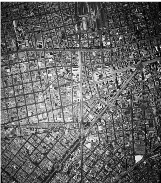
Figure 13: Vertical view of the circle in 1958 with a west side very different from the 1930s. Mxim 2-3-5-5, Compañía Mexicana de Aerofoto, Mexico City, 1958. With permission from Fundación ICA, flight 593D-1.

on, the attracting center began to disperse into many small centers, with unbridled growth that proliferated unchecked throughout the second half of the twentieth century, as the city became a metropolis of many cities fused together.