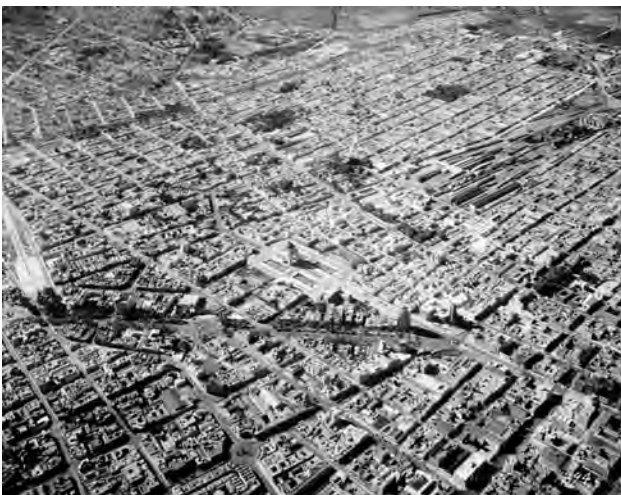
Figure 10: Oblique view of the Circle to north, when urban transformation, in the early 1940s, becomes evident, with the first high buildings. Mxim-2-3-4-1, Mexico City, ca. 1940. flight 1794.

disappeared as soon as the National Lottery began construction on the site of the El Moro building by comparing Figure 2 (1932) with Figure 14 . In the former, the gardens and buildings of the Tívoli del Eliseo take up a good part of the photograph while in the latter the foundations of the El Moro Building can be seen and the Tívoli has disappeared altogether. In its place, several new blocks have emerged and there is barely a vestige left of the park as a simple courtyard garden within the ancient Buenavista Palace (1805). 31