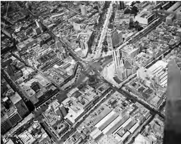
Figure 3: The verticality starts at El Caballito Circle, in the last years of the 1940s. Mxim-2-3-4-5, Compañía Mexicana de Aerofoto, Mexico City, July 6, 1949. With permission from Fundación ICA, flight 6097.