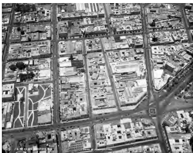
Figure 1: Oblique view to the south of El Caballito Circle in the early 1930s. Mxim-2–3–3–1 (mx = Mexico; im = Instituto Mora; 2 = El Caballito Collection; 3 = Aerial Documentation Group), Compañía Mexicana de Aerofoto, Mexico City, 1932. With permission from Compañía Mexicana de Aerofoto, 449.

It is important to take a closer look at what we can learn from aerial photographs, as Chombart did over half a century ago (Krauss 2002: 26). To begin, he notes the limitations of aerial photographs taken at angles, from the ground, of 30° or 60° as compared to the optimum