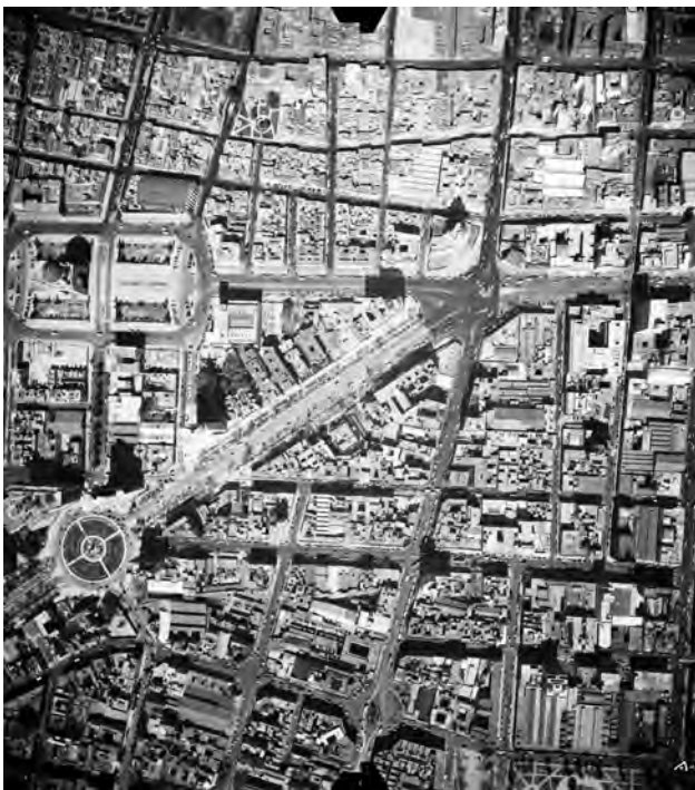
Figure 6: A vertical and low view of El Caballito Circle, near the end of the 1940s. Mxim-2-3-4-9, Compañía Mexicana de Aerofoto, Mexico City, December 3, 1949. With permission from ICA Foundation, flight 418-AC2.

uses of aerial photography. Depending on the number of flights, a mosaic could involve dozens or even thousands of photographs for a single area. The greater the scale, the more negatives, since they are taken closer to the ground.