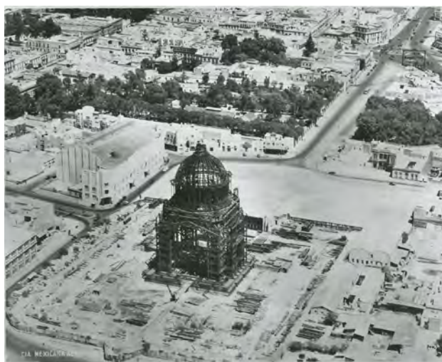
Figure 2: The west side of El Caballito Circle at the beginning of 1930s. Mxim-2–3–3–3, Compañía Mexicana de Aerofoto, Mexico City, 1932. With permission from Compañía Mexicana de Aerofoto, 403.

angle of 45°. This is clearly seen if we compare, for example, Figure 1 with Figure 2 . The vertical planes can be seen much better in the latter, since an oblique view, unlike a vertical view, permits a vertical surface to be seen. He also notes that a series of consecutive shots, made while circling a site, each differing slightly from the last (which may require more than one overflight), 3 can be extremely useful.