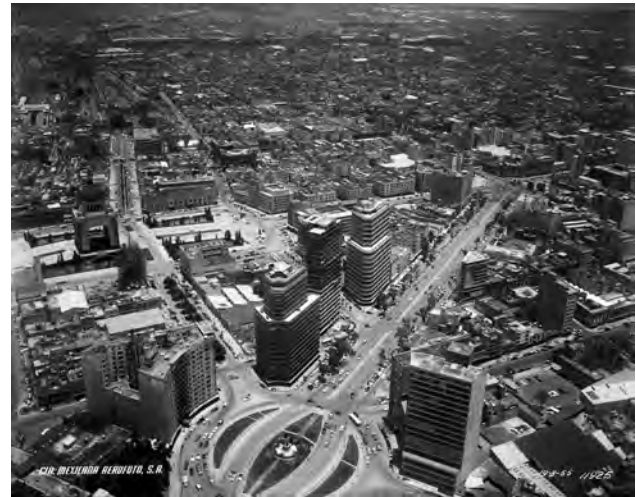
Figure 4: Southwest side of El Caballito Circle, while Reforma Avenue is growing up in the 1950s. Mxim-2-3-5-1, Compañía Mexicana de Aerofoto, Mexico City, August 19, 1955. With permission from ICA Foundation, flight 11925.

led to a race for maximum efficiency and precision, which meant experimenting with increasingly better equipment. Competition was fierce to see who could be the most skillful at producing the best quality photographs. Pilots had to fight drift and fly straight lines as accurately as possible.