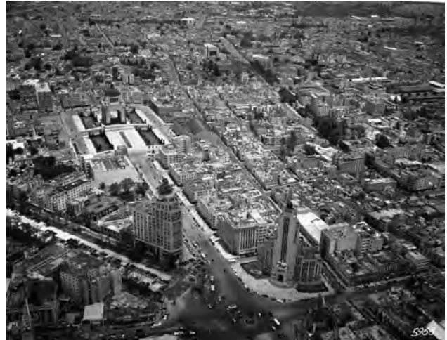
Figure 11: Oblique view of El Caballito Circle in 1949, already showing El Moro and the Corcuera buildings. Mxim-2-3-4-4, Compañía Mexicana de Aerofoto, Mexico City, June 11, 1949. With permission from Fundación ICA, flight 5968.