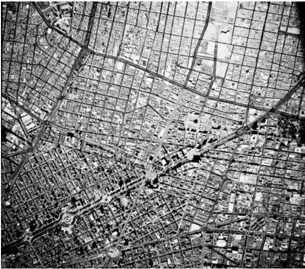
Figure 12: This vertical view from 1972 shows all the circles along Reforma Avenue, from El Caballito to the west. Mxim-2-3-7-1, Compañía Mexicana de Aerofoto, Mexico City, March 18, 1972. With permission from Fundación ICA, flight 2346/21.