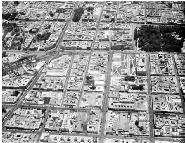
Figure 7: Oblique view to north of El Caballito Circle. Mxim-2-3-3-2, Compañía Mexicana de Aerofoto, Mexico City, 1932. With permission from Compañía Mexicana de Aerofoto, 450b.

In fact, one of the most visible contributions of aerial photography is due to the shadows seen in the photographs. In a longitudinal series of photographs shot in