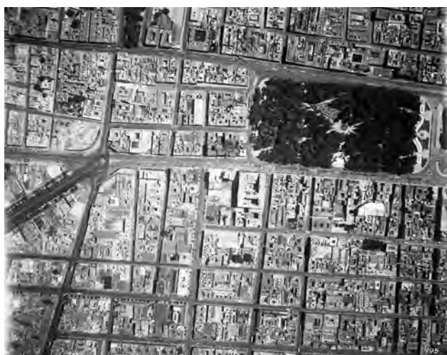
Figure 18: El Caballito Circle from a very low angle in 1936 that shows the beginning of urban transformations just in its northwest corner. Mxim-2-3-3-6, Compañía Mexicana de Aerofoto, Mexico City, 1936. With permission from Fundación ICA, flight 92/195.

given priority over pedestrian traffic, as was construction investment and vertical growth, in spite of the ever present danger of earthquakes, always for the sake of increasing land value which shot literally skyward.