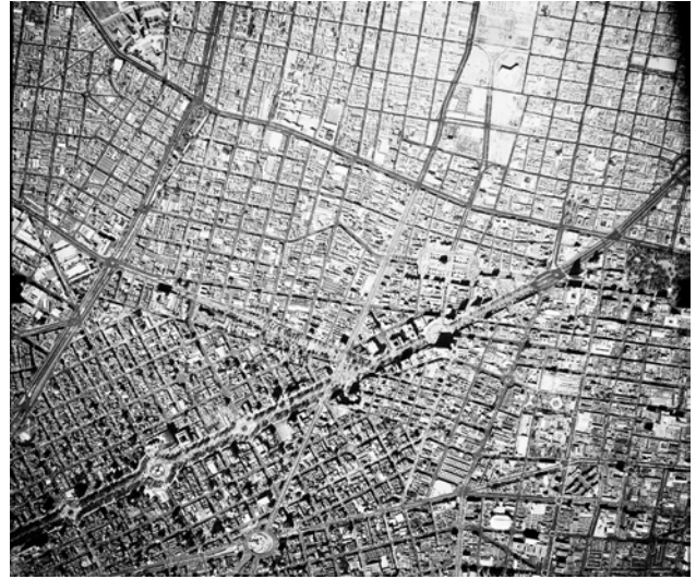
Figure 16: Vertical view of the Circle and east side with part of the new Reforma Avenue to north. Mxim-2-3-6-4, Mexico City, 1963.

construction towards the sky. In addition, many private interests erected tall buildings, and eventually the circle became the site of some of the tallest buildings – the most recently constructed, the Torre de Caballito (1988) stretches up thirty-four stories – and one of the most pedestrian-unfriendly intersections in the city; 36 that is, one of the many places that, for the last half century, have been driving pedestrian traffic away.