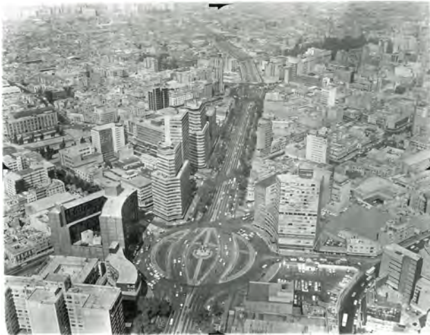
Figure 9: Oblique view, since Reforma Avenue just opened, in the early 1960s, to the northeast through El Caballito Circle, each day more elliptical. Mxim-2-3-6-1, Compañía Mexicana de Aerofoto, Mexico City, ca. 1964. With permission from Compañía Mexicana de Aerofoto, wo/r.