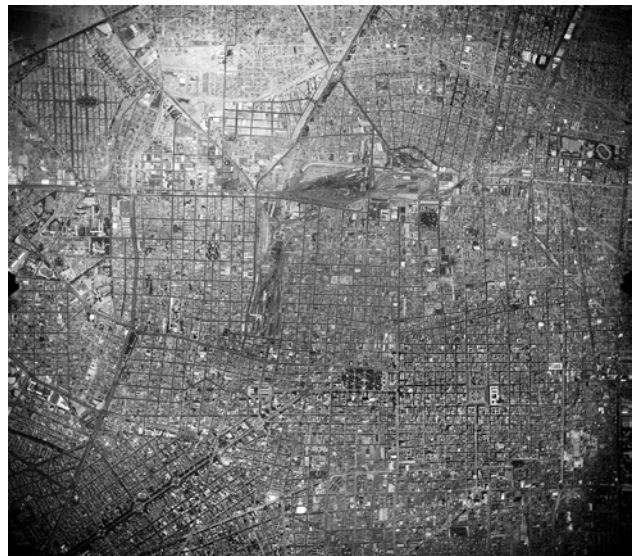
Figure 8: A very high vertical view to show how, by the 1950s, the geographic center has moved west. Mxim-2-3-5-6, Compañía Mexicana de Aerofoto, Mexico City, 1958. With permission from Fundación ICA, flight 553/2.

winter, when the shadows are longest – in which the contrast between the dark shadows and the other textures is so great as to make the pictures resemble openwork as in Figures 6 and 12 – we can clearly observe the vertical extension of the urban landscape and how the heights of the buildings increased in this part of the city, for example from the 1930s to the 1950s, eventually reaching more than 100 meters. This is illustrated by the difference between Figure 13 (1957) and Figure 14 (1936). That is, it is relevant to analyze the different textures in the photograph to note whether these black areas are simply the long shadows cast by high buildings, or green spaces – which also decrease over time. This is clearly seen if we compare Figure 15 (1934) with Figure 8 (1958). We can see, as a specific example, how the Tívoli del Eliseo park