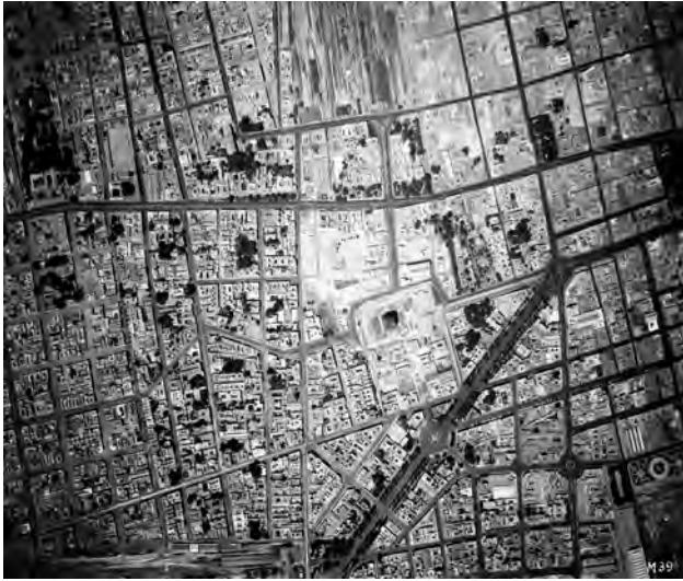
Figure 15: Vertical view of the circle and west side, with the last green spaces that will disappear. Mxim-2-3-3-5, Compañía Mexicana de Aerofoto, Mexico City, 1934. With permission from Fundación ICA, flight 89-90/39.