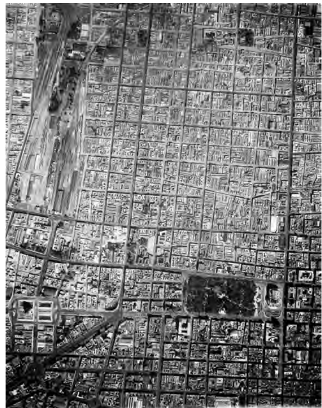
Figure 14: Vertical view of the circle, north side, in the 1930s. Mxim-2-3-3-4, Compañía Mexicana de Aerofoto, Mexico City, 1936. With permission from Fundación ICA, flight 91/86.

Thus, as shown by the photographs taken from the air, this space began as a place where streets and people met and came together, 35 but that characteristic faded away through the course of the twentieth century. It was such an important landmark that it set the standard for the bustling city; its rapid transformation was caused by a powerful interest in controlling the city's urban spaces. In a few short decades, priority given to vehicular traffic and the interests of those who owned the surrounding lands would determine the fate of the circle, its urban design and the buildings around it, as first the National Lottery and later the federal government itself literally pushed