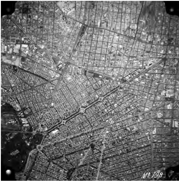
Figure 5: A vertical view of the area southwest of the Circle, crossed by Reforma Avenue. Mxim-2-3-5-4, Compañía Mexicana de Aerofoto, Mexico City, February, 1953. With permission from ICA Foundation, flight 868/198.