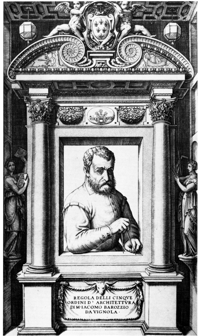
Figure 2: Title page of Vignola, Regola delli cinque ordini , 1562.

Until the second half of the sixteenth century, no real changes can be found in the ways in which authors wrote about the proportions of columns and column shafts. Sebastiano Serlio published the first of his books (Book IV) in 1537, on the five orders, and in it he based his theory on Vitruvius. In describing the proportions of