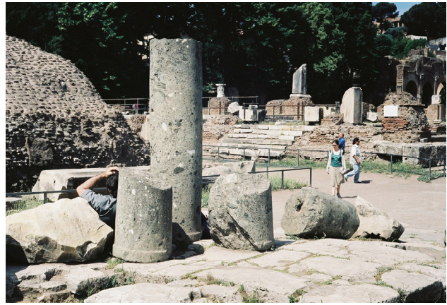
Figure 1: Rome, Forum. Fragments of column shafts that were 12 Roman feet long.

The reader will have difficulty grasping exactly how Vitruvius intended the module to be put to work. The 'method of symmetry' is put into practice by 'taking a