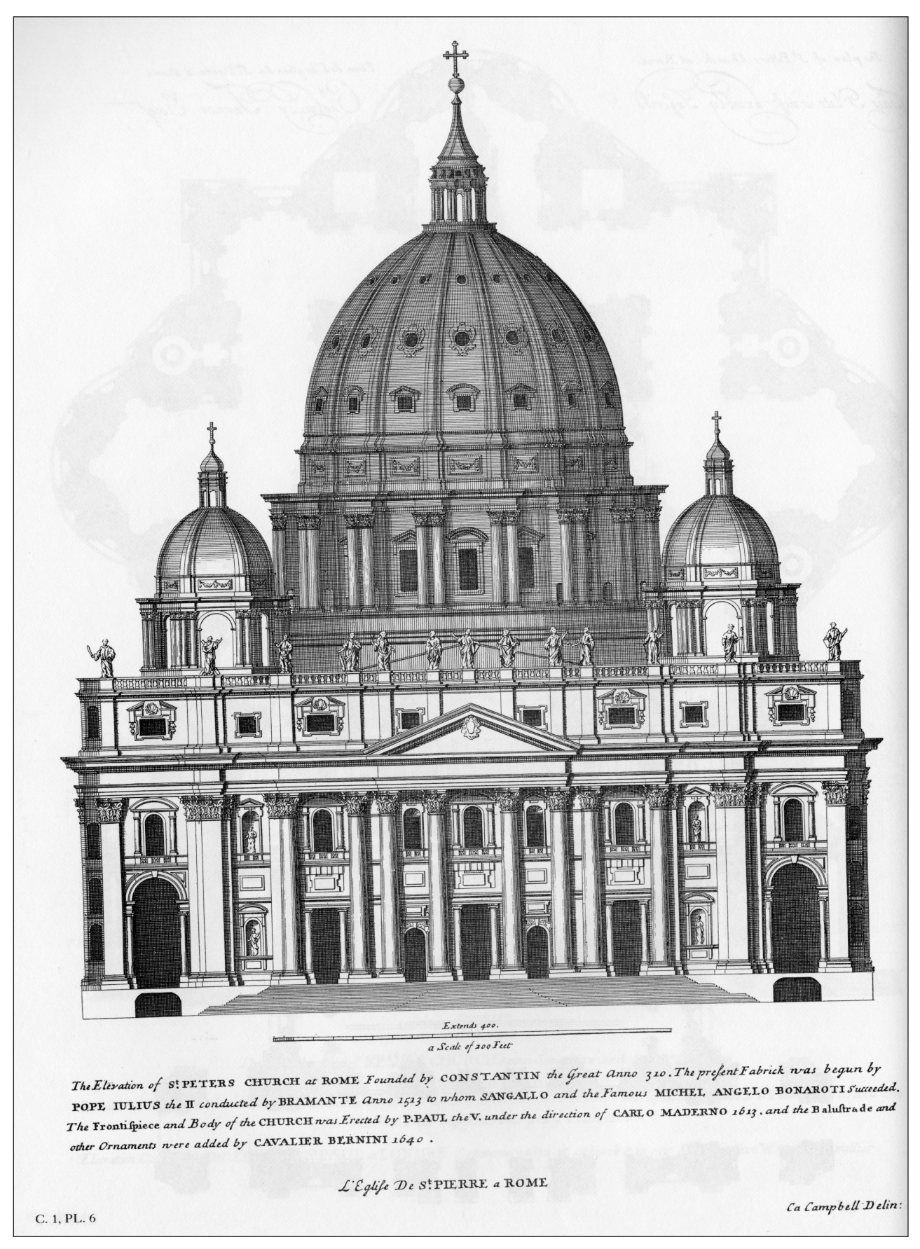
Figure 4: Donato Bramante, Antonio da Sangallo, Michelangelo Buonarotti, Carlo Maderno, and Gian Lorenzo Bernini, St. Peter's, Rome, 1506–1626. From Campbell (1715: plate 6).