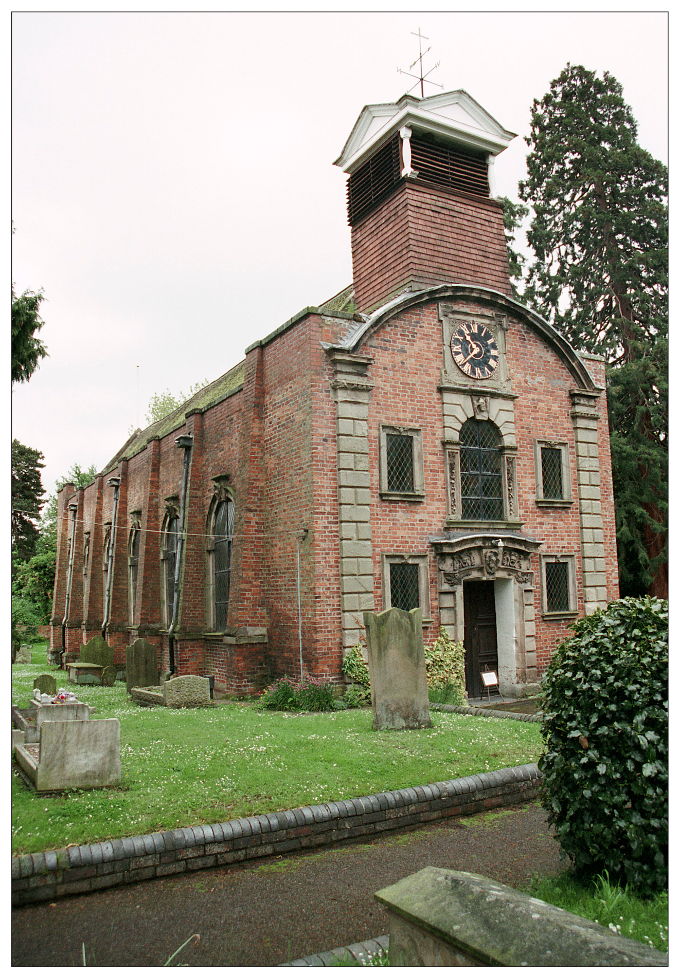
Figure 6: William Taylor, Church of the Holy Trinity, Minsterley, Shrewsbury, for Thomas Thynne Viscount of Weymouth, 1689. Image from National Heritage, Images of England: 258985. Photo by M I Joachim, 2001.