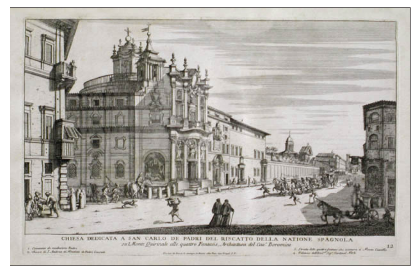
Figure 1: Francesco Borromini, San Carlo alle Quattro Fontane, Rome, 1634–1677. Engraving by Rossi. From Falda (1665).

Low Church movement in the early 18th century. This abrupt reversal in the book's scope is evident not so much in the addition of engravings of (unbuilt) Neo-Palladian architecture, as in the introduction written for that purpose by Colen Campbell in 1714–1715.