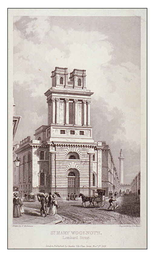
Figure 2: Nicholas Hawskmoor, St. Mary Woolnoth, London, 1716. Drawing by Frederick Mackenzie, engraving by J. Le Keux, 1838.

cannot be inferred from these images. Only in 1714 was Campbell's authorship of the book advertised, after he had provided an additional selection of plates along with eighteen unexecuted designs by his own hand. These later images were all in a Palladian style. They accorded with the agenda he laid out in his introduction, but contrasted with the initial selection of plates (Harris 1986).