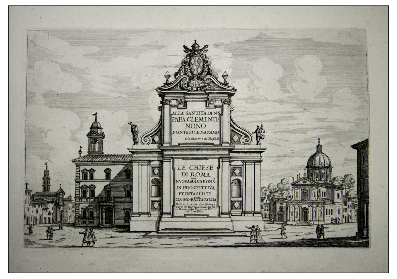
Figure 5: Giovanni Battista Falda, Le Chiese di Roma. Engraving by Rossi. From Falda (1665: frontispiece).

Originally compiled in the mid 16th century by Lafreri, the Speculum romanae , or the Mirror of Roman Magnificence , features series of maps and views of the major monuments and antiquities of Rome. Tourists and collectors readily bought prints from Lafreri, often customizing their selections and then binding them. Well after the publisher's death, the prints remained widely popular. In the 1660s, Falda, a Roman architect and