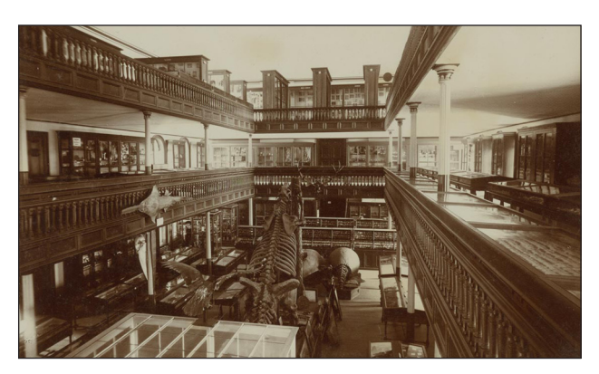
Figure 8: Public display of photographs on the top level, McGraw Hall by George S. Bliss. 1885. Albumen Print. Archives Photograph Collection, #13–6–2497. Courtesy of Division of Rare and Manuscript Collections, Cornell University Library.

Cobb: Learning Vicariously Art. 2, page 7 of 10