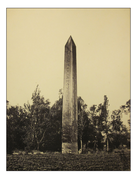
Figure 6: Obelisk of Heliopolis in Cairo. Albumen Print. Gift of Andrew Dickson White. Andrew Dickson White Architectural Photographs, #1–2–3635. Division of Rare and Manuscript Collections, Cornell University Library.

To understand the origins of the depiction of Egyptian architecture in a telescoping, monumentalizing way, as White's selection does, one must go back to the invasion of Egypt by Napoleon in 1798 and to his project documenting Egypt that resulted in the multi-volume Description de l'Egypte . One of the most noteworthy contributions of the Description is the drawings and etchings of Egyptian architecture. These plates, categorized as 'ancient' or 'modern', display architecture without people. People, on the other hand, are documented in their 'oriental' way in separate plates. While occasional exoticized Arabs are included with some 'modern' architecture, they are usually not placed