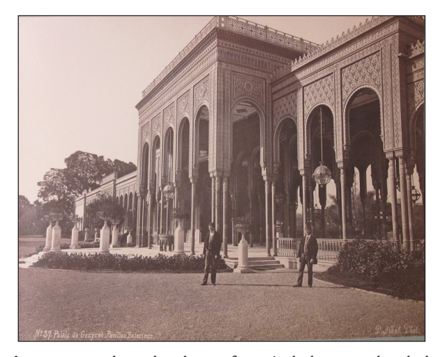
Figure 2: Park and Palace of Gezireh by Pascal Sebah. Albumen Print. Gift of Andrew Dickson White. Andrew Dickson White Architectural Photograph Collection, #15–5–3090. Division of Rare and Manuscript Collections, Cornell University Library.