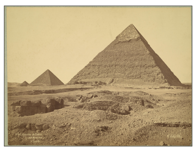
Figure 4: Giza. Pyramids of Khafre and Menkaure by Pascal Sebah, ca. 1865–89. Albumen Print. Gift of Andrew Dickson White. Andrew Dickson White Architectural Photograph Collection, #15–5–3090. Division of Rare and Manuscript Collections, Cornell University Library.