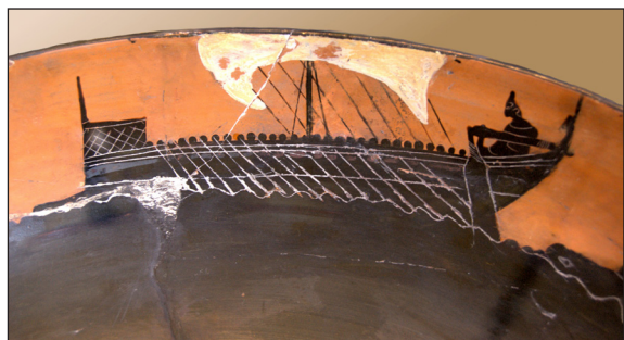
Figure 3: A black-figure cup painting of a vessel, c. 520, Leagros (inscription), Bibliothèque nationale de France (Wikimedia Commons).

McEwen and John Onians have argued that the imagery the first architects and possibly also their fellow men saw realised in the monumental temples was of a seaworthy ship, a paradigmatic example of masterful craftsmanship for many maritime communities in ancient Greece Figure 3 . In fact, a series of semantic and architectonic features of some of the temples support this speculative argument: The shrine, naos , of the god was semantically linked to vessel, naus (Hahn 2001: 87). Both were originally made of wood and had a similar cabinet design with what could be interpreted as prow, keel and stern, and ‘[T]he beak on a Greek war vessel occupied a similar position in the ship’s silhouette to the steps on the Ionic temple’ (Onians 2005: 54). Like a ship, the so-called peripteral temples also had wings, ptera , which refers to the external colonnade of columns sustaining the temple, a unique feature of many of the ancient Greek temples which ‘had much to do with an early understanding of architecture both as embodied flight and as navigation’ (McEwen 1993: 103). When a ship takes on wings in Homer and Hesiod, it appears to be flying, and one can imagine that the oars stretching out from the side and moving in unison look like wings. People and goddesses, armour and words could also become ‘winged’, which suggests the presence of an extraordinary force that links the earth to the sky.