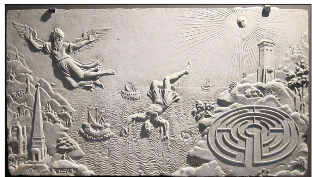
Figure 2: 17th-century relief, Daedalus and Icarus, Musée Antoine Vivenel.

As to the origins of the orders of ancient Greek temples, Barletta proposes to tackle this issue ‘by interweaving the tectonic and ornamental-symbolic interpretations’ (Barletta 2001: 143). Interweaving seems to be an equally adequate approach when searching for the origins of architectural imagery in tectonic visionary forms.