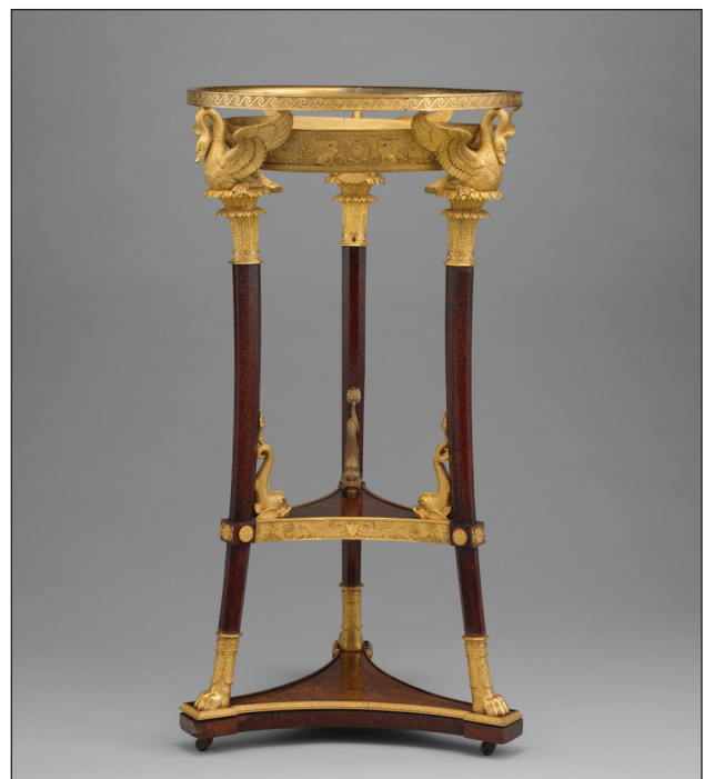
Figure 3: Athénienne , design attributed to Charles Percier (1764–1838); mounts gilded by Martin-Guillaume Biennais, 1764–1843 (active ca. 1796–1819), 1800–14; legs, base and shelf of yew wood; gilt-bronze mounts. Metropolitan Museum, Bequest of James Alexander Scrymser, 1918.