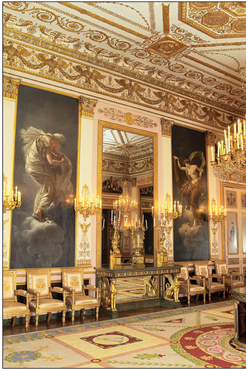
Figure 6: Hôtel de Beauharnais, Salon of the Four Seasons, with wall paintings of the four seasons from the studio of Anne Girodet-Trioson.

weightless manner, the wall paintings published in the first volume of the Pittura antiche d'ercolaneo e contorni (1757, vol. 1: plates XIX and XX).