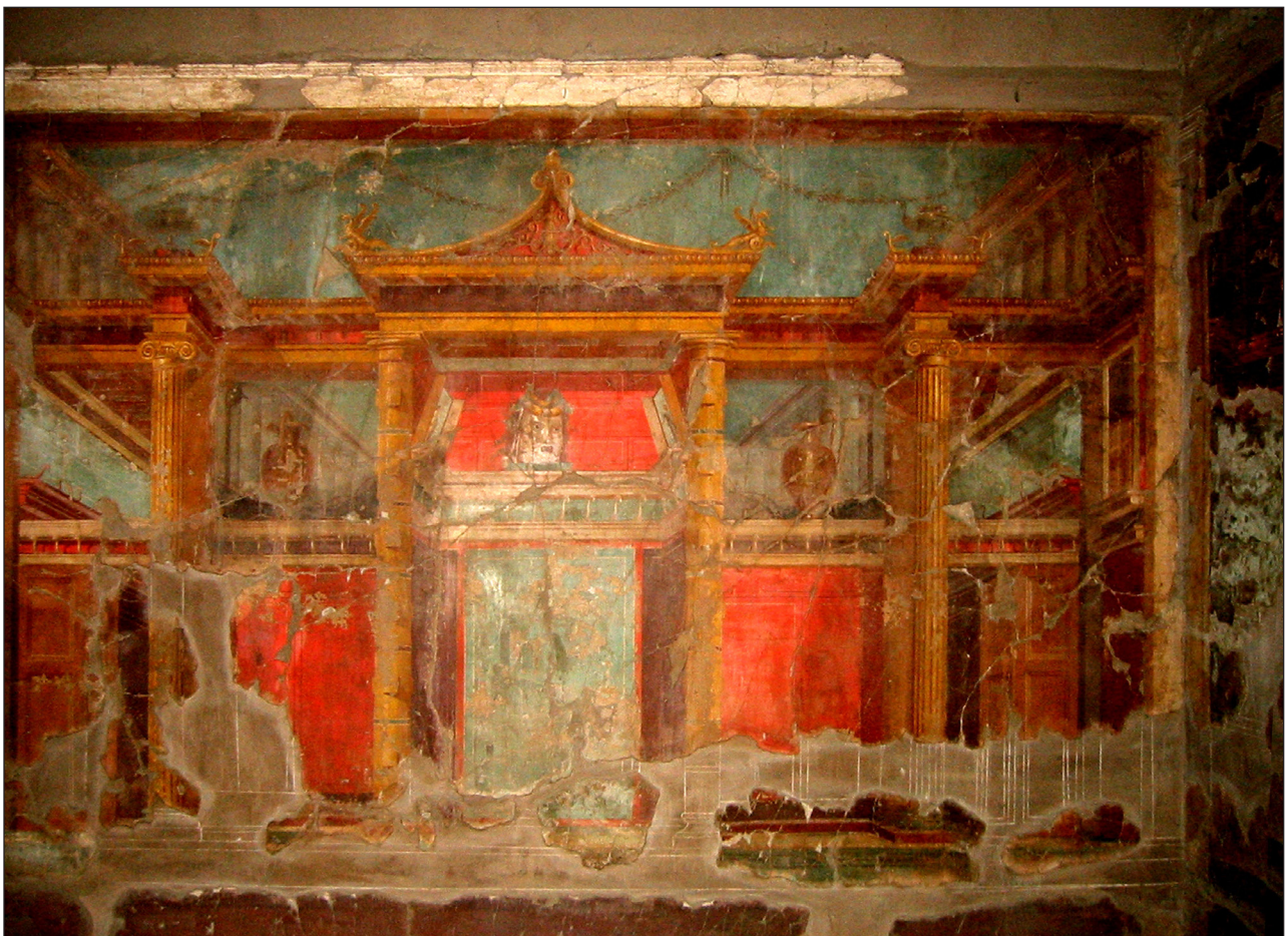
Figure 13: Villa Oplontis, now Torre dell'Annunziata, Room 8, c. 50 AD.

The statues of the Ptolemaic rulers represented as pharaohs form probably the best-known example of this new way of combining different styles in one artefact, but the architecture of Alexandria also shows this new attitude towards design ( Figures 13 and 14 ; see also Spier et al. 2018, cat. no. 106 and fig. 48). Its influence spread across the Near and Middle East. Now that most monumental architecture in Alexandria itself no longer survives, the more intact monuments of Petra give a very good idea of what has often been called Hellenistic baroque: the use of broken and elliptic pediments; convex and concave fronts; combinations from different orders into one constellation,