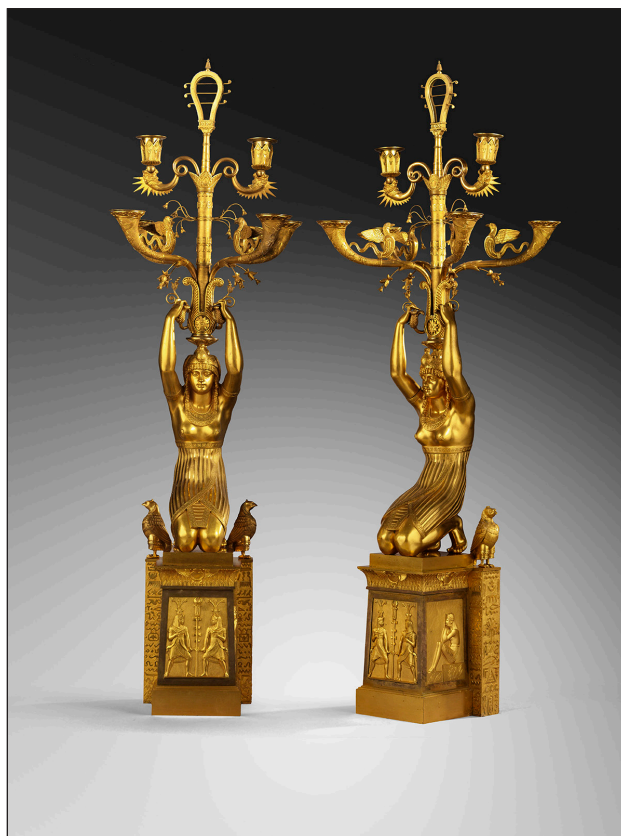
Figure 8: Lucien-François Feuchère, Kneeling Nubian Women Candelabra , gilt bronze, 1804–6, Hôtel de Beauharnais, Grande Galerie.

But the designs themselves suggest a definite ancestry, rooted in Piranesi's life-long attempts to recreate, in etchings and, at the end of his life, in objects as well, the presence of ancient Rome. Percier and Fontaine greatly admired his work and must have been familiar with Piranesi's museo , his collection of antiquities, restorations and original artefacts in his house on the Via Tomati. Even after the sale in 1784–85 of a large part of the collection to the King of Sweden, substantial parts remained on view in Rome (Panza 2017: 42–45). For one of his envois Percier prepared a graphical reconstruction of the Column of Trajan, the monument Piranesi had etched at the end of his life in a very large plate measuring more than five metres. In his own reconstruction, Percier follows Piranesi's interest in crowded compositions consisting of arms, trophies and sacrificial instruments, which Piranesi also displayed in Santa Maria del Priorato (Raoul-Rochette 1840: 246–68; Frommel et al. 2014). Objects made by Piranesi are reproduced in Percier's designs, such as the colossal candelabrum Piranesi had designed for his own tomb, and which Louis XVIII eventually acquired for the Louvre, where it remains. Also, the rhyton ending in a boar's snout included in Piranesi's last printed collection,