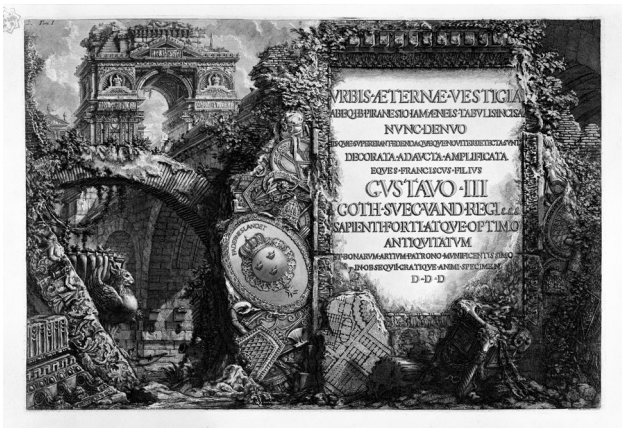
Figure 9: G.B. Piranesi, Antichità romane , first frontispiece, c. 1750.

There is also a striking similarity between the composition and layout of objects in Piranesi's collective views of Roman antiquities, for example in the first frontispiece to the Antichità romane (1756; Figure 9 ). They all look like idealized open-air musea displaying Roman architectural fragments, statuary, tombs, altars and parts of the orders, and there is the same mixture of Greek, Roman, Etruscan