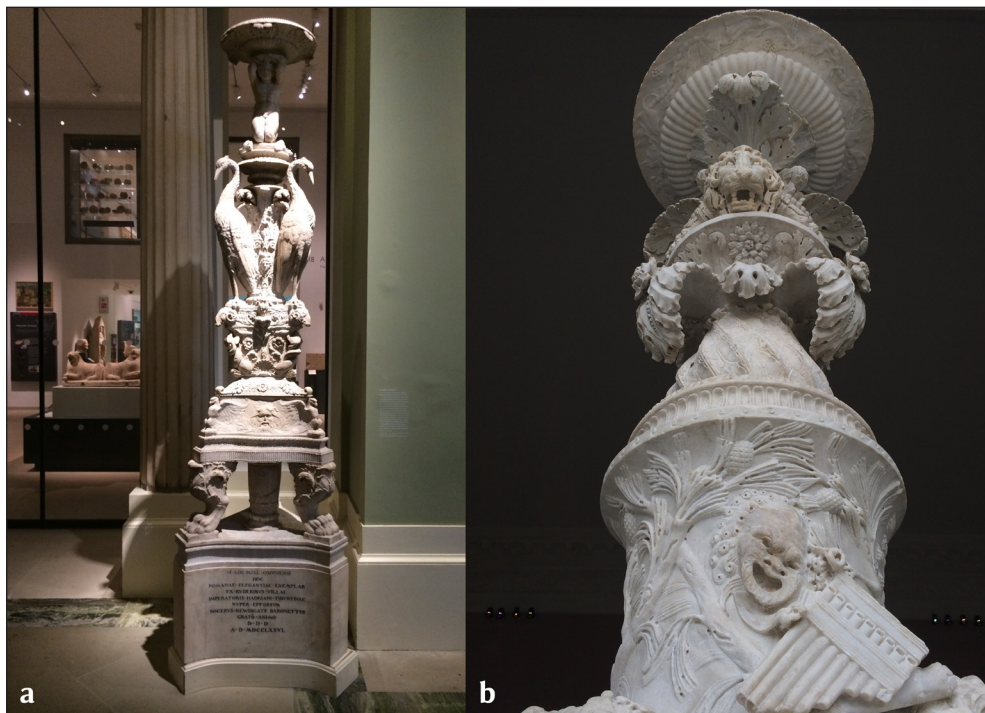
Figure 10: a (left): G.B. Piranesi, two marble candelabrum, h. 300 cm, made of various elements (Roman, 15th and 18th century), after a design by Piranesi. Acquired by Sir Roger Newdigate in 1774, donated to Ashmolean Museum, Oxford University, in 1775. b (right): G.B. Piranesi, marble candelabrum, 353 cm high, made of various elements (Roman, 15th and 18th century, after a design by Piranesi. Acquired from his estate in 1815. Musée du Louvre, Paris.

The design of all three candelabra follow the same basic scheme ( Figures 10a, 10b, and 11 ): a pedestal consisting of three legs, in which lion claws grow into acanthus leaves, or as in the one now in the Louvre, into a lion's head biting into the lower leg. These legs support a carrying structure derived from Roman altars and display