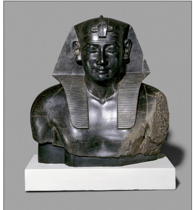
Figure 16: Head and upper torso of a black basalt statue of a king wearing the nemes, perhaps Ptolemy I, c. 305–282 BCE, basalt. The British Museum, London.