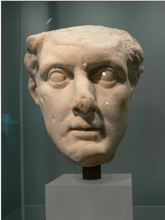
Figure 15: Bust of a Ptolemaic king, perhaps Ptolemy I, Copenhagen: Ny-Carlsberg Glyptothek.

An important feature of such Alexandrianism, both in poetry and the visual arts or architecture, is its intense awareness of the past, of the historically constituted position of the artist. Alexandrianist art is an art determined by a poetics of appropriating, recreating and transforming