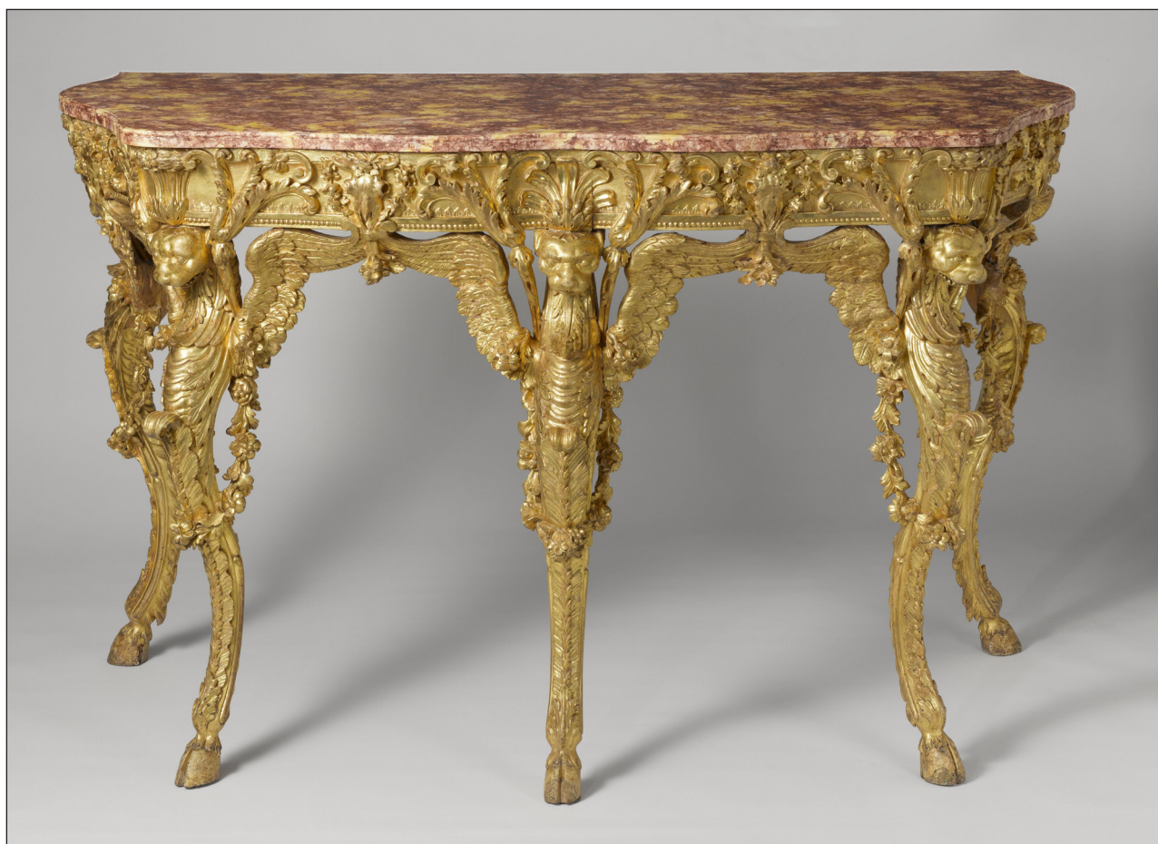
Figure 12: G.B. Piranesi, side table, c. 1768, gilt oak, limewood, marble. Amsterdam: Rijksmuseum Photo: Rijksmuseum Studio.

Piranesi's late work reveals an approach to composition that is very different from the Vitruvian and Academic tradition, which defended unity, simplicity, coherence and perspicuity. As the examples cited in the previous section show, Piranesi sought complex combinations of heterogeneous elements, and ignored the demarcations between genres and styles. Nor did he consider function or decorum as a guiding principle. Instead of symmetry and balance, he aimed for the creation of layers of objects. The resulting objects and images might be described as collages and bricolages, were it not that there is powerful logic at work