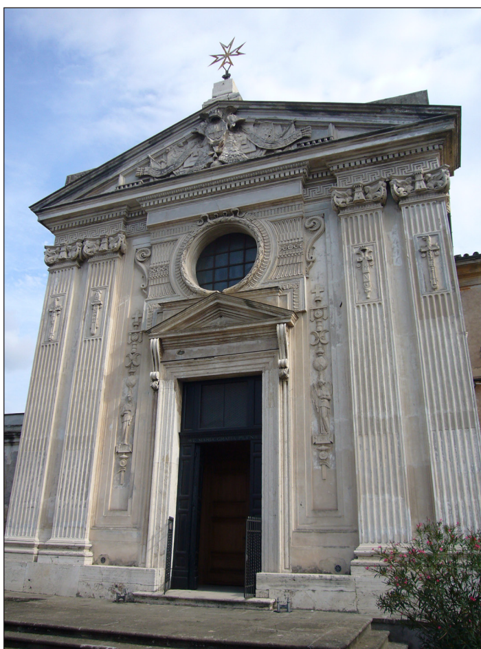
Figure 17: G.B. Piranesi, façade of Santa Maria del Priorato, 1764–66, Rome.

The second defining feature of the Empire style is a very Alexandrian awareness of the layeredness of the past, which resulted in a very consistent attempt to materially recreate it by making artefacts that somehow, in their formal richness and closeness to Roman precedents, would express that sense of layered continuity and perseverance. In his one built church, Santa Maria del Priorato, Piranesi comes very close to a built statement of this Alexandrian design concept, for instance in the reed sarcophagus motif surrounding the oculus, one of the few surviving elements from the previous, mediaeval fabric, and his version of the snake/egg-and-dart motif that reveals its own etiology (Figure 17). Such a layered, self-conscious integration of the past into the present, and of different cultures into a