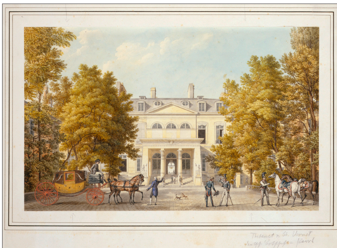
Figure 5: J. Thibault, View of the Court of the Hôtel de Beauharnais , watercolour, 1816; the figures of Prussian soldiers were added by Carle Vernet on the request of Alexander von Humboldt.

The larger-than-life paintings of the seasons and muses add to this atmosphere of illusion, since they are very similar, in the way they seem to come forward from their hazy background, to the way figures appear and take tangible form from a background of smoke and gauze in phantasmagorias and other multimedial shows, a new theatrical genre that was born at the same time as the Empire style (Warner 2006; Sawicki 1999). The figure of Winter in the Salon des quatre saisons, for instance, seems to move weightlessly in a mysteriously lit space, where a lamp seems to shine behind a veil of gauze. But they also recall, in their combination of a dark uniform background from which a figure appears to advance in a completely