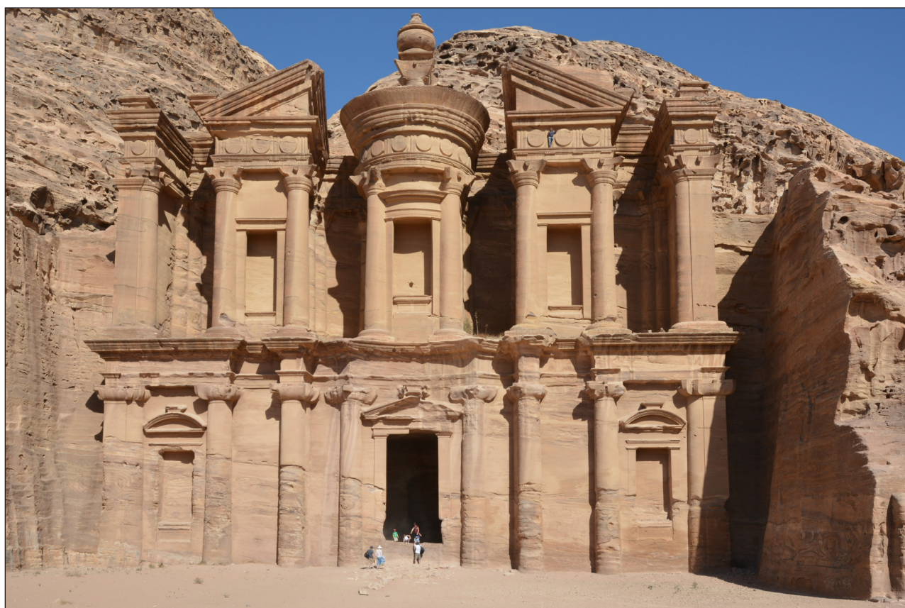
Figure 14: Petra, El-Dheir, 1st century AD.

such as combining an Ionic column with a Corinthian or composite capital, that were unheard of in Greece; the insistent presence of animal forms, often combining Assyrian, Egyptian, Greek and Roman elements into one artefact; and animation, which contemporary sources often commented on. All these elements, as we have seen, are also present in Pompeii and Herculaneum, and in the fragments surviving from Hadrian's Villa, which was the emperor's conscious attempt to recreate an Alexandrian complex in Italy, as is shown most clearly in the Canopus and Serapaeum (first noted in Hittorff 1861; see also McKenzie 2007: 100; Curl 2000: 123–48; MacDonald and Pinto 1995: 106–9). Piranesi, like Empire architects and designers such as Percier and Fontaine, was very familiar with these monuments of Hellenistic art and interior design.