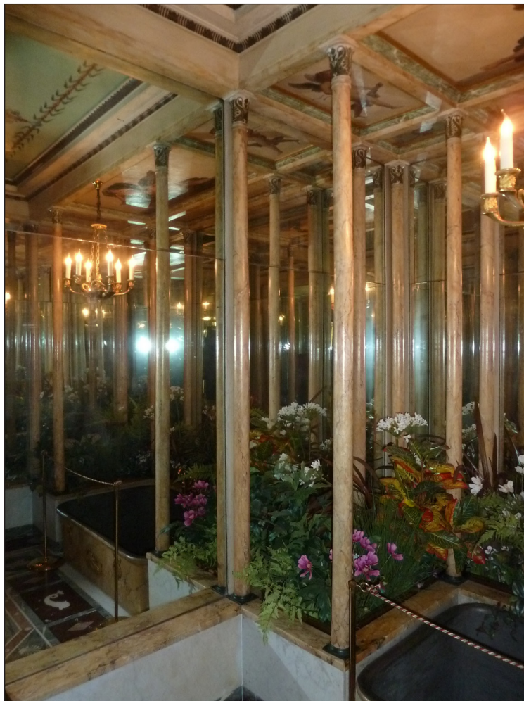
Figure 7: Hôtel de Beauharnais, Turkish Bath, 1803–6.

Once one starts to look more closely at the details of ornament and mouldings, it becomes clear that what appears at first sight to be a repetition of Roman or late 18th-century ornament, is in fact a much freer transformation of it. The classical orders, for instance, play a far less prominent role as the main generators of ornamental forms than in designs by Boffrand, his contemporaries, or successors like Jean-François Blondel. In interior design between 1750 and 1790, most conspicuous ornaments can easily be traced back to an element of the orders (capitals,