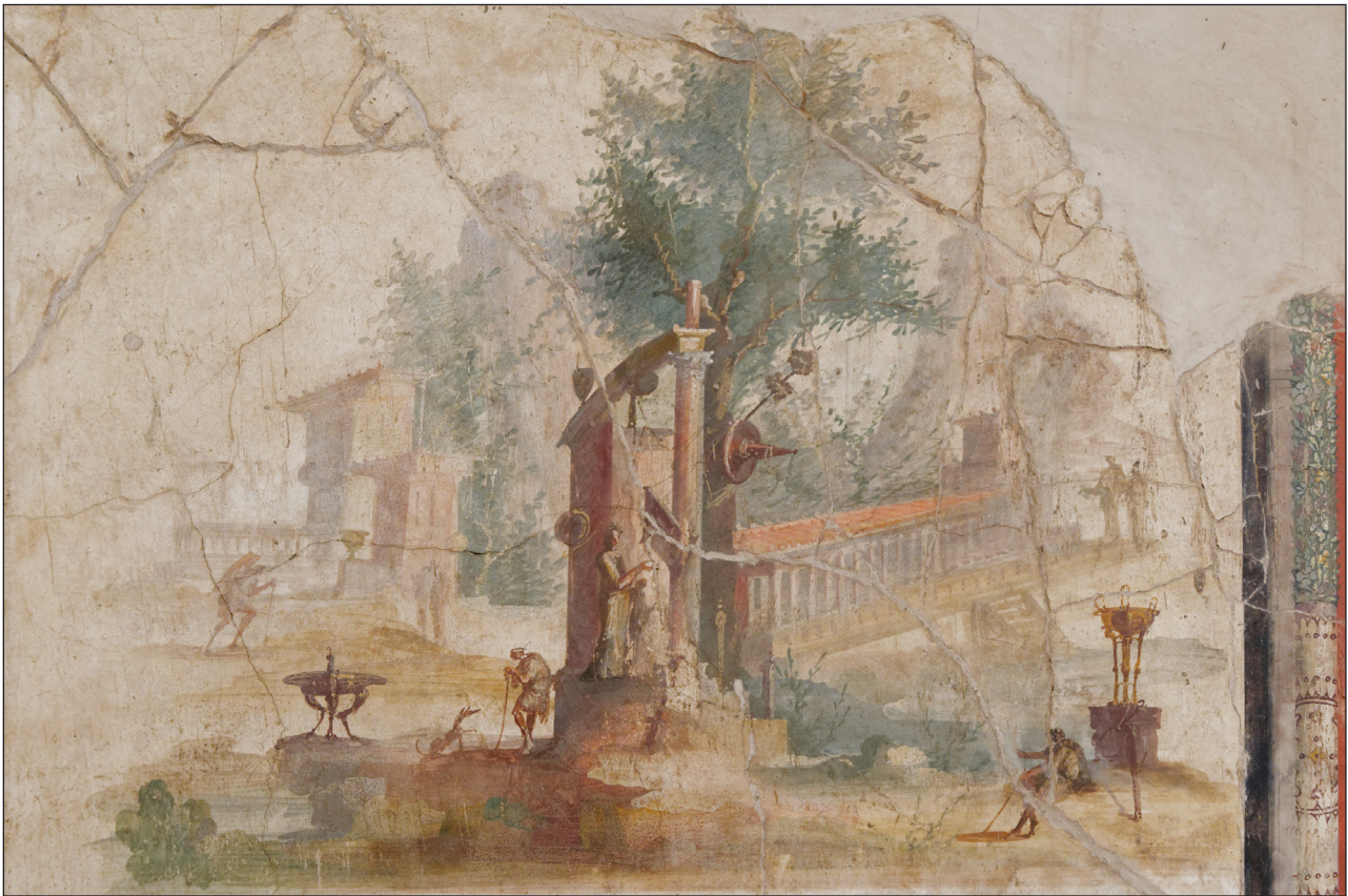
Figure 1: Villa Boscorecase, the so-called Alexandrian Landscape, c. 20–10 BC, Archaeological Museum, Naples.