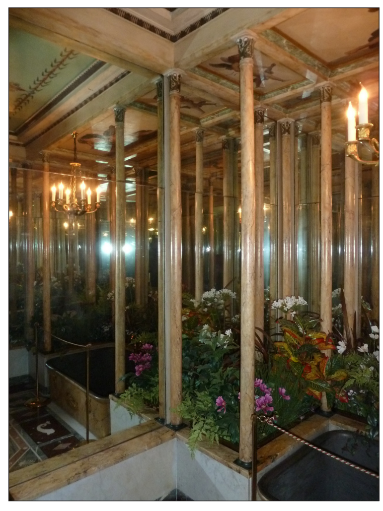
Figure 7: Hôtel de Beauharnais, Turkish Bath, 1803–6.

Once one starts to look more closely at the details of ornament and mouldings, it becomes clear that what appears at first sight to be a repetition of Roman or late 18th-century ornament, is in fact a much freer transformation of it. The classical orders, for instance, play a far less prominent role as the main generators of ornamental forms than in designs by Boffrand, his contemporaries, or successors like Jean-François Blondel. In interior design between 1750 and 1790, most conspicuous ornaments can easily be traced back to an element of the orders (capitals,