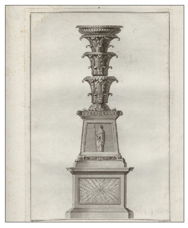
Figure 11: Barberini candelabrum, excavated in the 16th century from the Villa Hadriana, now in the Museo Pio-Clementino, Vatican, Rome, from E.Q. Visconti, Il Museo Pio-Clementino, Rome: n.p., 1788, vol. IV, Plate I.

When we put Piranesi's candelabra next to those surviving from Roman antiquity that Piranesi knew very well, such as the Barberini candelabra now in the Museo Pio-Clementino, it is striking to see how very different they are ( Figure 11 ). The Barberini candelabra have a clearly visible structure of pedestal, shaft and light-bearing disc, derived from acanthus and Corinthian forms, and a quite sober and coherent iconography of gods and small Erotes. Piranesi's work, however, presents a very riot of ornament, a profusion of elements taken from altars, the theatre,