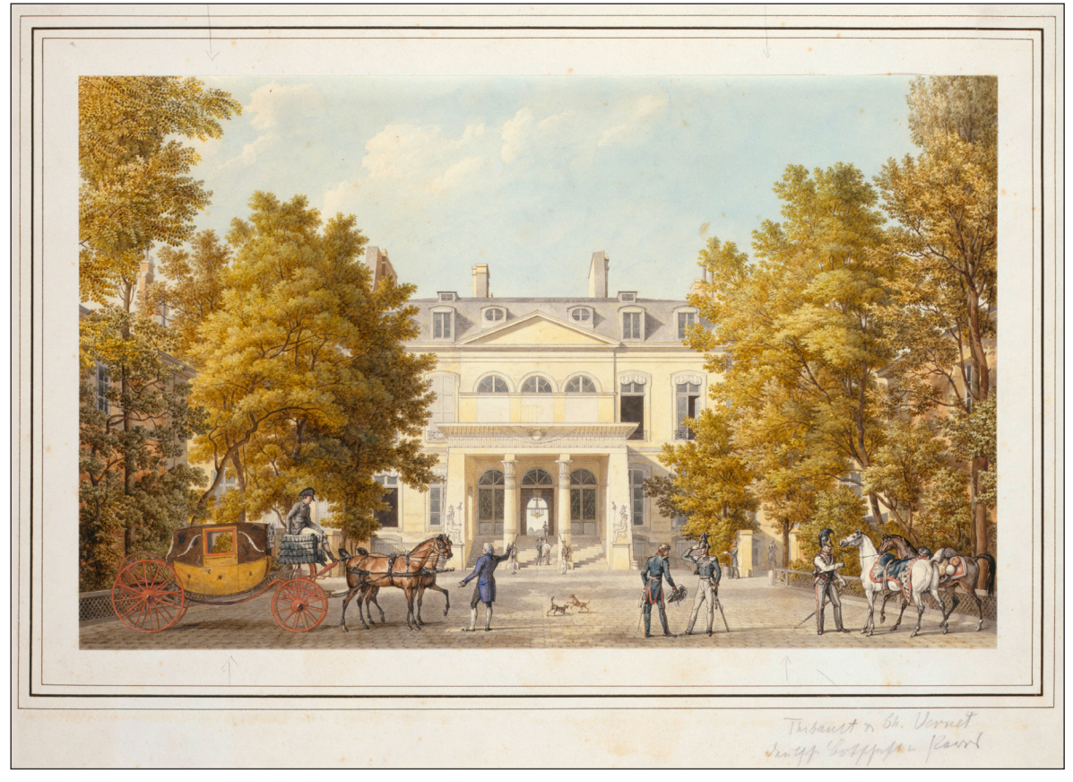
Figure 5: J. Thibault, View of the Court of the Hôtel de Beauharnais , watercolour, 1816; the figures of Prussian soldiers were added by Carle Vernet on the request of Alexander von Humboldt. Reproduced with permission of the Stiftung Preußische Schlösser und Gärten Berlin-Brandenburg.

The larger-than-life paintings of the seasons and muses add to this atmosphere of illusion, since they are very similar, in the way they seem to come forward from their hazy background, to the way figures appear and take tangible form from a background of smoke and gauze in phantasmagorias and other multimedial shows, a new theatrical genre that was born at the same time as the Empire style (Warner 2006; Sawicki 1999). The figure of Winter in the Salon des quatre saisons, for instance, seems to move weightlessly in a mysteriously lit space, where a lamp seems to shine behind a veil of gauze. But they also recall, in their combination of a dark uniform background from which a figure appears to advance in a completely