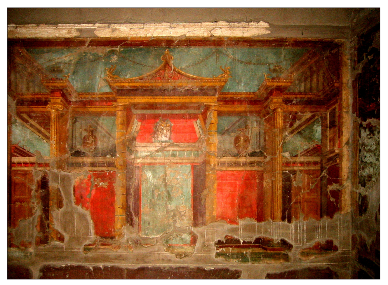
Figure 13: Villa Oplontis, now Torre dell'Annunziata, Room 8, c. 50 AD.

The statues of the Ptolemaic rulers represented as pharaohs form probably the best-known example of this new way of combining different styles in one artefact, but the architecture of Alexandria also shows this new attitude towards design ( Figures 13 and 14 ; see also Spier et al. 2018, cat. no. 106 and fig. 48). Its influence spread across the Near and Middle East. Now that most monumental architecture in Alexandria itself no longer survives, the more intact monuments of Petra give a very good idea of what has often been called Hellenistic baroque: the use of broken and elliptic pediments; convex and concave fronts; combinations from different orders into one constellation,