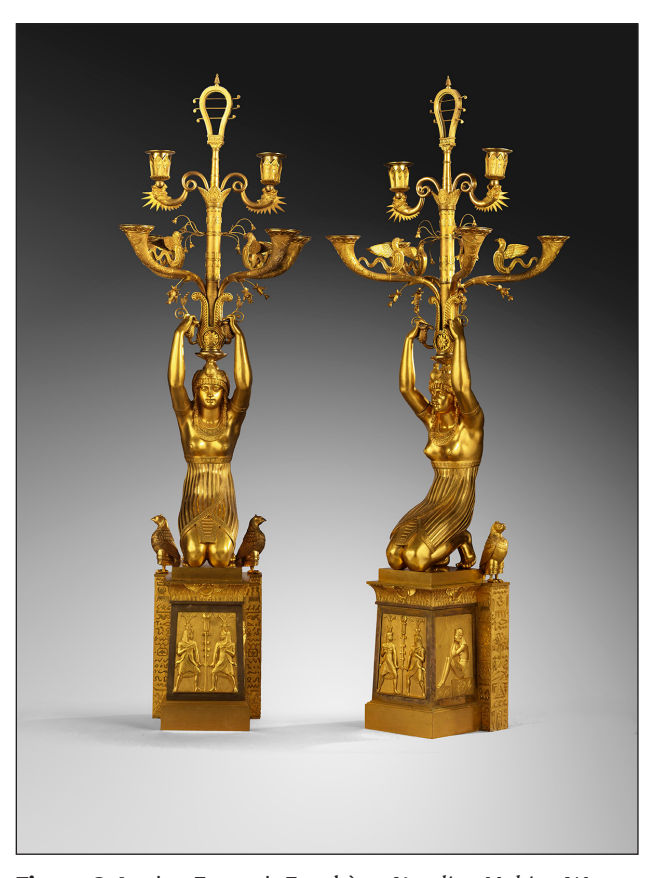
Figure 8: Lucien-François Feuchère, Kneeling Nubian Women Candelabra , gilt bronze, 1804–6, Hôtel de Beauharnais, Grande Galerie.

But the designs themselves suggest a definite ancestry, rooted in Piranesi's life-long attempts to recreate, in etchings and, at the end of his life, in objects as well, the presence of ancient Rome. Percier and Fontaine greatly admired his work and must have been familiar with Piranesi's museo , his collection of antiquities, restorations and original artefacts in his house on the Via Tomati. Even after the sale in 1784–85 of a large part of the collection to the King of Sweden, substantial parts remained on view in Rome (Panza 2017: 42-45). For one of his envois Percier prepared a graphical reconstruction of the Column of Trajan, the monument Piranesi had etched at the end of his life in a very large plate measuring more than five metres. In his own reconstruction, Percier follows Piranesi's interest in crowded compositions consisting of arms, trophies and sacrifical instruments, which Piranesi also displayed in Santa Maria del Priorato (Raoul-Rochette 1840: 246-68; Frommel et al. 2014). Objects made by Piranesi are reproduced in Percier's designs, such as the colossal candelabrum Piranesi had designed for his own tomb, and which Louis XVIII eventually acquired for the Louvre, where it remains. Also, the rhyton ending in a boar's snout included in Piranesi's last printed collection,