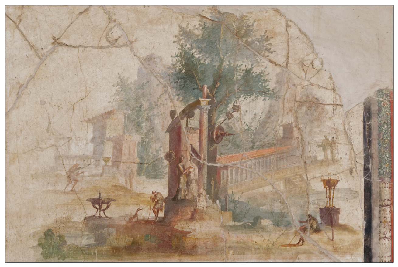
Figure 1: Villa Boscotrecase, the so-called Alexandrian Landscape, c. 20–10 BC, Archaeological Museum, Naples.