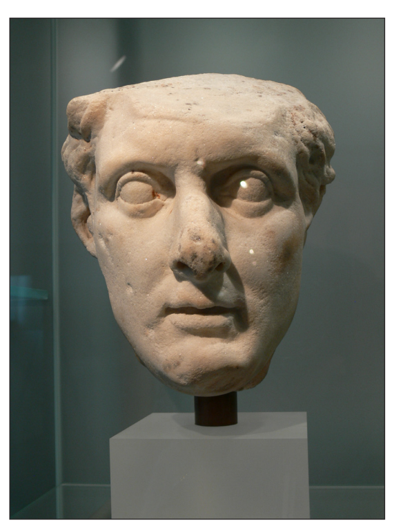
Figure 15: Bust of a Ptolemaic king, perhaps Ptolemty I, Copenhagen: Ny-Carlsberg Glyptothek.

An important feature of such Alexandrianism, both in poetry and the visual arts or architecture, is its intense awareness of the past, of the historically constituted position of the artist. Alexandrianist art is an art determined by a poetics of appropriating, recreating and transforming