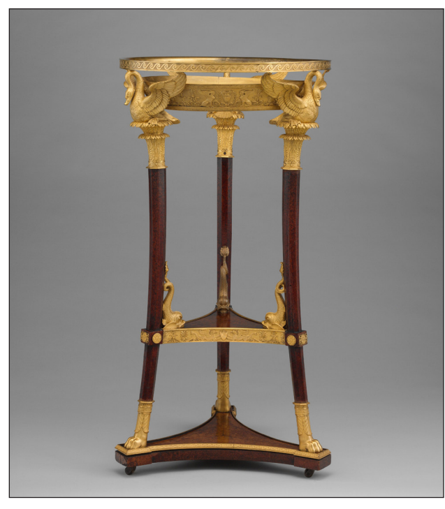
Figure 3: Athénienne, design attributed to Charles Percier (1764–1838); mounts gilded by Martin-Guillaume Biennais, 1764–1843 (active ca. 1796–1819), 1800–14; legs, base and shelf of yew wood; gilt-bronze mounts. Metropolitan Museum, Bequest of James Alexander Scrymser, 1918.