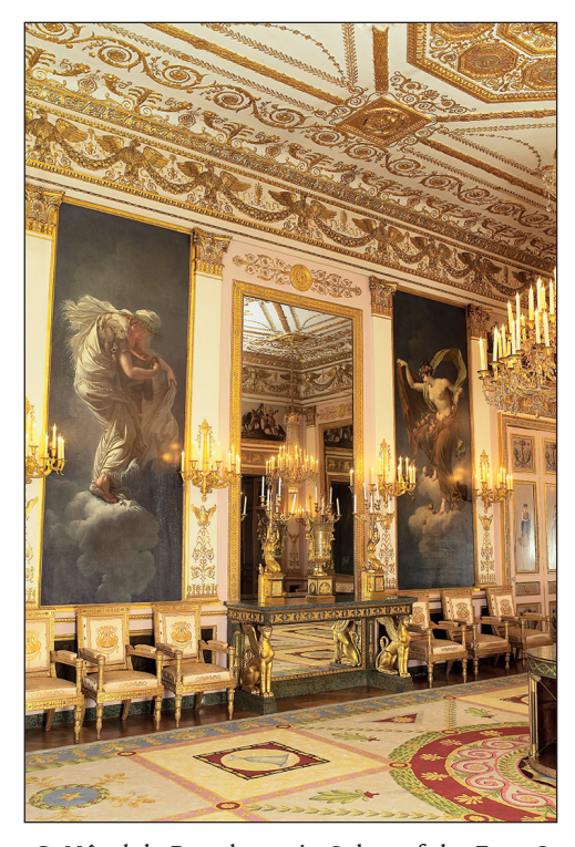
Figure 6: Hôtel de Beauharnais, Salon of the Four Seasons, with wall paintings of the four seasons from the studio of Anne Girodet-Trioson.

weightless manner, the wall paintings published in the first volume of the Pitture antiche d'ercolaneo e contorni (1757, vol. 1: plates XIX and XX).