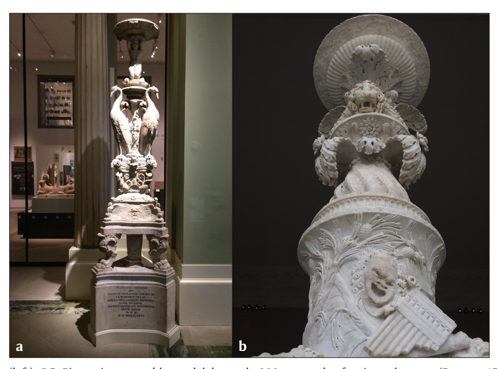
Figure 10: a (left): G.B. Piranesi, two marble candelabrum, h. 300 cm, made of various elements (Roman, 15th and 18th century), after a design by Piranesi. Acquired by Sir Roger Newdigate in 1774, donated to Ashmolean Museum, Oxford University, in 1775. b (right): G.B. Piranesi, marble candelabrum, 353 cm high, made of various elements (Roman, 15th and 18th century, after a design by Piranesi. Acquired from his estate in 1815. Musée du Louvre, Paris.

The design of all three candelabra follow the same basic scheme ( Figures 10a, 10b, and 11 ): a pedestal consisting of three legs, in which lion claws grow into acanthus leaves, or as in the one now in the Louvre, into a lion's head biting into the lower leg. These legs support a carrying structure derived from Roman altars and display