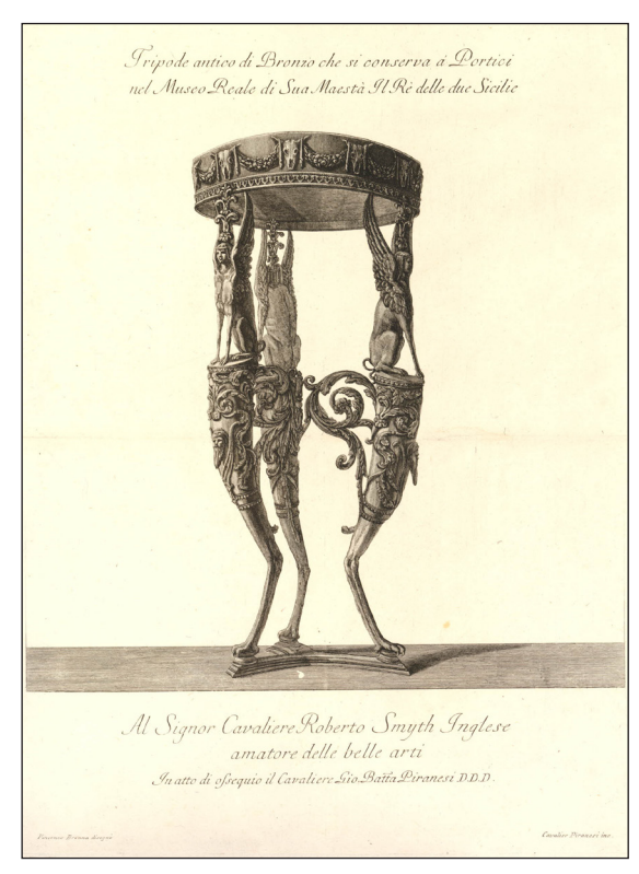
Figure 2: Giovanni Battista Piranesi, tripod with supports in the shape of sphinxes, after the tripod found in 1760 in the Isis temple in Pompeii. Published in Vasi, candelabri, cippi (Rome, 1771), plate 92.