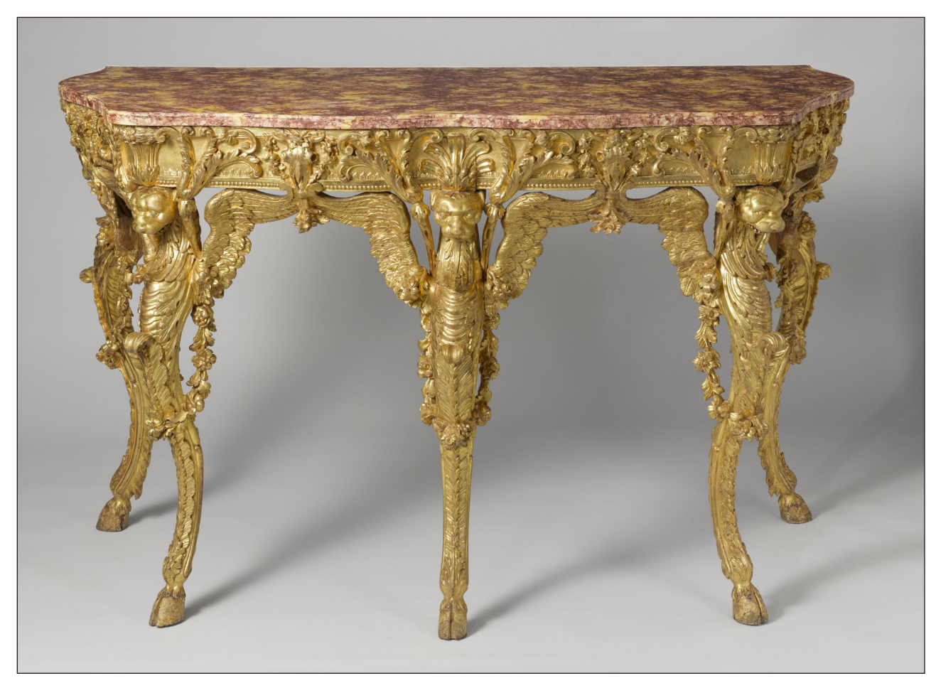
Figure 12: G.B. Piranesi, side table, c. 1768, gilt oak, limewood, marble. Amsterdam: Rijksmuseum

Piranesi's late work reveals an approach to composition that is very different from the Vitruvian and Academic tradition, which defended unity, simplicity, coherence and perspicuity. As the examples cited in the previous section show, Piranesi sought complex combinations of heterogeneous elements, and ignored the demarcations between genres and styles. Nor did he consider function or decorum as a guiding principle. Instead of symmetry and balance, he aimed for the creation of layers of objects. The resulting objects and images might be described as collages and bricolages, were it not that there is powerful logic at work