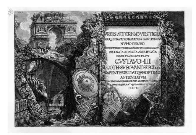
Figure 9: G.B. Piranesi, Antichità romane , first frontispiece, c. 1750.

There is also a striking similarity between the composition and layout of objects in Piranesi's collective views of Roman antiquities, for example in the first frontispiece to the Antichità romane (1756; Figure 9 ). They all look like idealized open-air musea displaying Roman architectural fragments, statuary, tombs, altars and parts of the orders, and there is the same mixture of Greek, Roman, Etruscan