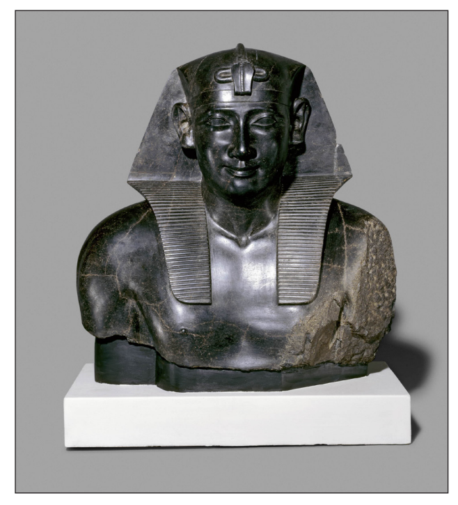
Figure 16: Head and upper torso of a black basalt statue of a king wearing the nemes, perhaps Ptolemy I, c. 305–282 BCE, basalt. The British Museum, London.