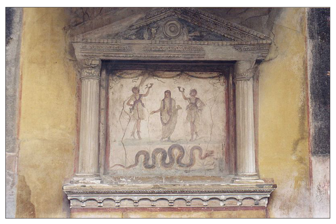
Figure 3: Depiction of the Genius Loci, Casa dei Vettii, Pompeii, 1st century AD. Image shows the Genius Loci, as the guardian spirit of the residence, standing between two household gods.

with inventive technologies to accommodate disruption. Discussing the reconstruction campaigns that followed the 2011 Japanese earthquake, Genadt shows how selected architectural proposals for the reconstruction of Tohoku were not mere responses to a state of emergency, but resonate with a history of resilient architecture that contextualizes them in the long term. His analysis highlights the balance that had to be met between government-driven 'engineering resilience', characterized by the implementation of durable, fail-safe solutions, and the local inhabitants' desire to maintain a link to their past, which may be regarded as a form of 'ecological resilience'. Highlighting the initiatives spearheaded by the ArchiAid and Home-for-All design groups in the reconstruction of Tohoku (2011-2016), Genadt relates how, in drawing upon the 'genetic information' of the region, architects realized resilient architecture that not only was physically strong, but also remained faithful to the long-standing spirit of the place.