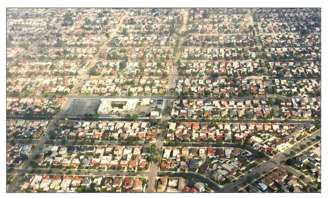
Figure 1: Aerial view of Inglewood, California. Photo by Leslie Evans, 2018.

protagonists to move beyond localized discussions of green technologies and sustainability. In this context, 'resilience' emerges as a pertinent concept that enables the transgression of limitations and blind spots of 20th-century modernist thinking and practice (Walker & Salt 2012).