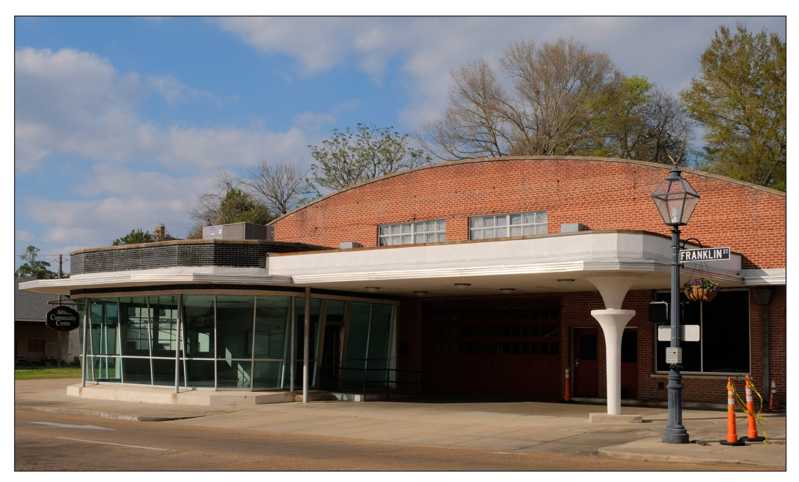
Figure 2: Former auto service station, repurposed as a community center, Natchez, Mississippi. In its physical form, the structure might be considered an example of American colonial architecture or resilient Palladianism. The building has also proven to be functionally resilient.

historically embedded in the modes of production and perpetuation of this historical knowledge? Do such longstanding ideas need to be decolonized and challenged, or should they be further developed to incorporate other possible forms of historical knowledge production? Selective genealogies proposed by architectural historians might deconstruct and critique their subjects, or alternatively, reconstruct and vindicate them. And since such conclusions are not mutually exclusive, history can be limited neither to the vantage of a single assessor, nor according to its own past trajectory. Through changing cultural attitudes and interpretations, the course of history unfolds as a responsive continuum, within which architecture and the built environment play major roles (cf. Giedion 1967: 5–6). As elucidated by the articles of this Special Collection, the concept of 'resilience' in architectural history provides a lens through which to look back, to examine constructs that previously were largely ignored, such as the Roman thermal baths or the constructions of Bernhard Klemm in the German Democratic Republic. At the same time, it offers a framework with which to reconsider oft-studied figures, concepts and structures – Pier Luigi Nervi, Louis Kahn and museum architecture, among others.