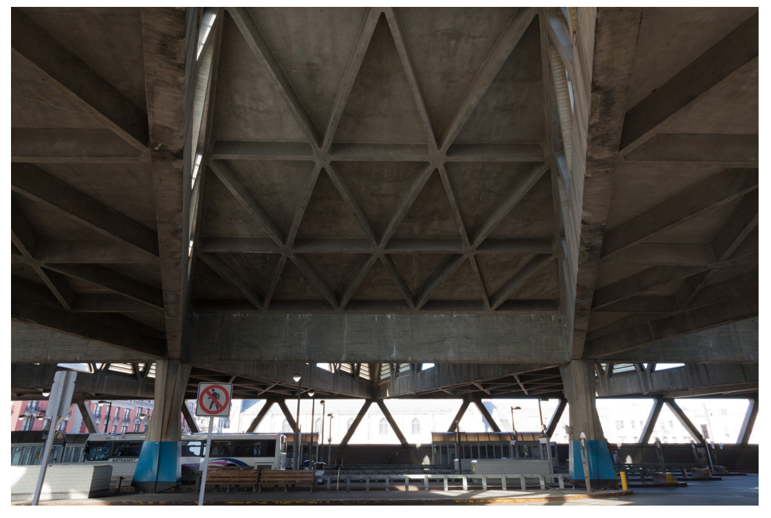
Figure 5: George Washington Bridge Bus Station, New York, designed by Pier Luigi Nervi (1961).

Roman classical architecture features again in the study of Marvin Trachtenberg, which interprets anew Louis Kahn's design for the New Yale Art Gallery (1951–53). Trachtenberg reads the project's huge, closed brick façade as a modernist interpretation of imperial architecture, harnessing, in spirit, the resilience of its formal characteristics and its symbolic associations. More provocatively, Trachtenberg argues that the ponderous Gallery façade was designed to appear physically defensive and resilient. As a visual 'Fire Wall' running along the edge of the Yale campus, Kahn's Gallery both guarded and separated the elite culture of the university from the city that surrounded it. In this case, the conceptual associations implicated in the idea of 'resilience' lead to a novel historiographical