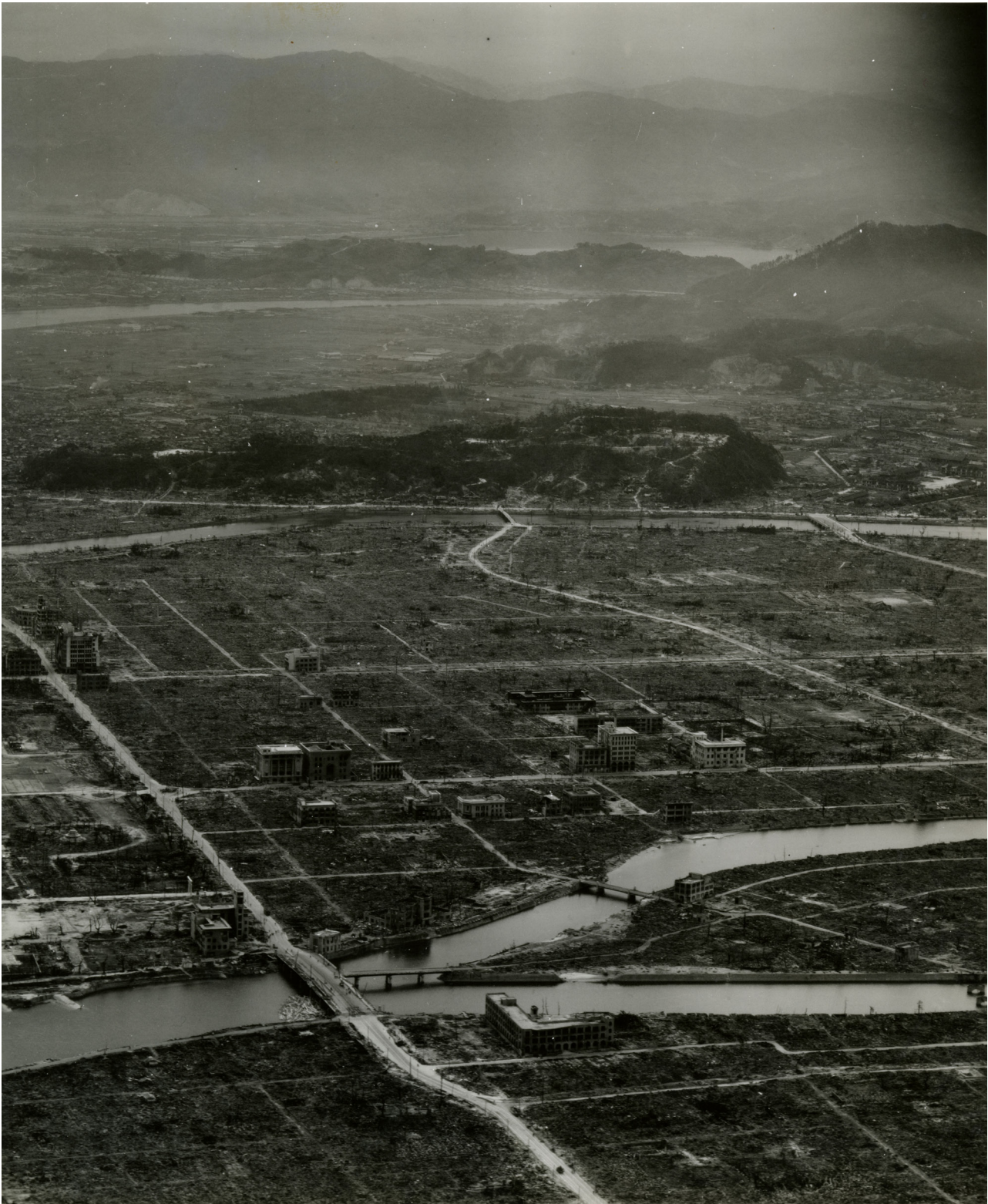
Figure 6: Photo of the destruction around the T-shaped Aoi bridge. H28US-004, Mrs. John V. Peterson, Photo Archives, Navy History and Heritage Command. Copyright: Hiroshima Peace Memorial Museum. [Please request permission from the source before copying].

an unwavering testimony to the realities of that time. (Molloy 2014)