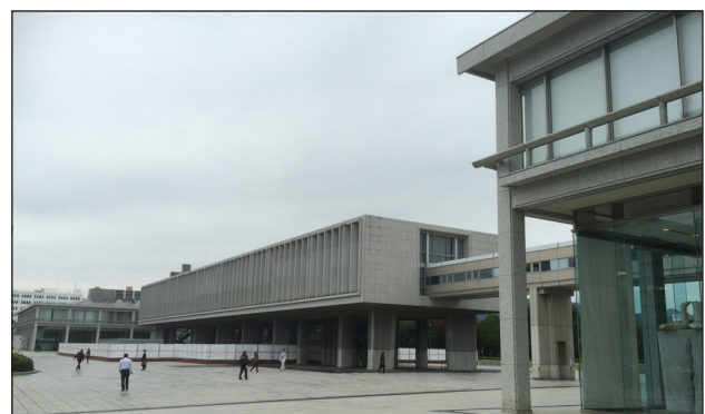
Figure 10: The Hiroshima Peace Memorial Museum is now connected via walkways to buildings east and west of the main one.

From the top of Orizuru tower, the observer's gaze is elevated, viewing the city from above – although not as high as the position from which the pilots dropped the bomb. In the redeveloped city, the destruction has become less visible; the memorial site barely stands out from its