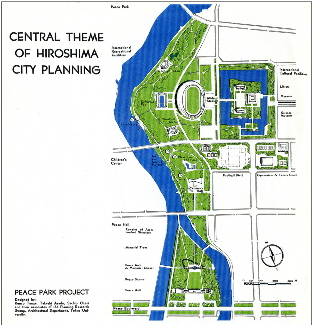
Figure 8: The Peace Park project by Tange Kenzō, From Peace City Hiroshima, in Peace City Hiroshima (Tokyo: Dai-Nippon Printing), undated (ca. 1948).

ing sequence splices footage from various sources, both documentary and imagined. It combines dimly lit shots of the intertwined healthy and beautiful bodies of a French actress and a Japanese architect, engaged in an illicit love affair, with harrowing images of atomic-bomb victims and horrific urban destruction, as well as stunning shots of the crisp and glittering modernist forms of Tange's Peace Memorial Museum in the heart of the rebuilt Hiroshima. It also combines the perspectives of victors, bystanders, victims, and scientists, as well as those who have visited the city in search of historical information or a sense of what happened here.