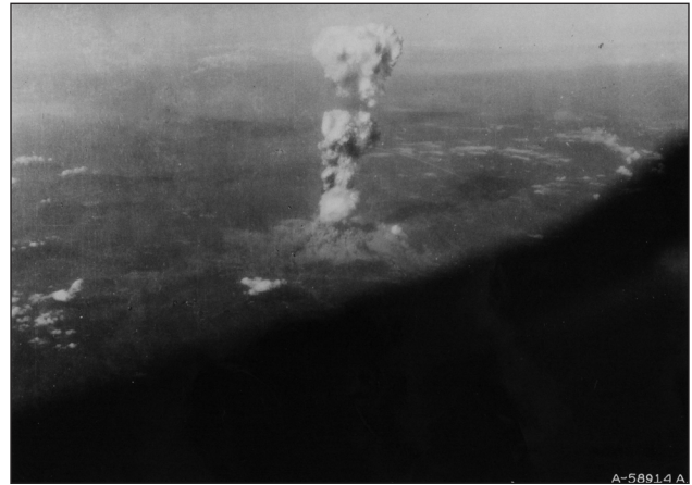
Figure 4: The mushroom cloud, photographed by a crew member on the Enola Gay on August 6, 1945.

in life-style and circumstance. . . . Today, with the remarkable recovery made by both Nagasaki and Hiroshima, it may be difficult to recall the past, but these photographs will continue to provide us with