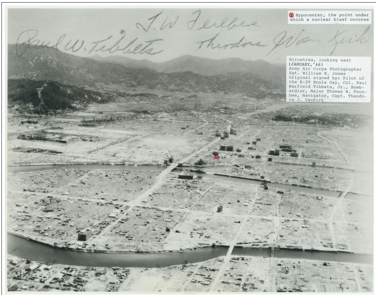
Figure 5: Photograph of the A-bombed city in June 1946, signed by the three crew members of the Enola Gay . H28US-009, William E. Jones, Research Division, The National Museum of the United States Air Force. Copyright: Hiroshima Peace Memorial Museum. [Please request permission from the source before copying].