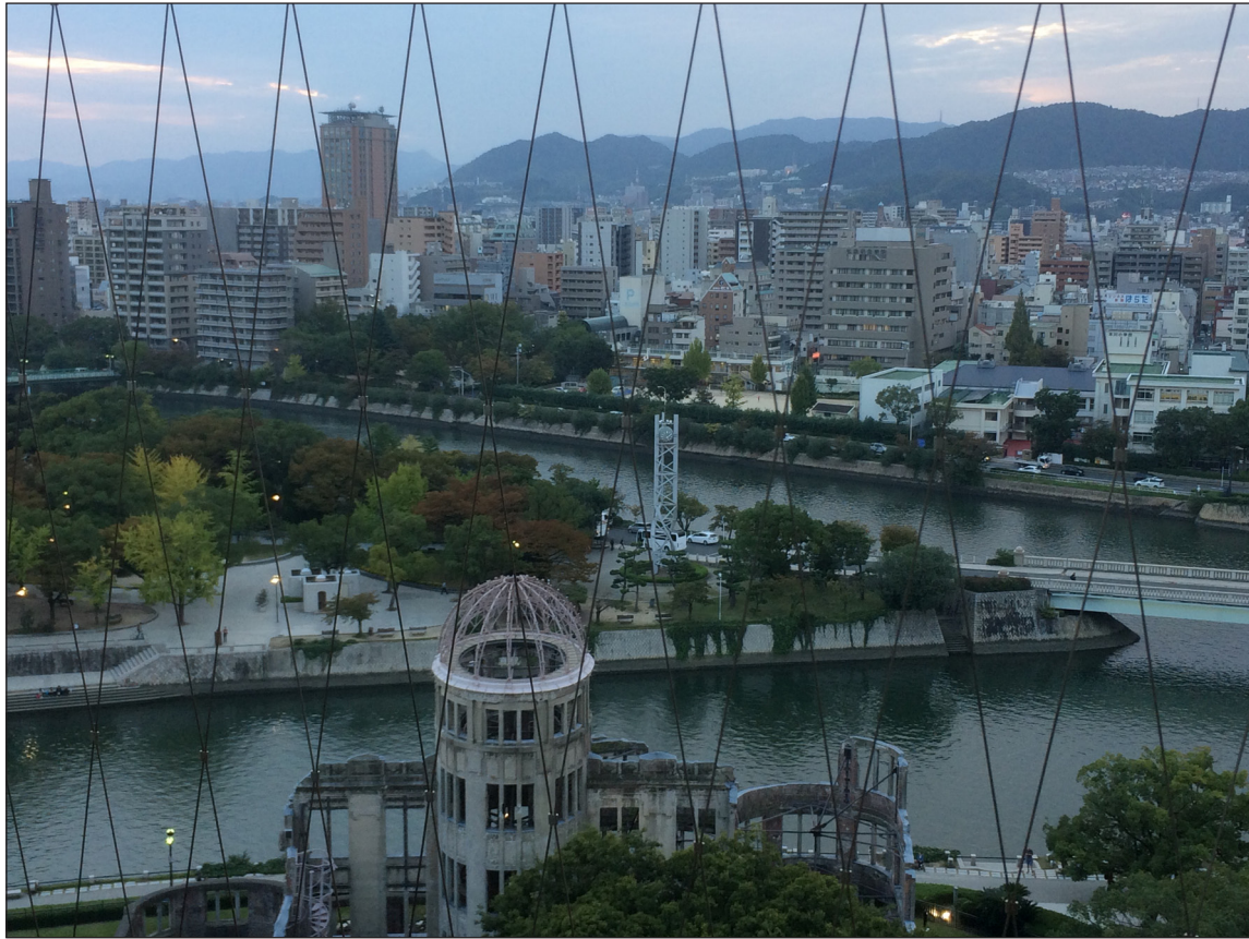
Figure 1: View of the A-Bomb Dome and Hiroshima City from Orizuru tower.