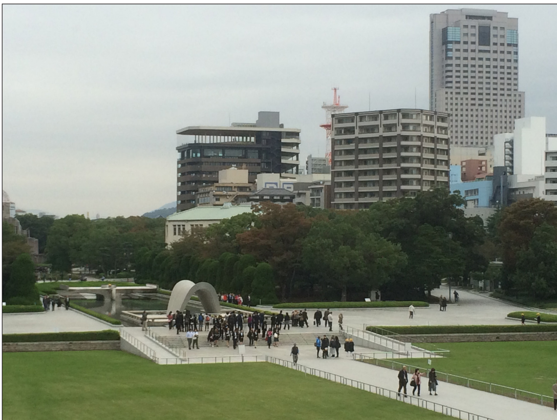
Figure 2: The Hiroshima Peace Memorial Park. In the background are the Memorial Cenotaph, which commemorates the victims of the atomic bomb, and the viewing platform of the Orizuru tower.