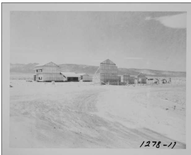
Figure 3: The Japanese village in the Nevada Desert. HABS NEV,12-MERC.V,2–1, Library of Congress. https://www.loc.gov/pictures/item/nv0166.photos.348546p/ .

A history of rapid reconstruction also helped Japan as a whole respond (at least partly) to unexpected levels of destruction. This included the enormous task of rebuilding 215 cities after the country surrendered to the Allies on August 15, 1945, effectively ending World War II (Hein, Diefendorf, and Ishida 2003). Drawing on generations of experience with disasters, the government made few memorial gestures but instead made significant infrastructural improvements, including the widening and straightening of streets, through a technique called land readjustment. However, the rebuilding of Hiroshima was an exception, as the bombing provoked a world-wide reaction that provided the impetus for a memorial.