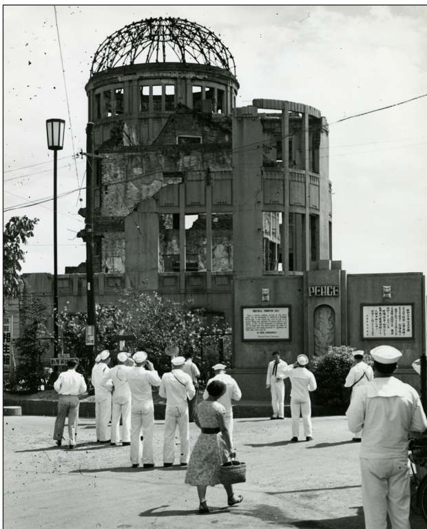
Figure 9: In 1955 sailors of the U.S. Navy visited Hiroshima and the A-Bomb Dome. Code: H28US-005, US Army, Photo Archives, Navy History and Heritage Command. Copyright: Hiroshima Peace Memorial Museum. [Please request permission from the source before copying].

For more than half a century, the Peace Memorial Park and the museum have served as the background to the yearly peace celebration and thus as a reminder of the horrors of war, and of urban resilience in the face of a