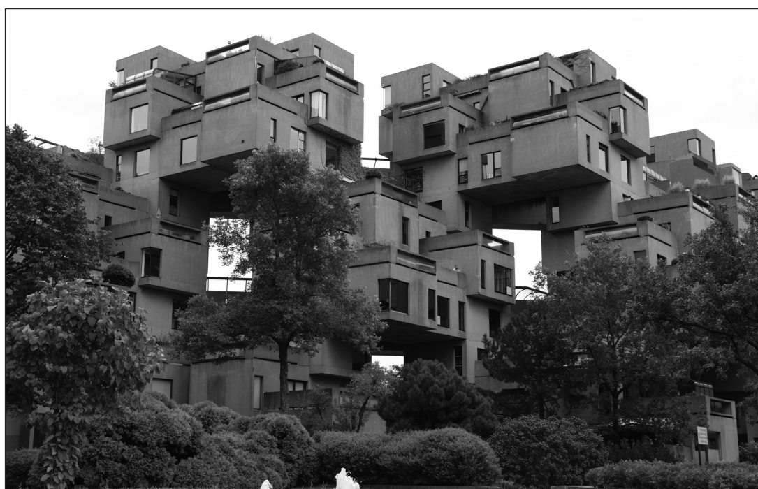
Figure 3: Moshe Safdie, Habitat, Expo '67, Montreal, 1965–67.

Among the book's most fully explored themes are the role and scope of professional expertise, design and planning movements and institutions, and the architectural components of modernism. In particular, the extended discussions of CIAM, the work of Patrick Geddes and