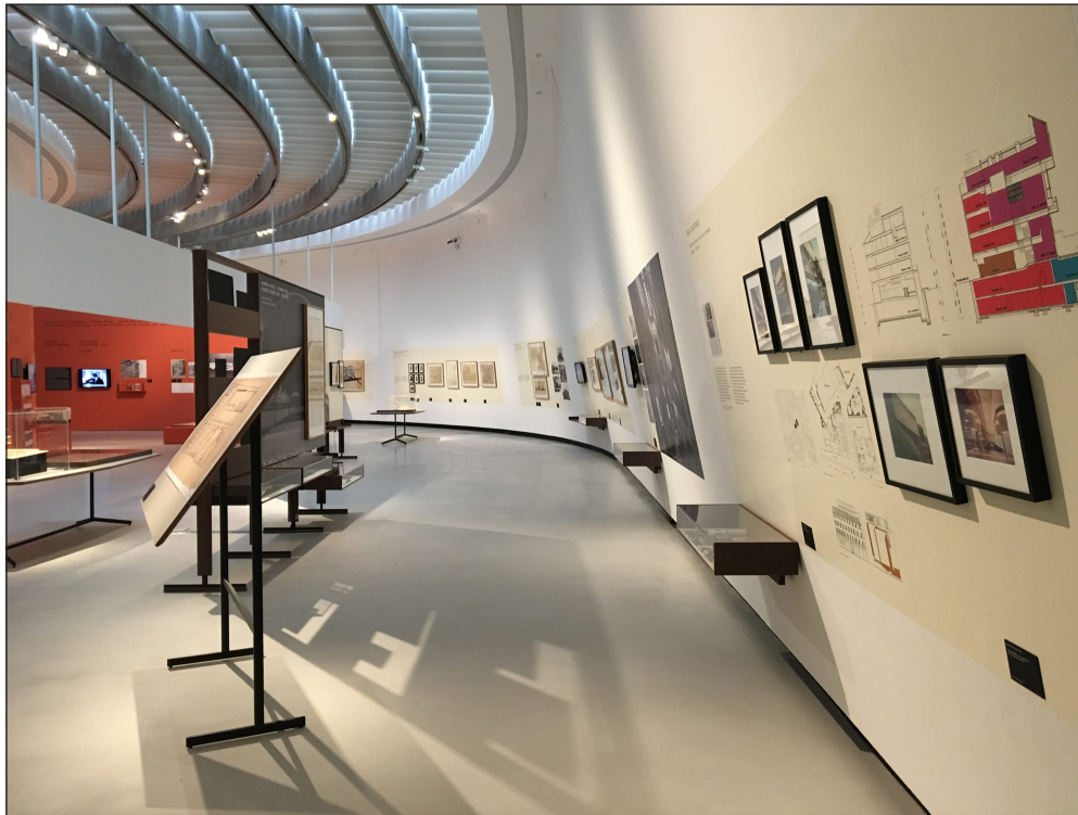
Figure 6: Zevi's Architects , exhibition installation at MAXXI.

a welcome commissioned model which adds to the material of this period. The 'edificio polifunzionale' in Rome's via Campania (Studio Passarelli, 1961–64) offers a rare intersection of a work presented in textual terms included, too, in televisual footage. Zevi's television and radio appearances spanned from contemporary architectural and urban criticism to discourses on the principles of architectural composition and apprehension, to lessons in the history of architecture. Speaking on the 'edificio polifunzionale' in a lengthy and didactic television segment, then, Zevi explains the urban sensibility of the stacked functions (retail, commercial, residential). When there is documentary footage for these projects, or interviews with an architect, headphones are provided so that his voice can be heard.