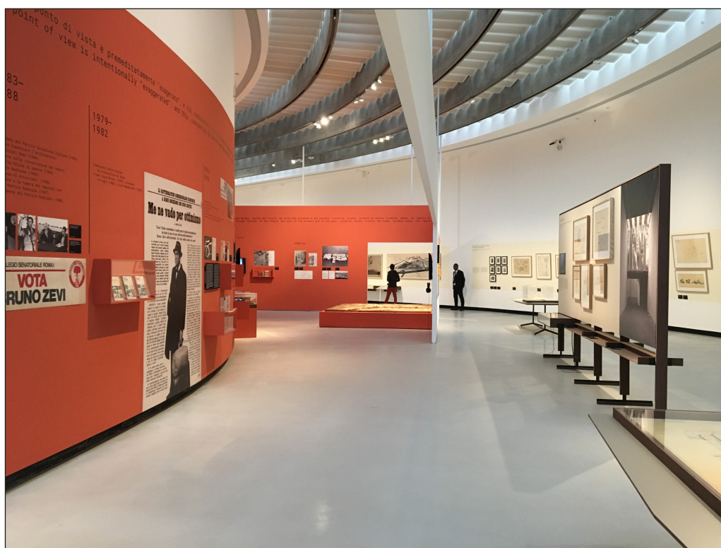
Figure 5: Zevi's Architects, exhibition installation at MAXXI.