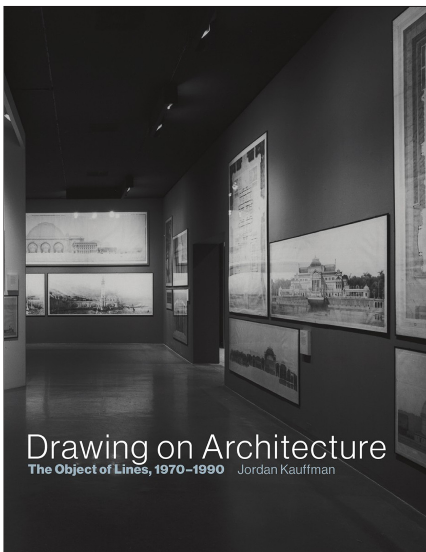
Figure 1: Book cover of Jordan Kauffman's Drawing on Architecture: The Object of Lines, 1970–1990 .

Four different types of collectors are described: private collectors, corporate collectors, commercial galleries, and major art institutions. According to Kauffman, these architectural drawing collections, beginning in the 1970s, gave rise to 'understanding architectural drawings as autonomous objects' as they began 'to be understood as art'. An entire chapter is devoted to the impact of architecture shows at the Leo Castelli Gallery. Already respected for launching careers of leading modern artists, in 1977 Castelli mounted the second commercial show in New York of contemporary architectural drawings. Despite a lack of commercial success, but with much critical attention, Castelli hosted two more shows, Houses for Sale (1980) and Follies (1983), which offered the purchase of either a drawing or an entire project built under direction of the architect. This approach to commissioning architectural services failed to attract buyers, though it intriguingly linked the commodification of drawing with building.