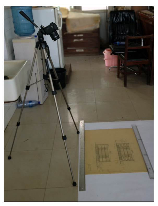
Figure 7: Documentation of archival drawings in Kumasi, Ghana, phot. Ł. Stanek, 2018.

theories can be traced in urban and regional planning. In the early 1960s several planners in Kumasi, both Ghanaians and Eastern Europeans, rethought the relationship between cities and the countryside beyond the development patterns inherited from the colonial period. They took issue with specific concepts such as that of the 'hinterland' and attributed them, controversially, to what they called 'capitalist planning'. This rethinking was