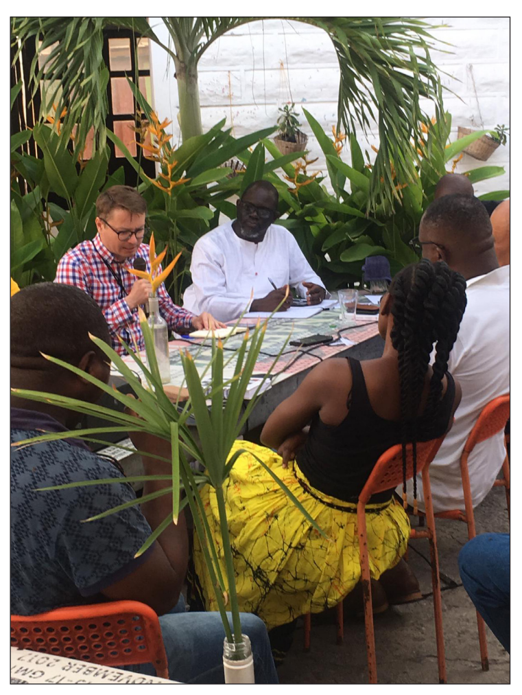
Figure 8: Discussion about the historical and future projects of the Marine Drive, James Town Café, Accra, Ghana.

Stanek: I'd like to understand your question as one about positionality: from where and for whom to write history ( Figure 8 ). Here is an illustration of this dilemma. When I started working on my book, it was focused on 'Central Europe', because this was how most people I interviewed in Poland and other countries in the same region localized themselves. Evidently, I felt that I needed to respect that geographic description. But when I was invited for the first time to speak about this research in Lagos, I was asked to change the description of my talk from 'Central'