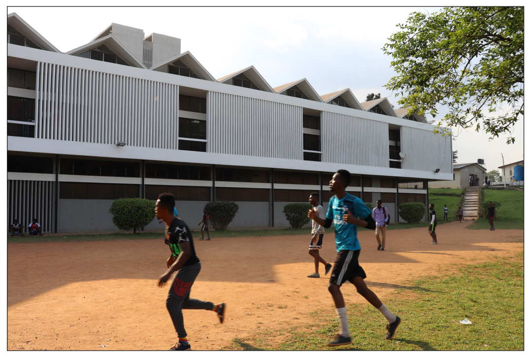
Figure 6: Unity Hall, Kwame Nkrumah University of Science and Technology, Kumasi, Ghana