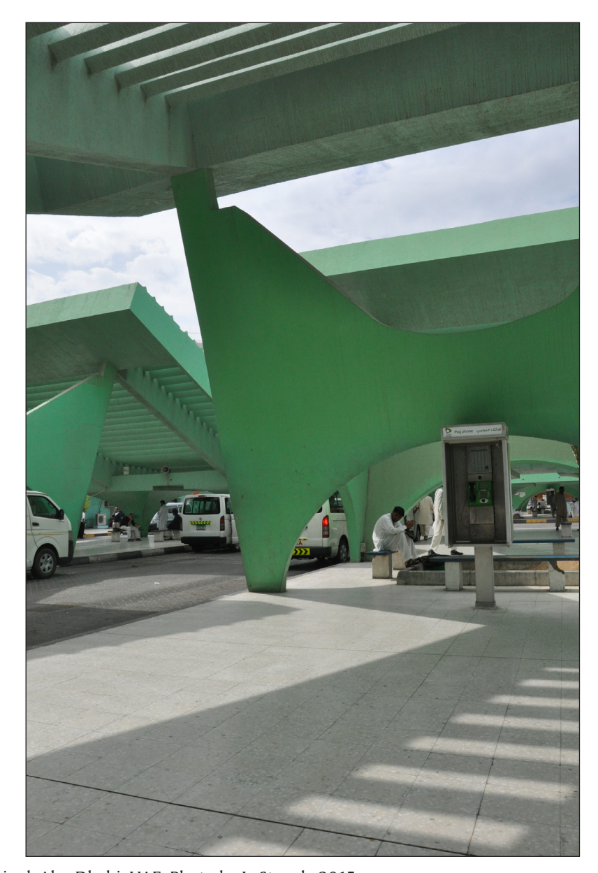
Figure 4: Bus Terminal, Abu Dhabi, UAE.