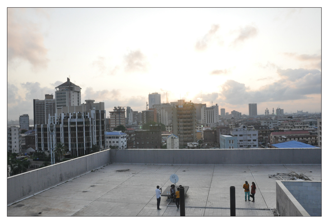
Figure 1: View of Lagos Island from the roof terrace of the City Hall, Lagos, Nigeria. Photo by Ł. Stanek, 2015.

The book shows many, evolving, and not always consistent motivations for these exchanges of the Soviet Union and its satellite states in Eastern Europe in the late 1950s, followed by Yugoslavia and China a few years later. Under Nikita Khrushchev, the Soviets promoted the socialist path of development for decolonizing nations in direct competition with the West. The satellite countries in Eastern Europe largely followed the direction laid out by the Soviets. But they also pursued their own political, economic, and ideological goals. In the wake of the oil crisis of the early 1970s, their motivation to mobilize