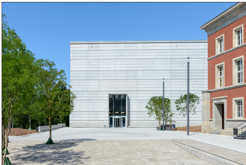
Figure 3: The new Bauhaus Museum, 2019, Weimar.

While the exterior of the Weimar Bauhaus Museum gives an illusion of modernity and anti-modernism in its material, inside, the technicity of its construction is celebrated. The semi-finished ceilings, with the solid T-beams or light shafts are partially exposed ( Figure 4 ). The visitors enter not into a polished exhibition hall, but into a factory space, an industrial building. Hanada wanted to assume the Bauhaus idea in the interior so as to emphasize the connection between art, technology, and industrial production. The lighting – dim and diffuse – underscores the industrial character of the interior. Unfortunately, however, the idea of an open space is divided and destroyed by the stairs and by the exhibition architecture of the Swiss Architectural firm Kobler and Holzer. Although typical Bauhaus materials of metal, glass and plexiglass are used, they are installed separately, in individual departments