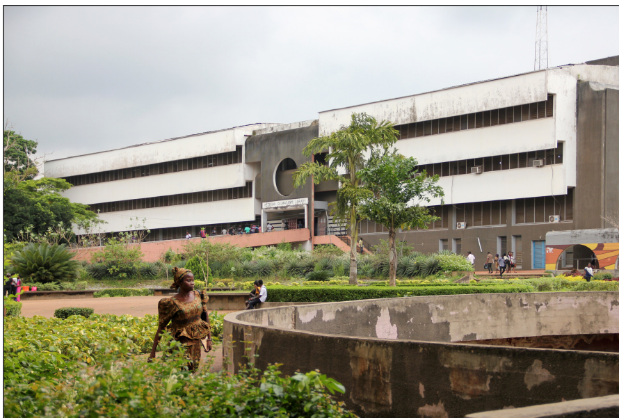
Figure 1: Ife Campus, Nigeria. Still from Zvi Efrat's documentary, Scenes from the Most Beautiful Campus in Africa , created as part of Bauhaus Imaginista , 2019.

The answer proved to be to move sideways, in an enormously ambitious global history project entitled Bauhaus Imaginista and curated by Marion von Osten and Grant Watson, which no longer focused on the school itself but on parallel developments around the world and the Bauhaus's sometimes tenuous relationship to them ( Figure 1 ). The material featured in those exhibitions