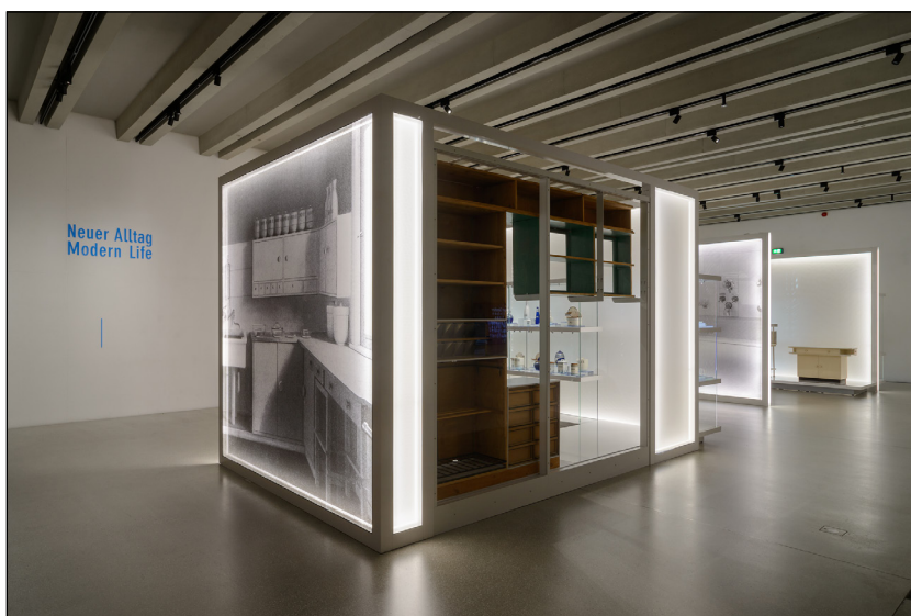
Figure 4: Exhibition view, new Bauhaus Museum, Weimar.