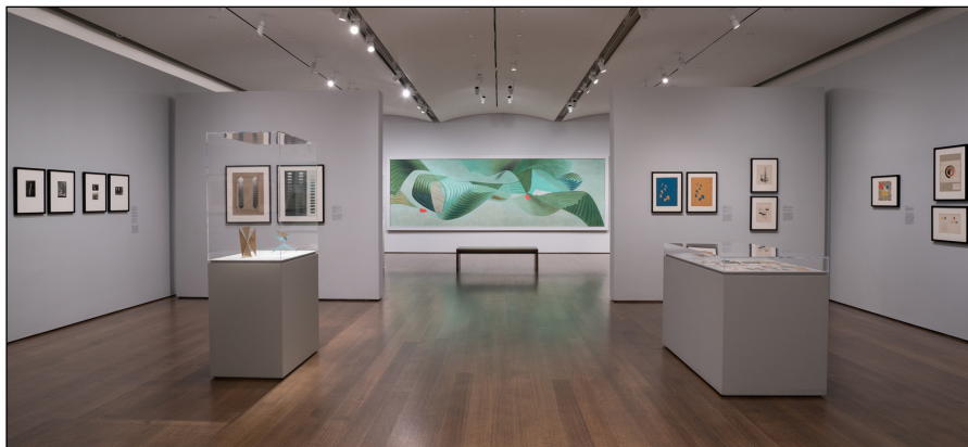
Figure 5: Herbert Bayer, Verdure , 1950. Oil on canvas. Harvard Art Museums/Busch-Reisinger Museum, commissioned by the Harvard Corporation, 1950.169. Artists Rights Society (ARS), New York/VG Bild-Kunst, Bonn.

Though I, too, appreciated the chance to see these Bauhaus works, I left somewhat disappointed. The Bauhaus and Harvard promised something it did not deliver — an