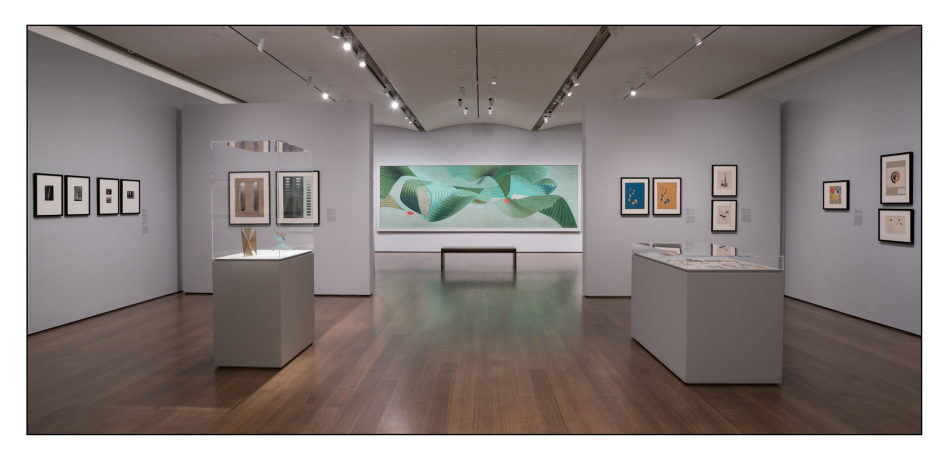
Figure 5: Herbert Bayer, Verdure , 1950. Oil on canvas. Harvard Art Museums/Busch-Reisinger Museum, commissioned by the Harvard Corporation, 1950.169. Artists Rights Society (ARS), New York/VG Bild-Kunst, Bonn.

Though I, too, appreciated the chance to see these Bauhaus works, I left somewhat disappointed. The Bauhaus and Harvard promised something it did not deliver — an