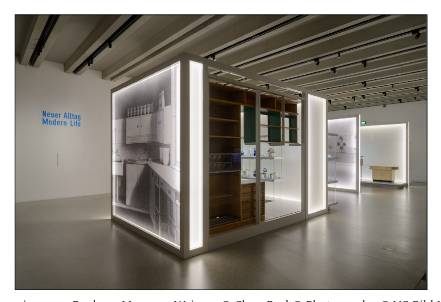
Figure 4: Exhibition view, new Bauhaus Museum, Weimar.