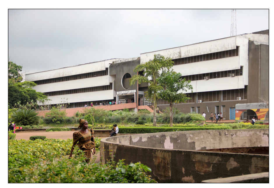
Figure 1: Ife Campus, Nigeria. Still from Zvi Efrat's documentary, Scenes from the Most Beautiful Campus in Africa , created as part of Bauhaus Imaginista , 2019.

The answer proved to be to move sideways, in an enormously ambitious global history project entitled Bauhaus Imaginista and curated by Marion von Osten and Grant Watson, which no longer focused on the school itself but on parallel developments around the world and the Bauhaus's sometimes tenuous relationship to them ( Figure 1 ). The material featured in those exhibitions