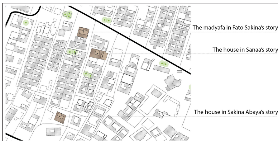
Figure 2: A map of Qustul showing the sites of the buildings in the three stories. Map by Menna Agha.

The events of this story occurred in the early 1970s, a few years after the move from Old Nubia when there was a surge in construction by displaced Nubians. Four of Sakina Abaya's children were in Qustul during the state-operated