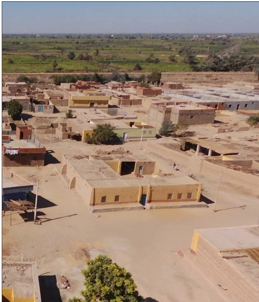
Figure 3: The house originally built by Sakina Abaya for her son in the early 1970s. It is now occupied by her grandchild.

A madyafa is a common house that acts as a community centre in modern Nubian villages. The madyafa hosts events such as weddings, conflict resolution councils, community meetings, and many other events that require a large area (Figure 5). These community houses were post-displacement inventions; before displacement, such community events took place inside a Nubian house,