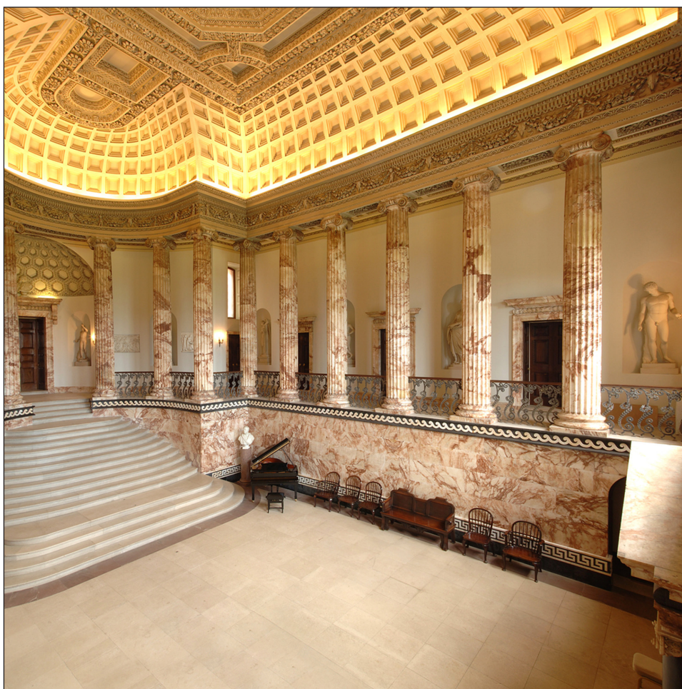
Figure 1: Interior of the Marble Hall, Holkham Hall, 1734–1765, Norfolk.

Antipathy to decoration in architecture remains latent in scholarship, architectural practice, and taste despite theoretical deconstruction of modernist bias and recent historical revisionism. While ornament has, of late, been the darling of academic discourse, decoration remains its embarrassing country cousin. Consider the stone hall at Holkham in Norfolk ( Figure 1 ) and the intarsia façade of Santa Maria Novella in Florence ( Figure 2 ): unlikely bedfellows, yet in the doldrums of the historiographical imaginary, kindred spirits. Among the best-known examples of their kind, images abound in survey and monograph, accompanied by discussion of formal genealogy, architectural invention, and cultural resonance. Rarely do matters of decoration arise. A volume on Houghton devotes a few lines to the achievement of the fluted and cabled columns whose timber core is sheathed in a thin layer of Staffordshire alabaster, which consumed the energies of marble masons for a period of two years (Schmidt, Keller, and Feversham 2005: 124). At Santa Maria Novella, this 'dazzling point of arrival' for the great processions of