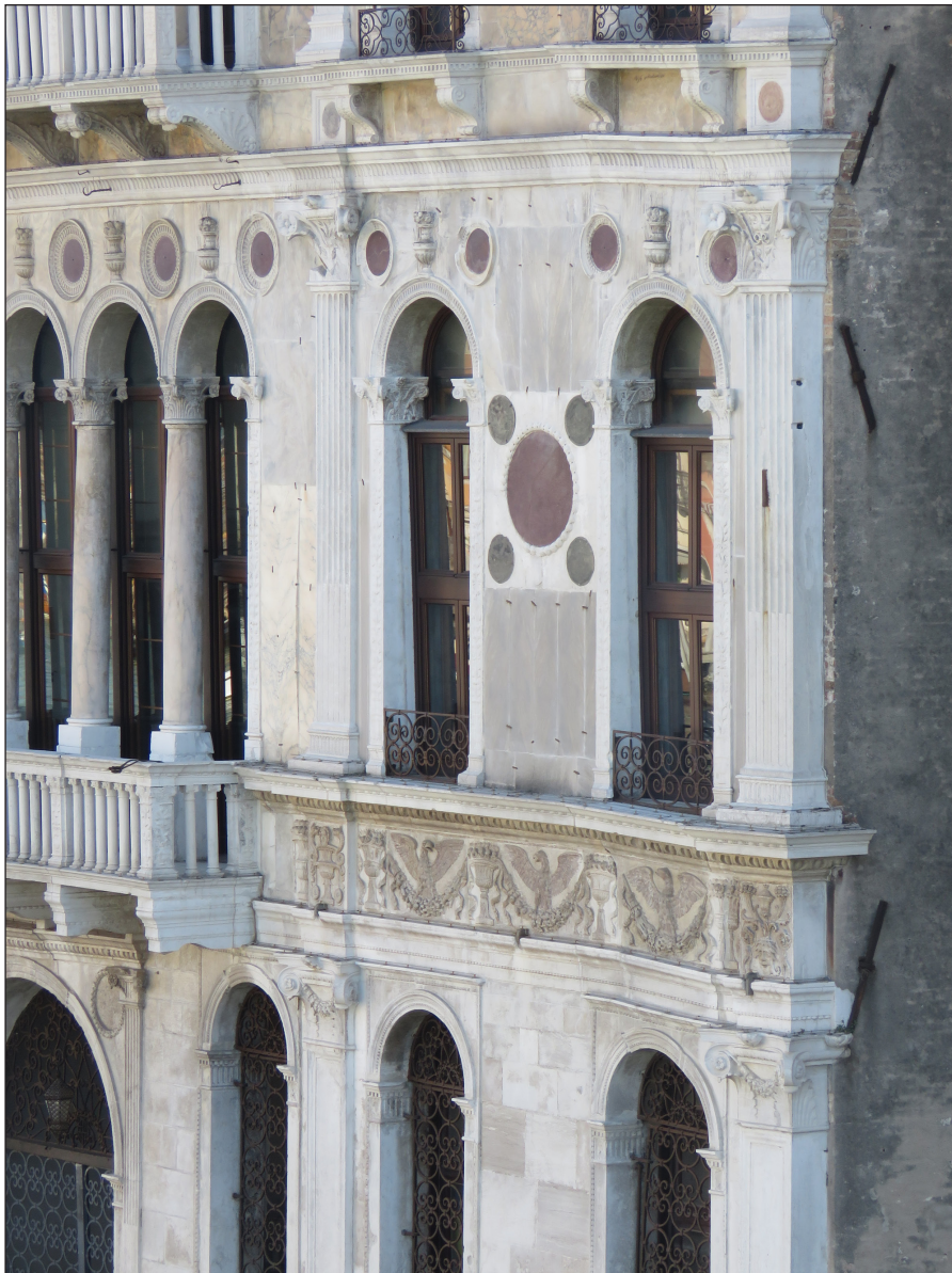
Figure 8: Palazzo Contarini del Zaffo, Venice, detail of late 15th-century façade.

symbolism were recognised as characteristic of this 'visual rumination', a 'particular and necessary mode of communication between groups of individuals linked by an activity, a belief, common and particular emotions' (Sauron 2000: 70–71). An even broader range of topics was accommodated by Gülru Necipoğlu and Alina Payne at a Harvard conference of 2012, which embraced, among others, themes of trans-mediality, hybridity, luxury, and surface agency (Necipoğlu and Payne 2016). Calligraphic conventions migrate to tiled surfaces; textiles to sgraffito facades; printed vignettes to walls, ceilings, and objects; and surfaces are now animated and vital elements of objects and buildings. These and other grand cornucopias of essays, which privilege multiple and complex historicities over the universalising narratives of the 20th century, excite and stimulate (Beyer and Spies 2012; De Cavi 2015; Dekoninck, Heering and Lefftz 2013). Sustained and focused scholarship is, however, more satisfying, such as Payne's cumulative work on ornament in early modern