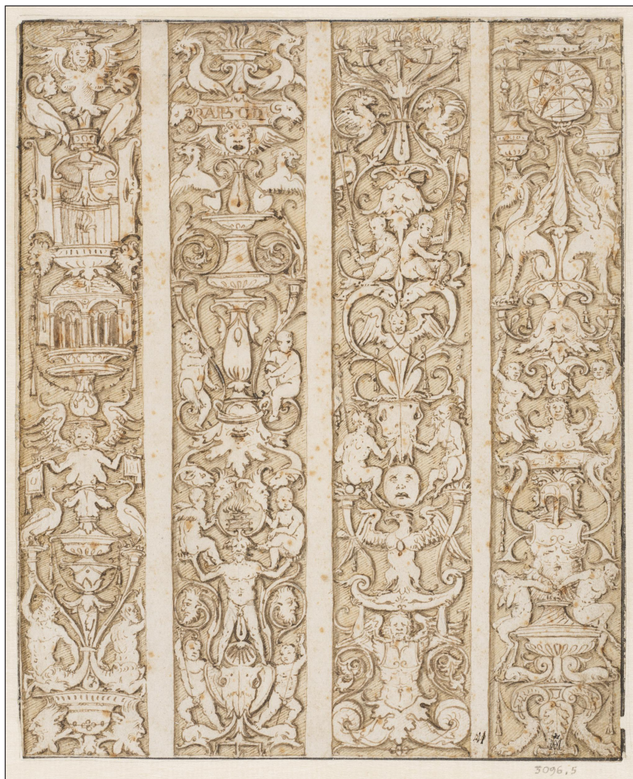
Figure 9: Attributed to Nicoletto da Modena, designs for panels of grotesque ornament, c. 1507. 'We have argued that ornament is concerned with making us see things as wholes, or in their relation to wholes ... it does this by creating borders or frames, by showing things in the "light" of their praise or perfection, or by mediating between particulars and the whole. When framing becomes over-elaborated, art becomes self-referential' (Guest 2015: 592).

rhetoric's role in shaping understanding of artistic and architectural production. For Clare Lapraik Guest, the 16th century represented a fall from grace: 'Once the grotesche are simplified and depopulated, they provide the lineaments of a decorative field in which ornament is without metaphorical significance or framing function, a beautiful yet inherently empty form of mediation between the beholder and the blankness of space' (Lapraik Guest 2015: 551) ( Figure 9 ). Likewise, in the high cultural ground of late Renaissance studies, the 'twirling lines' and 'frivolous curves' of rocaille decoration continue to evade respect (Hammeken and Hansen 2019: 20). Critique is not confined to the past and the effervescence of ornament in recent architecture, with its focus on affective experience and refusal of decoration's traditional rhetorical role, has drawn censure from Antoine Picon: 'it is as if ornament were contaminating structure instead of playing the complex game of supplementarity with it' (Picon 2013: 42). In