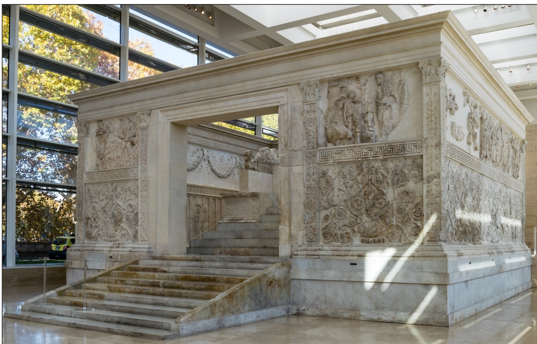
Figure 7: Ara Pacis Augustae, 13–9 BCE, Rome. Photo by Rabax63, 2017. Creative Commons Attribution-Share Alike 4.0 International license. https://commons.wikimedia.org/wiki/File:Ara_Pacis_(SW).jpg .

'No other extant classical monument accorded so much of its programmatic imagery to complex vegetal or floral themes of this kind, and no other classical monument demonstrates so emphatically the level of importance that this type of decoration could assume ... far more than pure decoration; to ancient observers they would have appeared no less meaningful than fully anthropomorphic sculptures' (Castriota 1995: 12, 58).