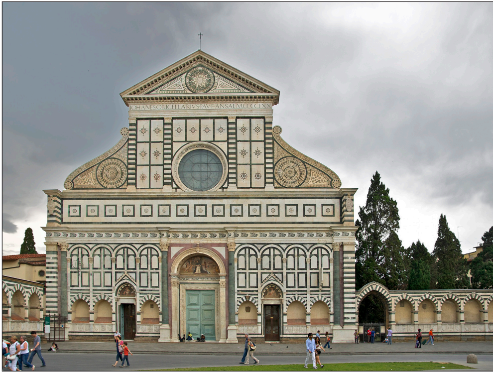
Figure 2: Santa Maria Novella, facade c. 1458–1470, Florence. Creative Commons CCO 1.0 Universal Public Domain Dedication. Photo by Jebulon, 2011. Creative Commons CCO 1.0 Universal Public Domain Dedication. https://commons.wikimedia.org/wiki/File:Santa_Maria_Novella_Florence_fa%C3%A7ade.jpg .