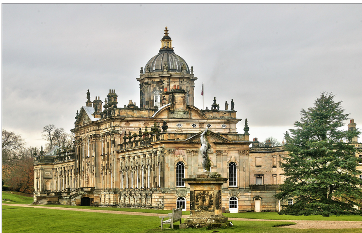
Figure 5: Castle Howard, begun 1701, North Yorkshire, England.