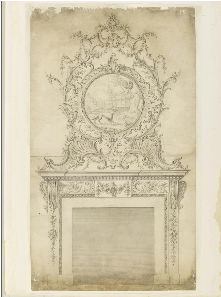
Figure 4: Design for a chimneypiece and overmantel by L. Snetzler, 1757. Venturi's reductionist analysis glosses over the complexity, fluidity and intense 'plasticity' of Rocaille decoration: 'Some of Wright's early interiors parallel in the motif of the wood strip the rocaille-filled interiors of the rococo. In Unity Temple and the Evans House these strips are used on the furniture, walls, ceilings, light fixtures, and window mullions, and the pattern is repeated on the rugs. As in the Rococo, a continuous motif is used to achieved a strong whole expressive of what Wright called plasticity' (Venturi 1966: 96–97).

late 20th century. A broad narrative of British architecture judged Palladianism to be simply unconcerned with interiors (Worsley 1995: 197), while a monograph on Castle Howard, though acknowledging that the carver Henri Nadauld was 'at least as much as Vanbrugh ... responsible for the liveliness and surface animation of the two main facades', nevertheless devoted little attention to his work (Samaurez Smith 1997: 63–66).