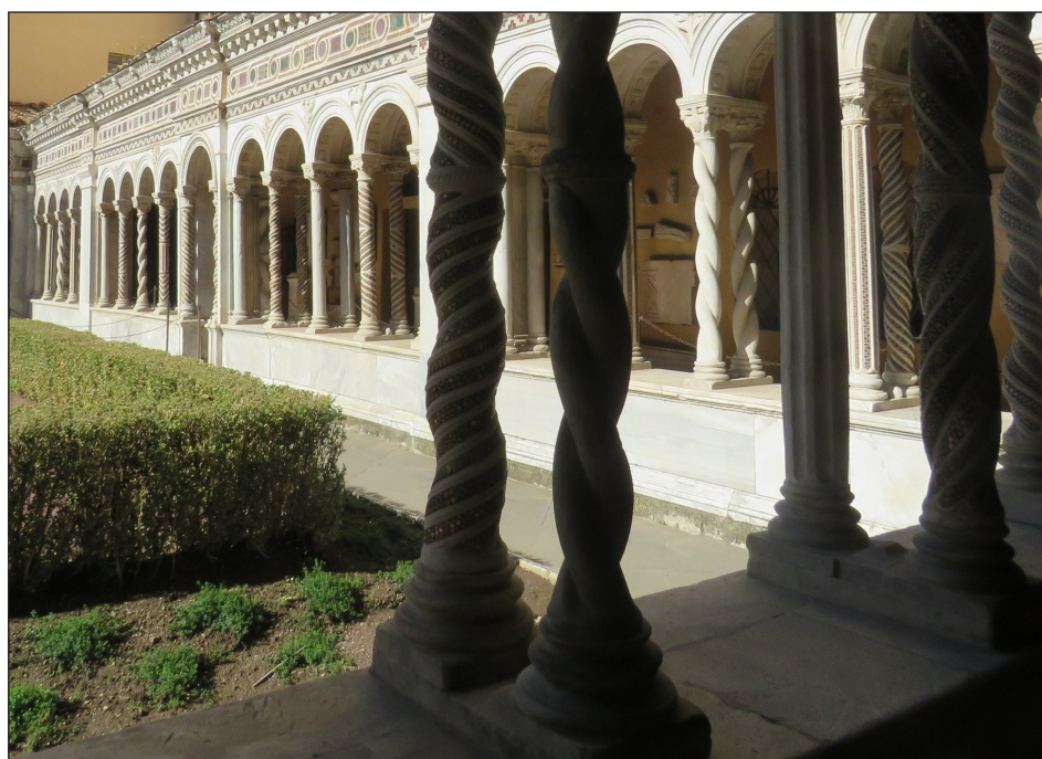
Figure 3: Restored cloister of San Paolo fuori le mura, Rome, completed 1214. Photo by Christine Casey, 2017.

jewel-like surfaces had enthused architects in the 1890s, were among the sitting ducks subjected to the yardstick of spatiality; 'above all, these masters lack in their works a true experience or sense of space and volume, concentrating their efforts on flat surfaces, horizontal and vertical' (Creti 2009: ix).