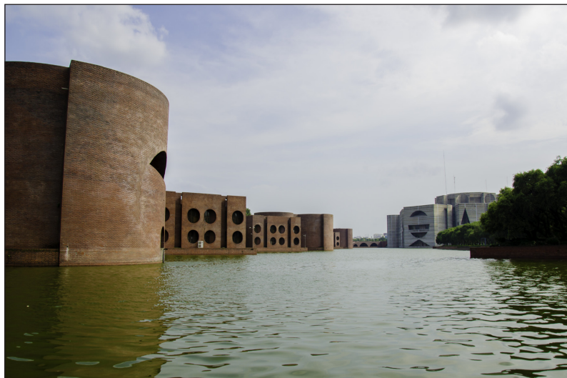
Figure 5: Louis Kahn, Jatiya Sangsad Bhaban (National Parliament House), Dhaka. Exterior view, with lakeside parliamentarians' facilities in brick buildings at left. Photo by Nahid Sultan and Saiful Aopu, 2014. Wikimedia, License: CC BY-SA 3.0, https://creativecommons.org/licenses/by-sa/3.0/deed.en .