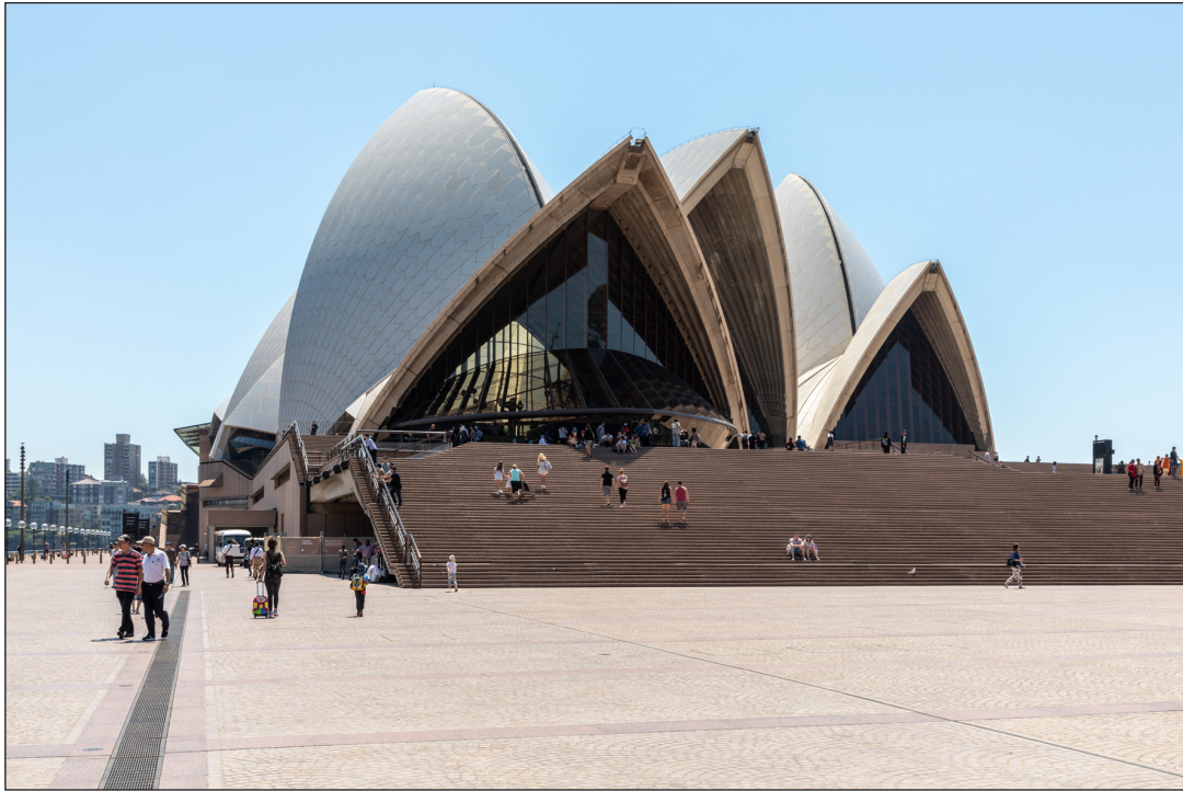
Figure 3: Sydney Opera House: view from southwest. The main halls are reached from the podium stairs, also by way of internal stairs from a porte-cochère directly underneath. Photo by Dietmar Rabich, 1962. Wikimedia Commons, Licence: CC BY-SA 4.0, https://creativecommons.org/licenses/by-sa/4.0/ .