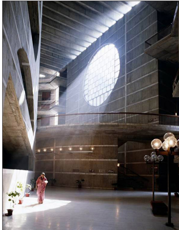
Figure 4: Louis Kahn, Jatiya Sangsad Bhaban (National Parliament House), Dhaka. Interior view. The building accommodates a complex inner community, with a scale and grandeur larger than its individual members.