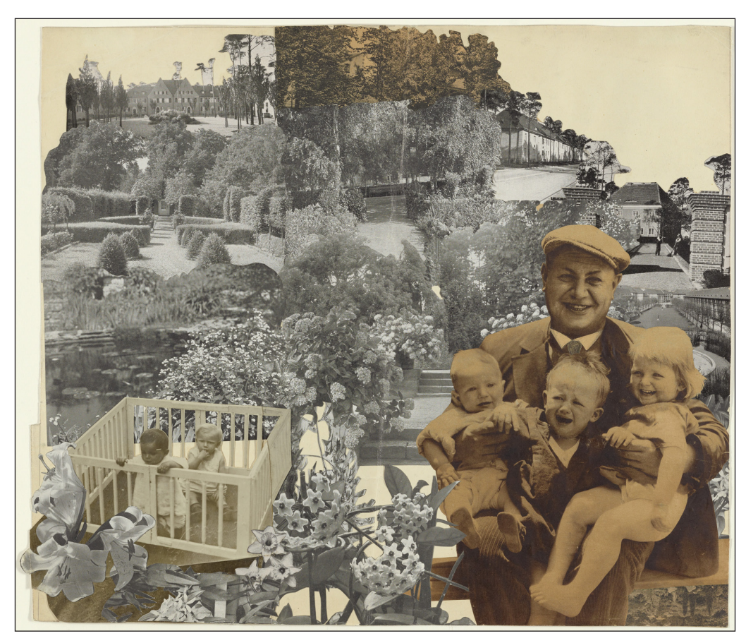
Figure 9: László Moholy-Nagy, cover design for Spandau-Haselhorst Housing Development Prospectus, about 1928–1929. Gelatin silver print, 42.7 × 49.4 cm. The J. Paul Getty Museum, Los Angeles.