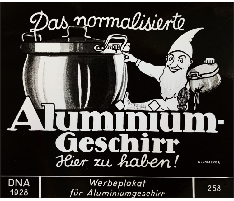
Figure 7: Advertisement for standardized cooking pots by the DIN [then DNA], 1928. Bundesarchiv BArch, N 1151/43.

Rather than getting caught up in the duster, the goal of the expert housewife was to eliminate all the obstacles, unnecessary work and material excess that undermined those essential intellectual, spiritual and cultural values — and the nation's economy. After all, for Lüders 'home economics is macro-economics!' (Lüders 1927: 13): 'housewives' were not just informed consumers of standardized goods (and therefore participants in the national economy), but culture-makers on a par with architects or politicians. Hence, their work was as important for the norm effort as that of the DIN engineers. While acknowledging that 'up to now, a large part of the German population has not conceived of home economics as part of the national economy', Lüders pushed the DIN's agents to develop norms for homes not only in relation to architecture but in domestic terms (Lüders 1927: 10).¹² And the DIN followed up (Fig. 7). A report of a meeting on 5 March 1927 to discuss norms for the Kleinwohnung lists as participants 'representatives of the architecture profession, housewife committees, furniture sellers, houseware stores and the furniture industry' ('Mitteilungen des Deutschen Werkbundes' 1927).¹³