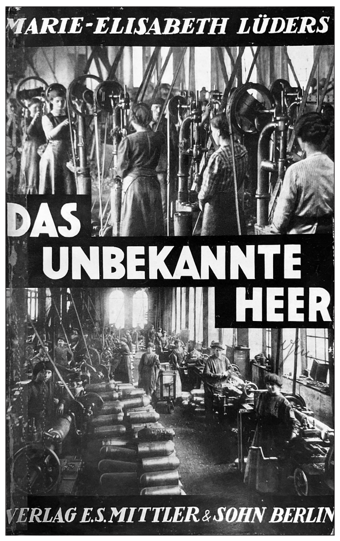
Figure 1: Cover of Marie-Elisabeth Lüders, Das unbekannte Heer [The Unknown Army] (1936), displaying photographs of women working in factories during WWI.

The red-hot wire rods rattled and hissed closer along the roller line. At its end, a platoon of most robust women in men's clothes and leather aprons stood ready to catch them with mighty tongs. A tough grip, the sparking snake was caught and flew