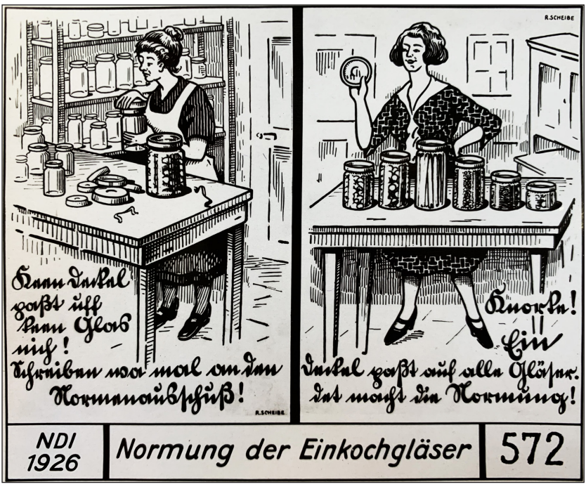
Figure 6: Advertisement for standardized Weck jars by the DIN [then NDI], 1926. Bundesarchiv BArch, N 1151/43.

The reforms pursued by modern architects and the DIN related to both the built environment and the domestic life that took place within it. Soon after regulating the architectural elements itemized by Lüders, the DIN undertook to standardize household objects such as jars and cookware. Since it was not a government agency but depended on (largely voluntary) market compliance, it commissioned advertisements depicting its vision of a DIN-ordered universe. One ad showed a shelf with a diverse array of Weck jars, each with its own lid size; proclaiming 'Unification saves Time and Money', it demonstrated how the introduction of a new norm, where 'one lid fits all', would liberate the housewife from the hassle of going to several shops to find a suitable fit (Fig. 6) (Deutscher Normenausschuss 1927).