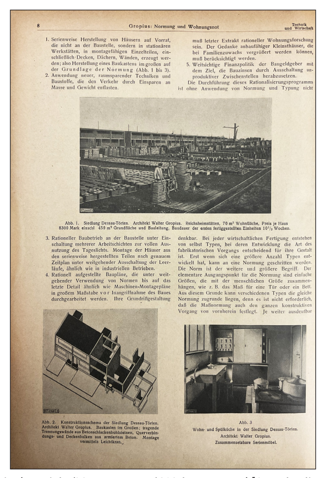
Figure 4: Walter Gropius's article 'Normung und Wohnungsnot' [Standardization and Housing Shortage] in Technik und Wirtschaft (1927: 8).

Where the Neues Bauen (New Architecture) aimed to give Germans a new home, the Neue Haushalt told them how to live most efficiently in it (Meyer 1932). In 1926, Lüders (1927) gave a speech, 'Norming and Household', at the annual meeting of the DIN, right after a talk called 'Norming and the Housing Shortage' by Walter Gropius (1927), an early collaborator of the institute, who was then working on his Dessau-Törten housing estate, conceived as a model for cost-effective mass housing based on standardized parts and industrial construction processes (Figs. 4 and 5).