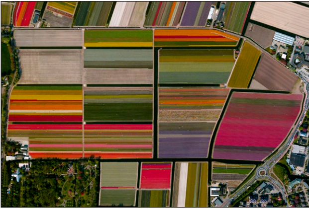
Figure 2: Fields of Tulips, Lisse, The Netherlands.