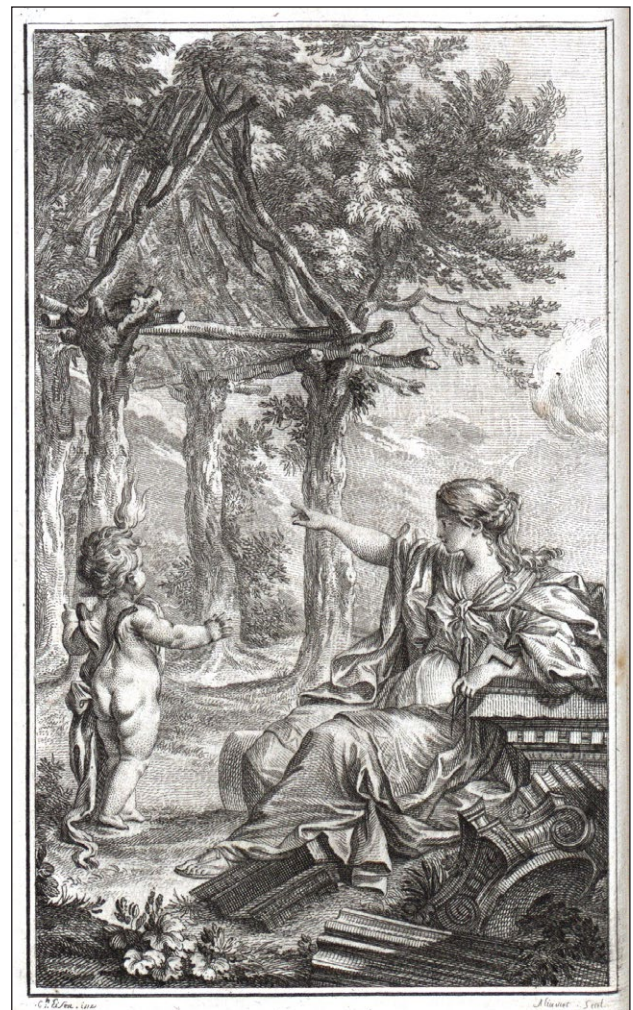
Figure 3: 'The Primitive Hut', frontispiece of the second edition of Marc-Antoine Laugier's Essai sur l'architecture , 1755. Designed by Charles Eisen.